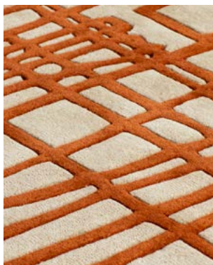
01 - Ocre

Technique: Hand tufted Composition: 100% New Zealand wool Texture: Cut Size: 137,8 x 98,4 inches Pile height: 0,47 inches Price per meter: 933 £