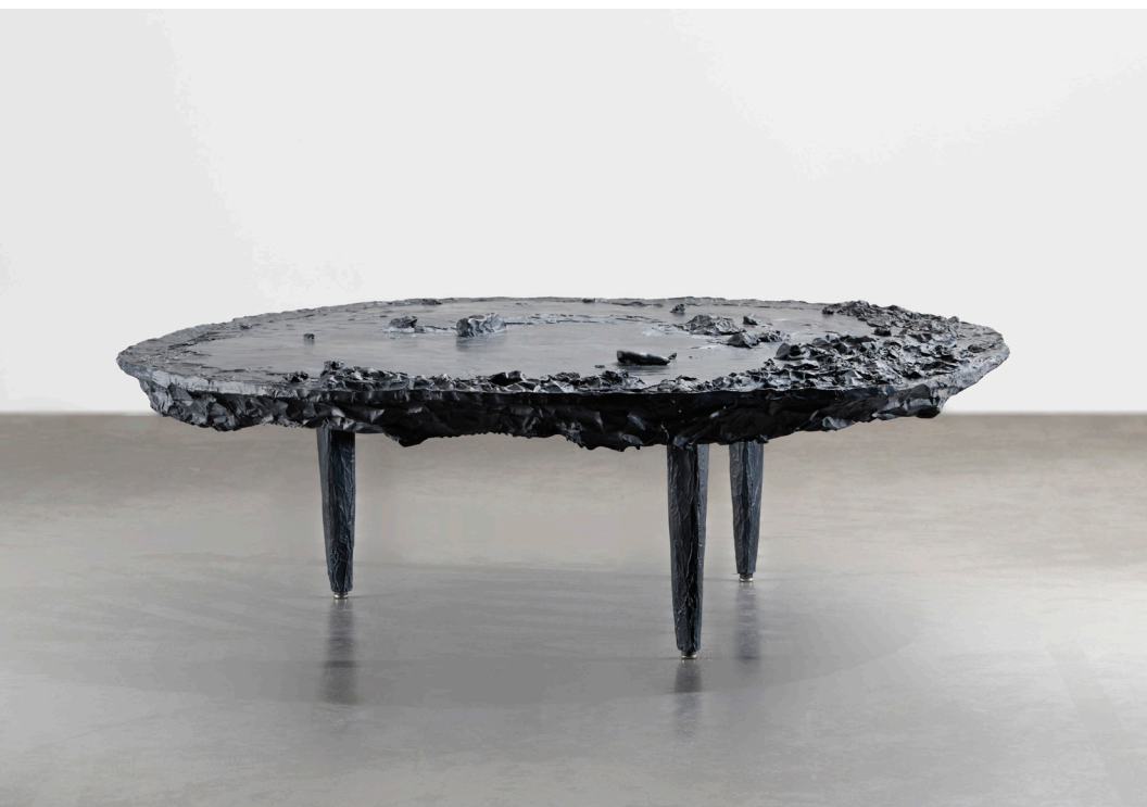
Angelika Markul, Tchbouri , 2022

Conceived as an artistic manifesto, the "Interiors" exhibition does more than simply illustrate a living space : it invites us to experience art at the heart of everyday life. ColAAb affirms its vocation : to entrust visual artists with the task of exploring functionality without artistic compromise. Each work becomes a presence that is both plastic and functional, an invitation to collect and to live differently — in resonance with Grand Tour, a new venue dedicated to experimentation and exchange between players in the art market.