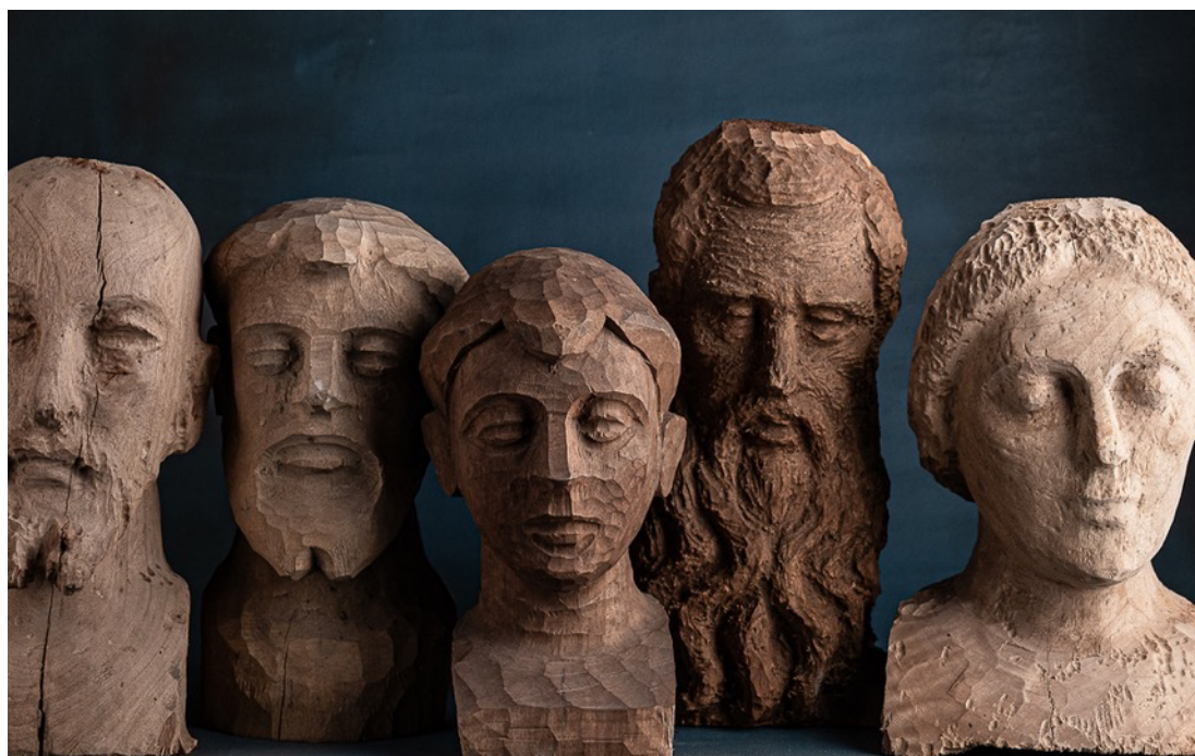
Saints as inspiration for the new heads by Klatt Objects (from left): Saint Joseph, Pio, Saint Anthony, Moses and Agnes

Strength, tranquillity, contemplation, hope. Each bust tells its own story. What that story is lies in the eye of the beholder. A total of six new characters will enrich the Klatt Objects collection this spring.