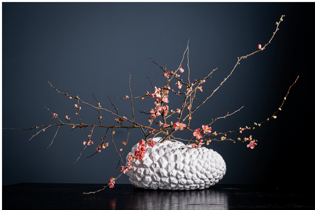
Designed by Nature: The vase object 'Metamorphose Testudinaria' by Klatt Objects

Detlef Klatt once again demonstrates how fascinating nature itself is with his latest collector's item. The elaborate vase object is dedicated to Testudinaria, a fascinating caudex plant from the warm regions of North and Central America. Its characteristic feature is a large, deeply furrowed tuber, which is why the species is also called Elephant's Foot or Turtle Plant. In nature, the stem can grow up to 50 cm thick. At Klatt Objects, the 'Metamorphosis Testudinaria' measures 45 cm in length and 30 cm in width. It is made from the finest, traditionally produced bone china and sprouts the most beautiful shoots from twelve openings of different sizes.