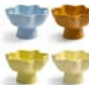
Bowl sun set of 4 2838-08