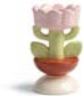
Candle holder blume extra large 3248-01