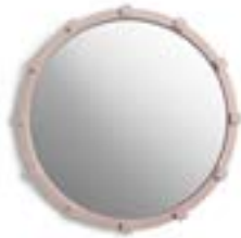
Mirror chunk large pink 1665-01