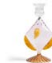
Candle holder fish pink 2186-08