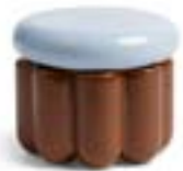
Jar charlo brown 1522-05