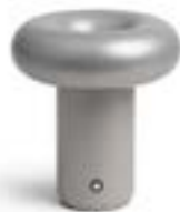
Lamp portable glimpse frosted silver 2757-01