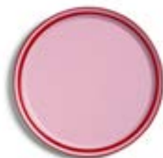
Tray vano small pink 5062-03