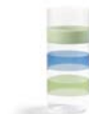
Vase lumo large 2907-01