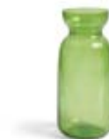
Carafe circus green 363-01