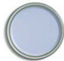
Tray vano large blue 5062-02