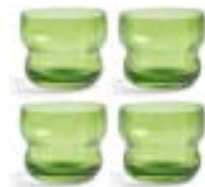
Glass circus green set of 4 363-02