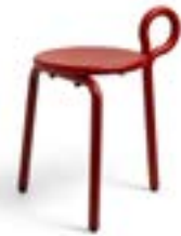
Stool 1asso red 3552-01