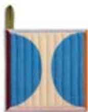
Pot holder stitch check 6046-03