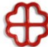
Trivet clover red 1475-12