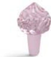
Bottle stopper whip pink 2323-17