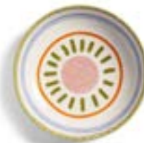
Salad bowl boavista green 2829-07