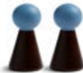
Hook halma burgundy set of 2 1801-06