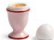
Salt & pepper egg pink 1799-32