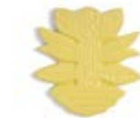
Trivet blume yellow 1475-08