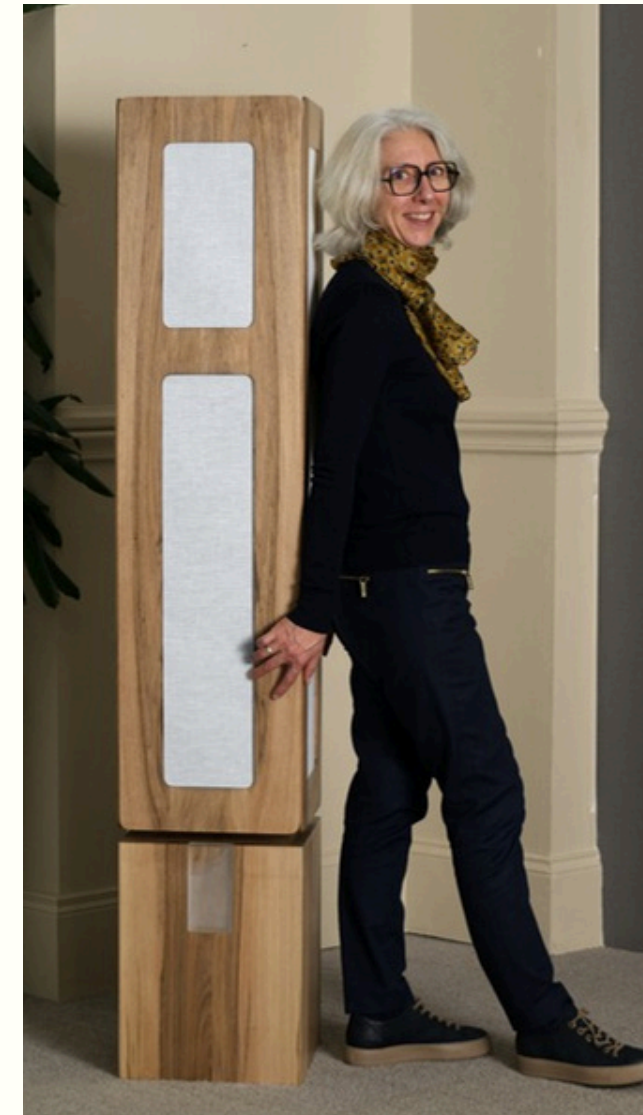
mervalero © Arthur Monfrais

Additional information: power supply and certifications available upon request