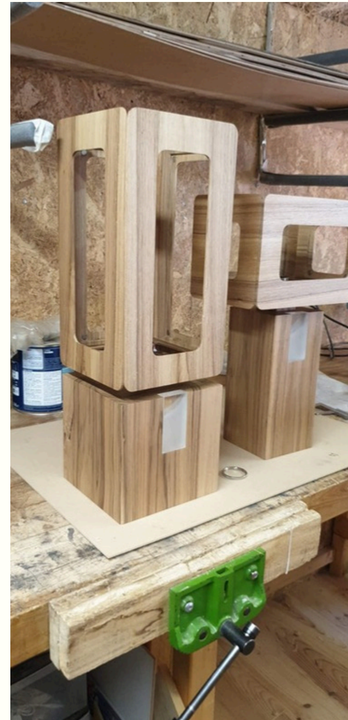
Atelier Gawood © BoSúil DESIGN

Even when the light is switched off, the experience continues.