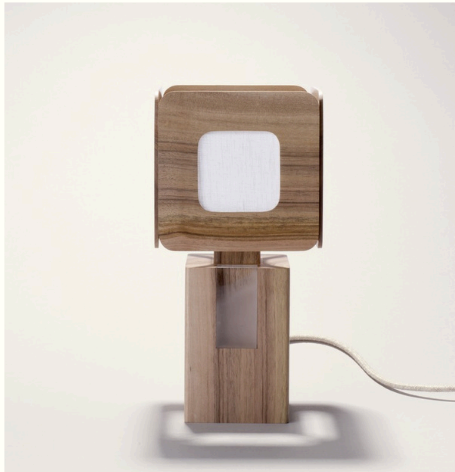
Vega BoSúil DESIGN © Arthur Monfrais

Table lamp, between decorative object and luminous presence.