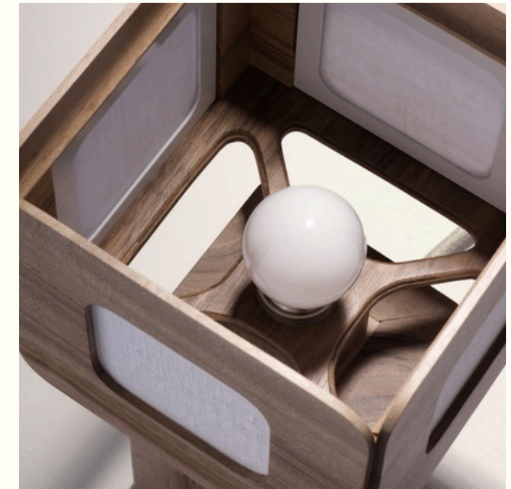
Vega BoSúil DESIGN © Arthur Monfrais