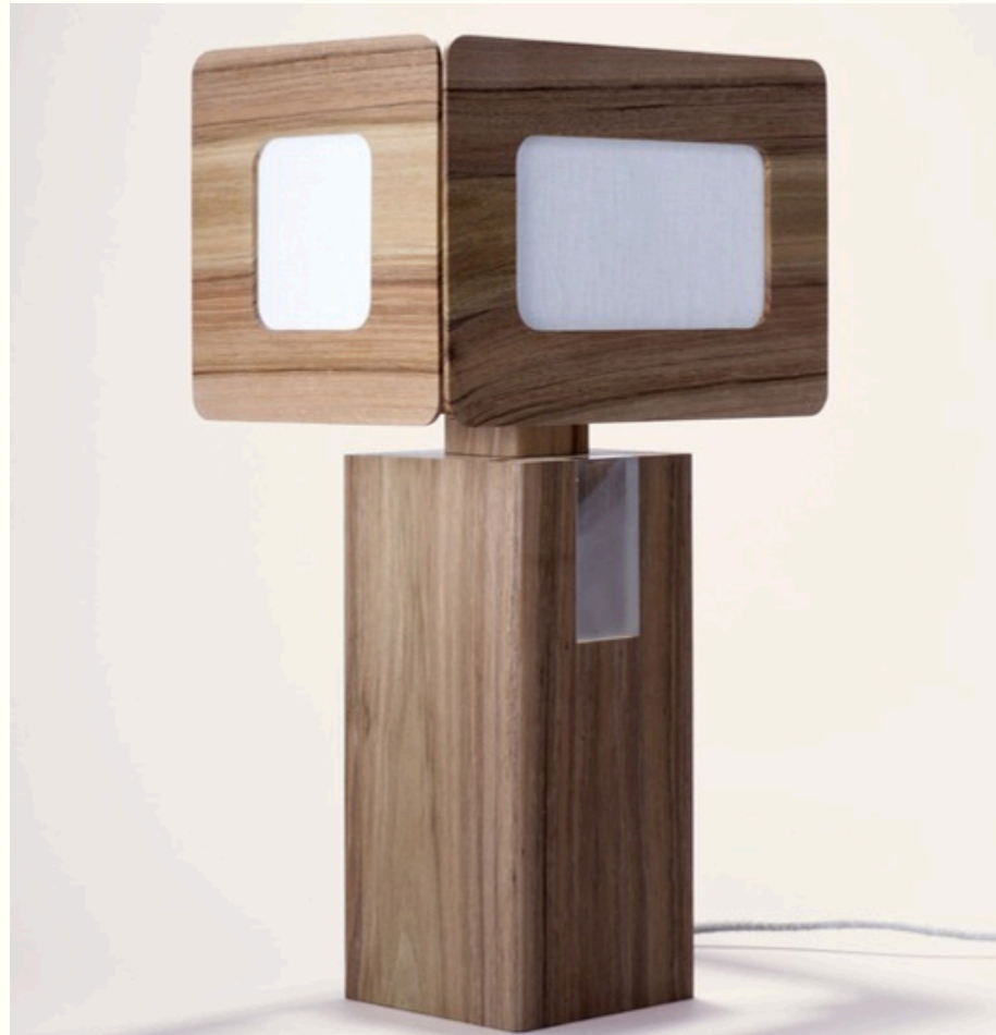
Alhena BoSúil DESIGN © Arthur Monfrais

Freestanding lamp, conceived through a singular relationship with space.