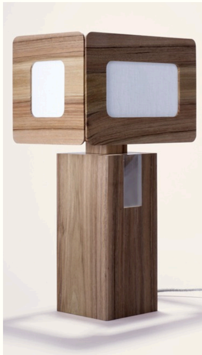
Alhena BoSúil DESIGN © Arthur Monfrais

A minimalist, contemporary aesthetic guides each creation: purity of line, balanced curves, a silent presence.