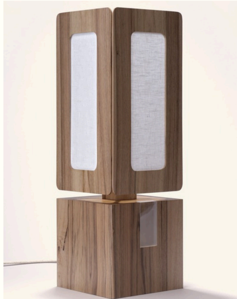
Geminga BoSúil DESIGN © Arthur Monfrais

Freestanding lamp, defined by confident, perfectly balanced proportions.