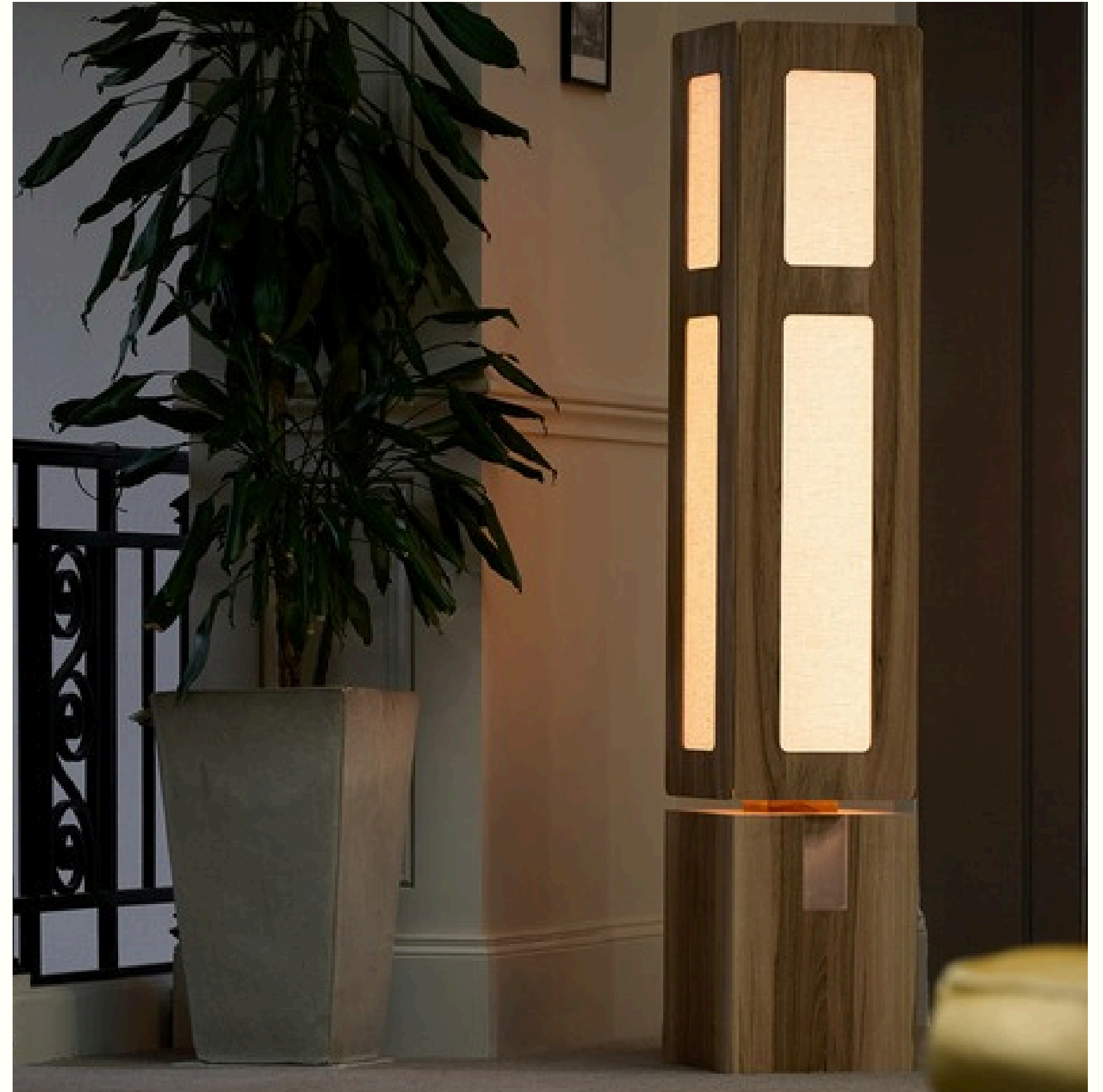
Capella BoSúil DESIGN © Arthur Monfrais