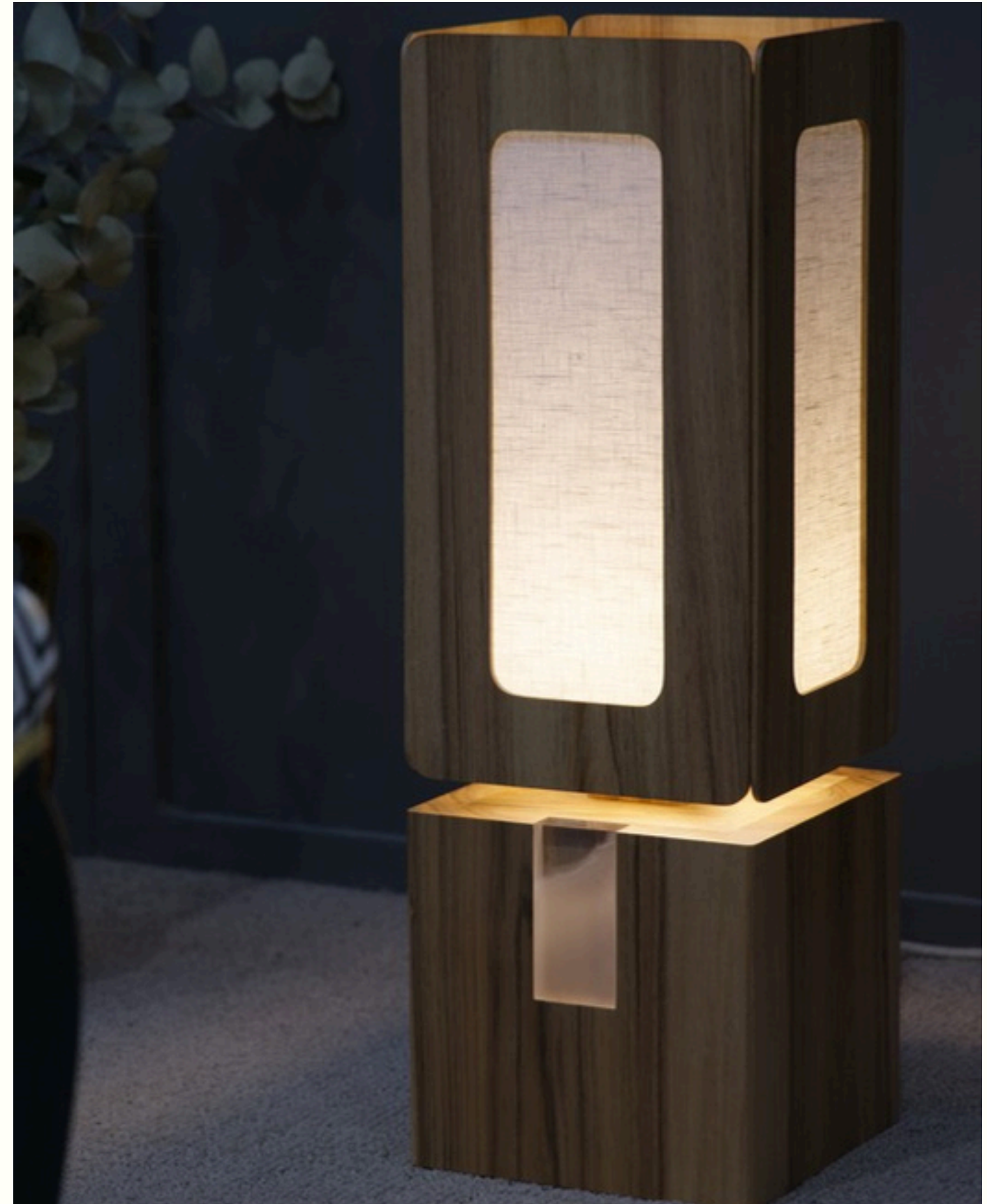
Geminga BoSúil DESIGN © Arthur Monfrais

Additional information: power supply and certifications available upon request