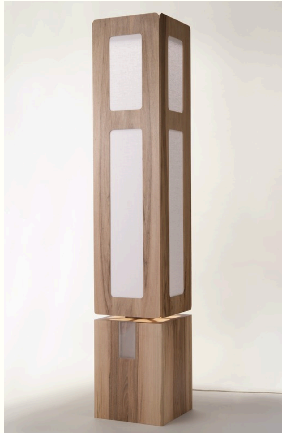
Capella BoSúil DESIGN © Arthur Monfrais

Exceptional floor lamp, an architectural presence.