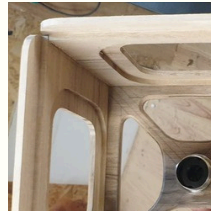
Atelier Gawood