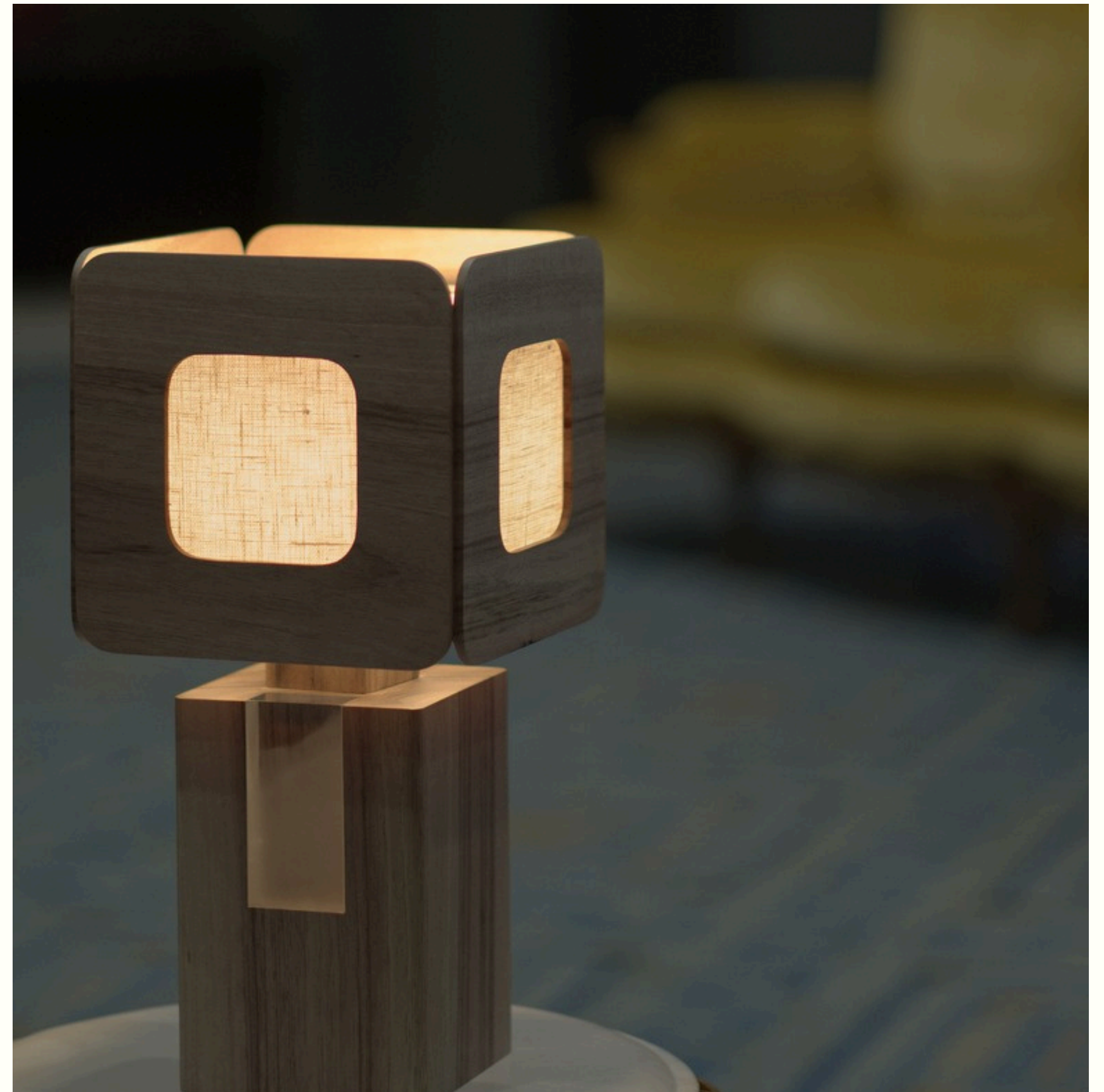
Vega BoSúil DESIGN © Arthur Monfrais

Additional information: power supply and certifications available upon request