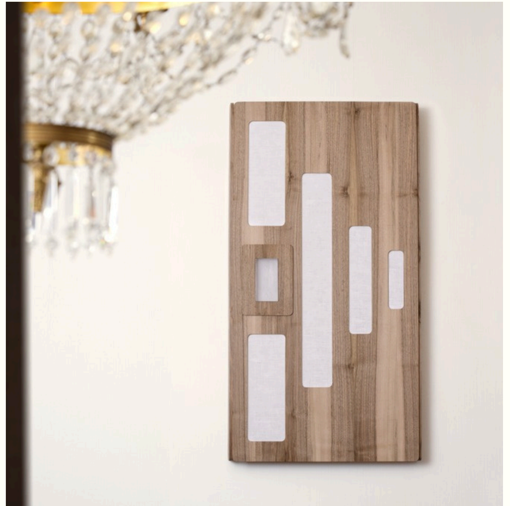
Surya BoSúil DESIGN © Arthur Monfrais

Each creation stands as an exceptional piece, combining contemporary character with a confidently timeless aesthetic.