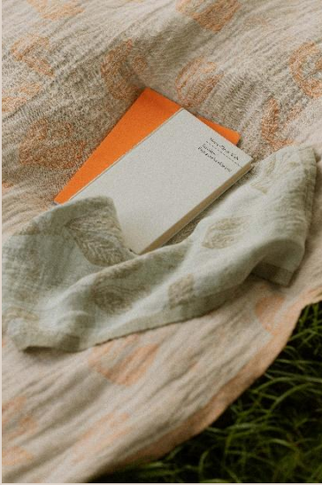
Kesäkukka tablecloth/blanket 145x260 cm and towel/napkin 46x46 cm 100 % washed linen Design Akira Minagawa