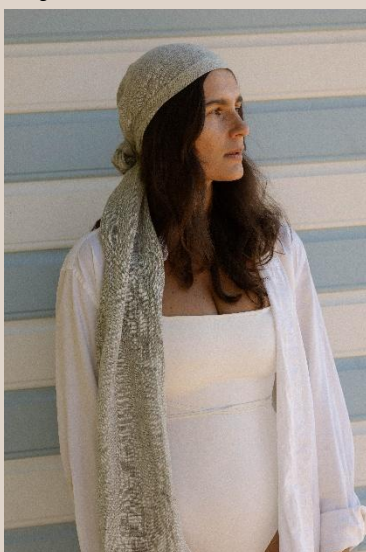
Lempi linen scarf 35x200 cm + fringes 100 % washed linen Design Team Lapuan Kankurit