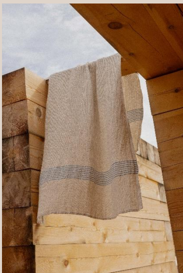
Puro towel 85x180 cm Washed Tencel-linen-cotton Design Elina Helenius