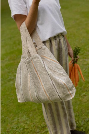
Tori bag 40x50 cm 100 % washed linen Design Elina Helenius