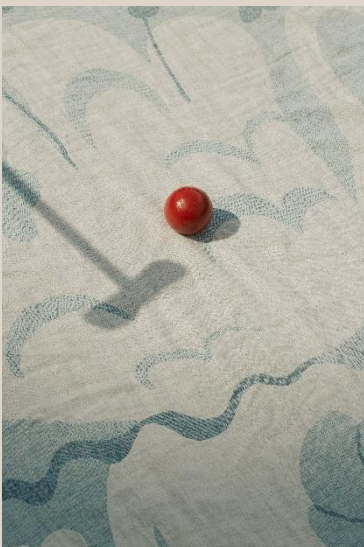
Kaksin linen blanket 145x200 cm 100 % washed linen Design Armi Teva