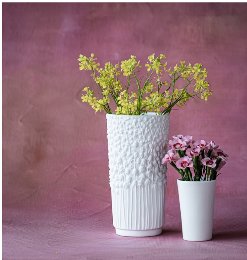
Contemporary sensuality: FLORA Convallaria vase (left) with FIFO cup. © Klatt Objects

Between romantic floral enchantment and contemporary minimalism: With the new FLORA Convallaria vase, Klatt Objects adds a timeless statement to the FLORA series that combines sensual lightness with artisanal craftsmanship. In the fine workmanship, each individual lily of the valley is incorporated into the matt surface of the traditionally manufactured bone china. The delicate, slightly playful decoration contrasts excitingly with the simple, conical silhouette. Tip: The FLORA Convallaris harmonizes particularly well in an arrangement with the newly launched FIFO cups.