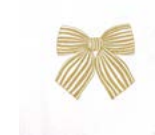
Cocktail napkin Nœud or en intissé 25 x 25 cm unfolded - Pressed cellulose fibers – Fabric-like feel and appearance Designed and made in France €4,40 per pack of 20 napkins*