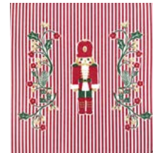
Dinner napkin Casse-noisette en intissé 40 x 40 cm unfolded - Pressed cellulose fibers – Fabric-like feel and appearance Designed and made in France €8 per pack of 20 napkins*