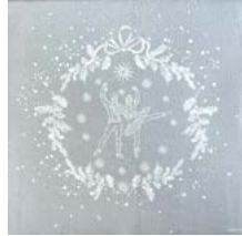
Dinner napkin Danseurs argent en intissé 40 x 40 cm unfolded - Pressed cellulose fibers – Fabric-like feel and appearance Designed and made in France €8 per pack of 20 napkins*