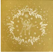
Dinner napkin Danseurs or en intissé 40 x 40 cm unfolded - Pressed cellulose fibers – Fabric-like feel and appearance Designed and made in France €8 per pack of 20 napkins*