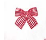
Cocktail napkin Nœud rouge en intissé 25 x 25 cm unfolded - Pressed cellulose fibers – Fabric-like feel and appearance Designed and made in France €4,40 per pack of 20 napkins*