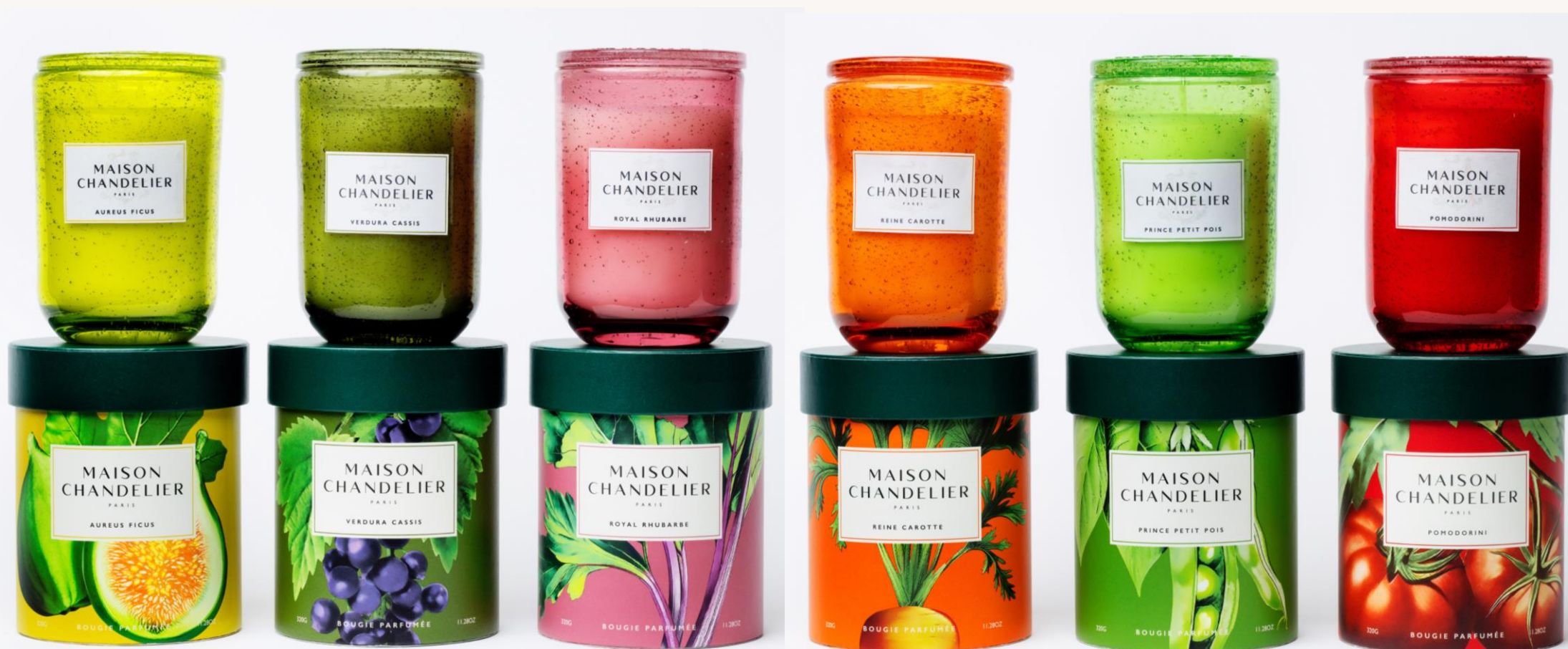
Figue Jaune Yellow Fig

with unique scents created by renowned perfumers using essential oils and flower and plant extracts, inspired by the vegetables and fruits of French vegetable gardens.