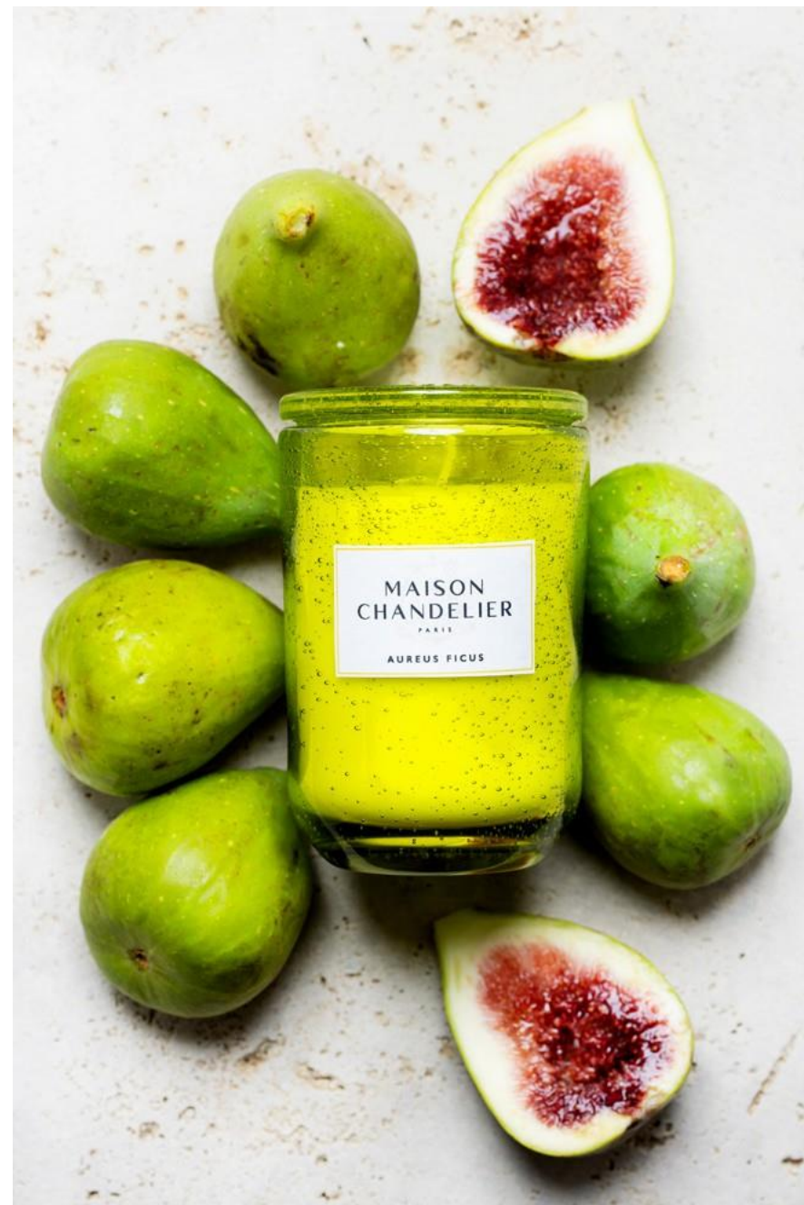
AUREUS FIGUS Childhood memory of napping under the trees