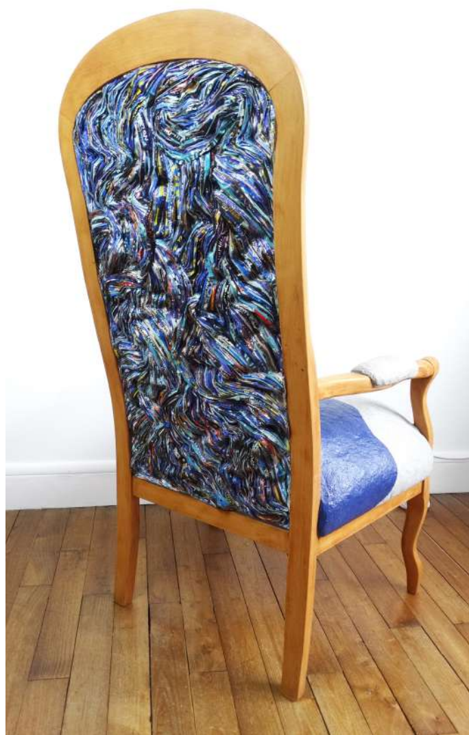
Armchair VOLTAIRE Recycled paper, wooden structure