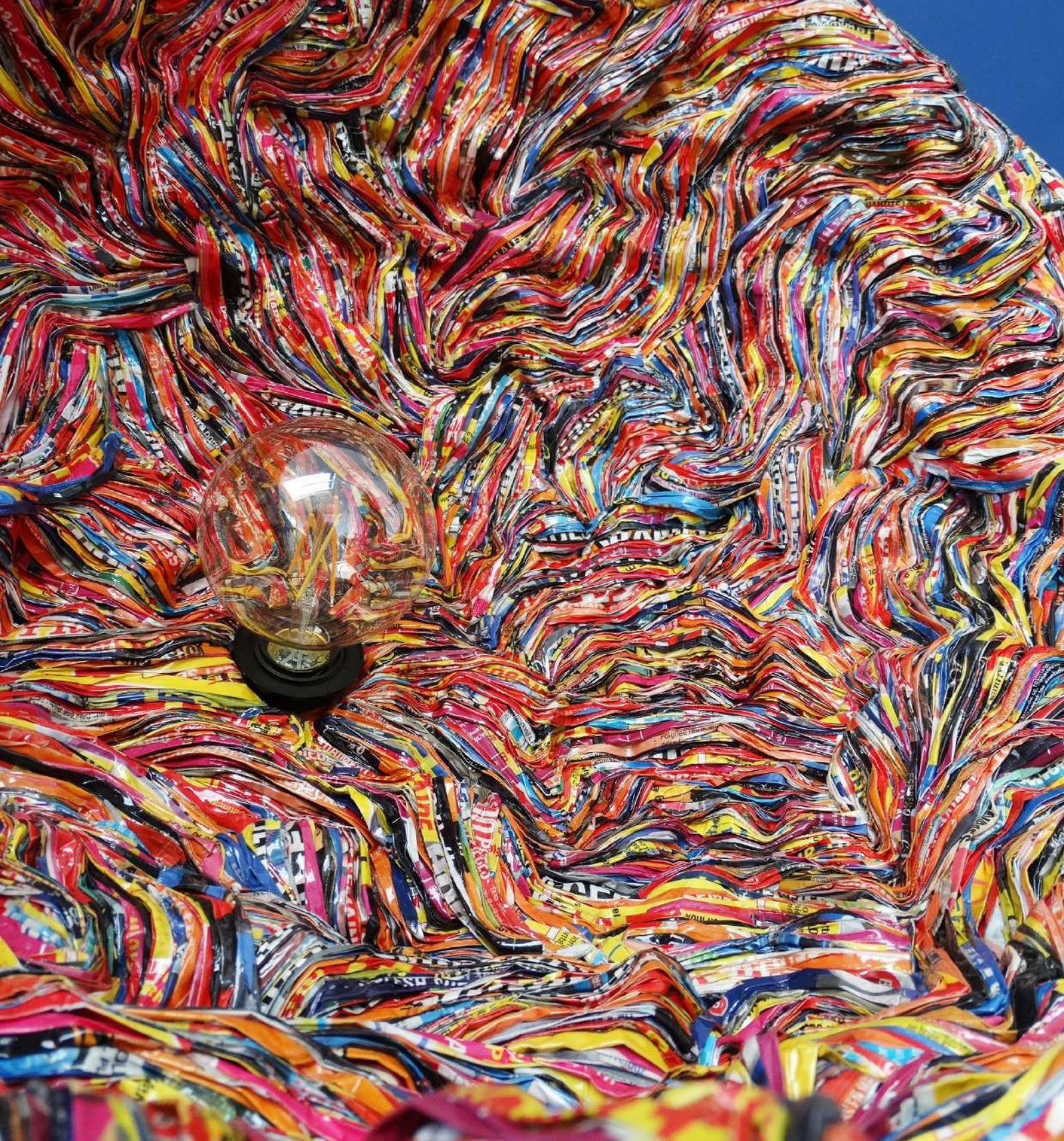
Collection lamp GALILEO 100% magazine paper