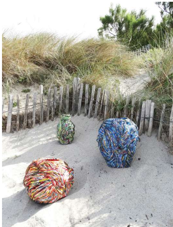
Vases collection ARVOR 100% magazine paper