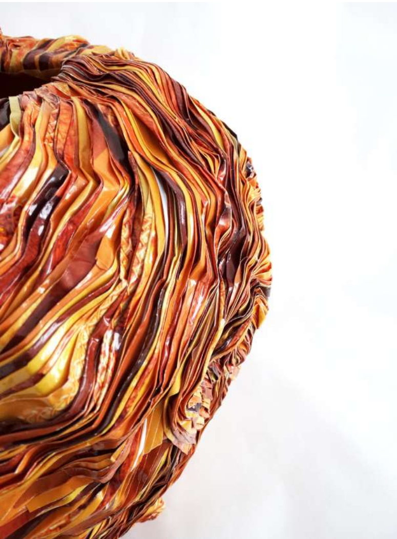
Vase Yellow, collaboration with Another Mondaen 100% recycled paper

2018 : Mo(ve)ment , S. Allende cultural centre, Saint-Malo