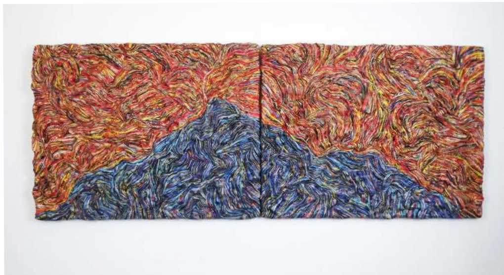
CHUZENJI Magazine paper Diptyque 180 x 70 cm