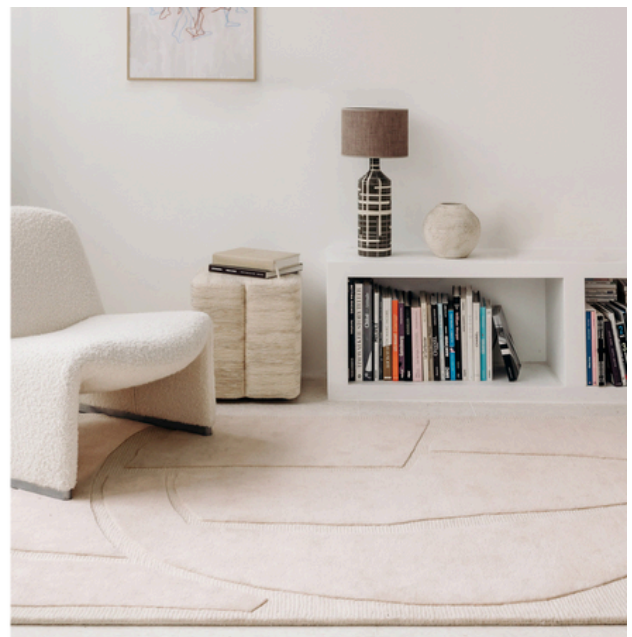
Tapis SAIL 160 x 230 cm | Prix : 795€ 200 x 290 cm | Prix : 998€