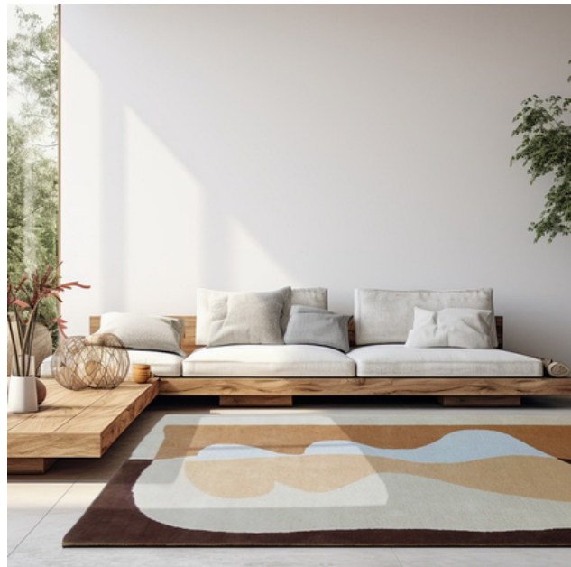
Tapis NARCISSE 160 x 230 cm | Prix : 795€ 200 x 290 cm | Prix : 998€