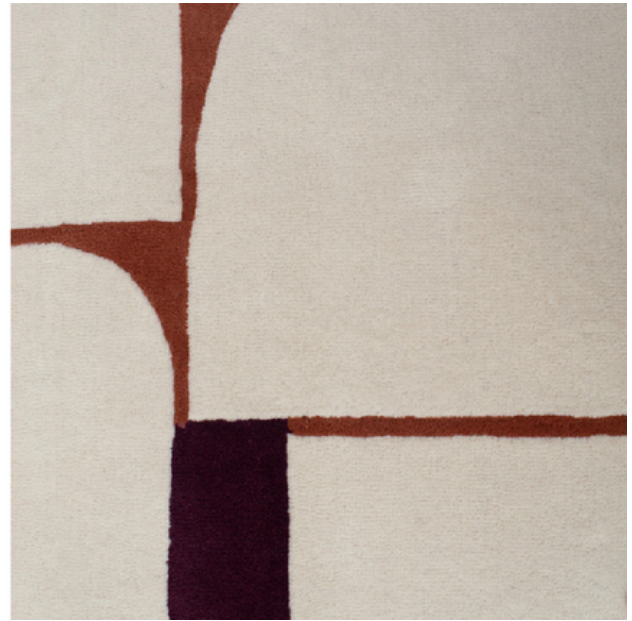
Tapis BINIBECA 160 x 230 cm | Prix : 795€ 200 x 290 cm | Prix : 998€