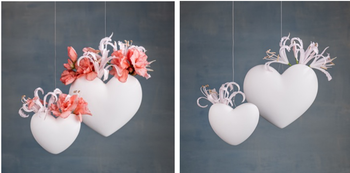
Favourite pieces in heart shape: FESTA hanging vases in two sizes

Free-floating and elegant: the FESTA hanging vases have been among the absolute favourites of the Klatt Objects collection since day one. By multiple request, Detlef Klatt, designer and founder of the boutique brand, has now expanded his bestseller series with two long-awaited models: starting this year, the FESTA hanging vases are available in a large and small heart shape, which are a delight for Valentine's Day and far beyond. The special highlight: the narrow openings of the hanging vases ensure that the delicate flowers are held securely, and without filling they serve as sophisticated design elements. The new FESTA hearts are available in two sizes, S (8 x 8 cm) and L (12 x 12 cm).