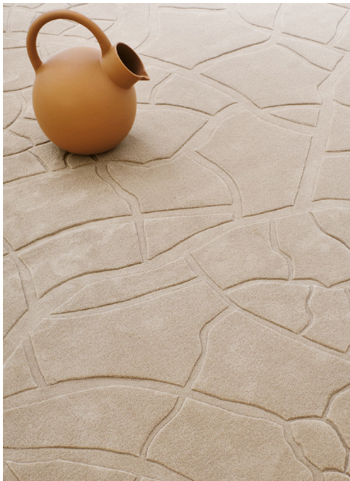
Climate Collection : Aride I

A new vision of design - Unlike previous collections, Climate stands out for its conceptual approach and inspirations drawn from landscapes often perceived as hostile. This exploration of raw nature and its contrasts offers an innovative perspective, reinforced by a unique technical and aesthetic mastery.