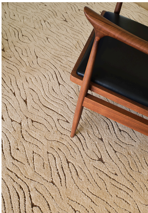
Climate Collection : Namib

Noble materials and craftsmanship - Made from pure virgin wool or an exclusive blend of wool and silk, the rugs in the Climate collection are entirely hand-finished, guaranteeing unrivalled quality and authenticity. Carefully crafted textures offer a soft touch and captivating visual appeal, from light shades for soothing luminosity to more contrasting hues to assert the character of a space.