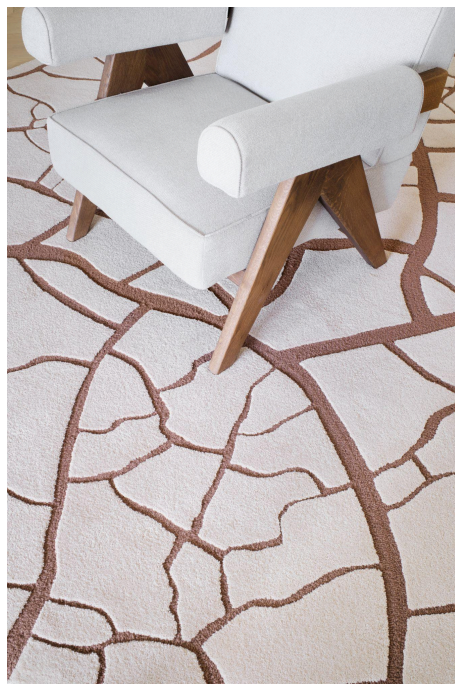
Climate Collection : Aride II