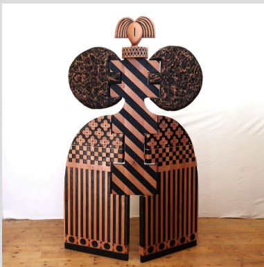
LA DAME DE TREFLE

For the past thirty years, I've been honing this recipe in total freedom, with my feet firmly planted in Brittany, working every day in my studio in Rennes.