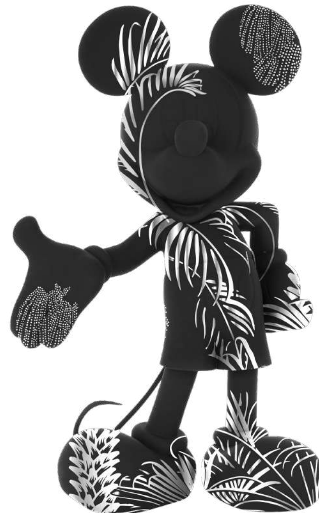
Star Style Mickey