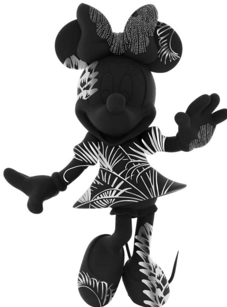
Star Style Minnie