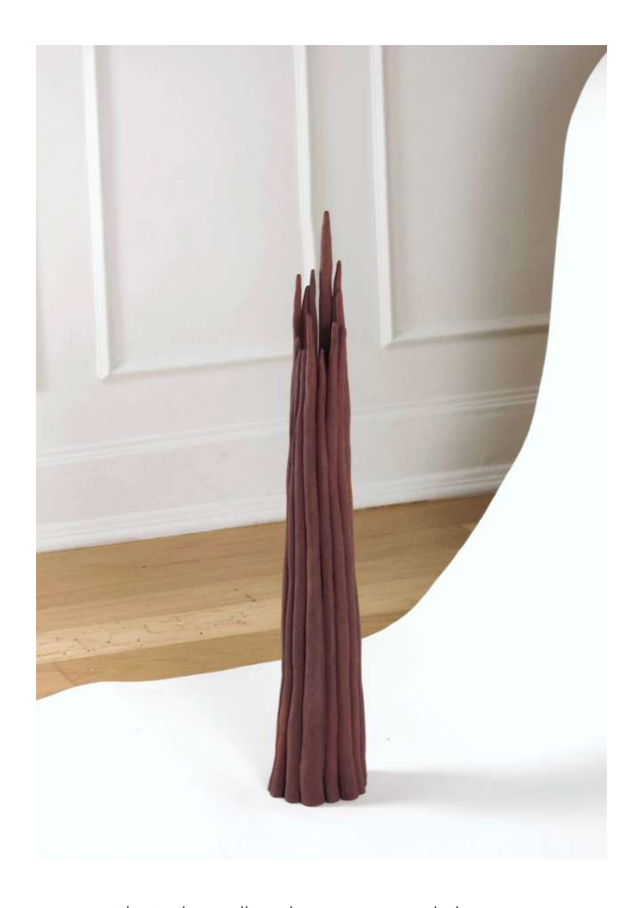
The Dali candlestick in carmine red chamotte

The designer joins the finest names in decoration and design in the SIGNATURE area at Maison & Objet (hall 7 - area C91), where iconic designs, beautiful materials and unique pieces offer furniture and home furnishings a blend of luxury, audacity and elegance.