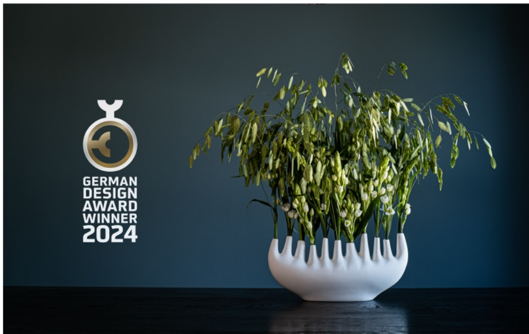
„Winner“ of the German Design Award 2024: vase Rhizom by Klatt Objects