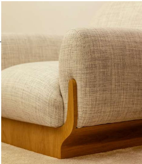
Copacabana armchair Shown in natural oak and special fabric

Available in custom sizes and materials upon request