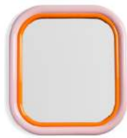
Mirror sleek pink