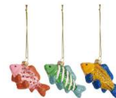
Ornament guppy 30 ass.