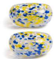
Bowl stipple blue set of 2