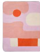
Carpet wispy pink