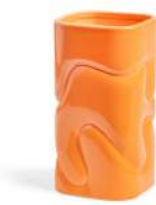
Vase puffy orange