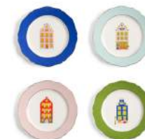
Plate canal house large set of 4