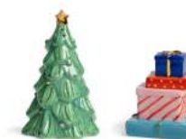
Salt & pepper merry