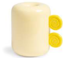
Vase snail yellow