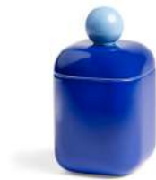
Jar orb blue