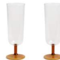
Flute mingle amber set of 2