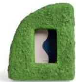
Photo frame chunky green