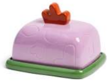
Butter dish sketch lilac