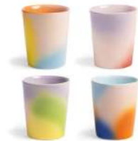
Mug hue large set of 4