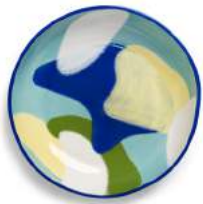
Salad bowl wasco blue