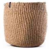
Brown SKU 3310