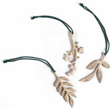
3 branches ornament set