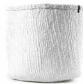
White SKU 1318