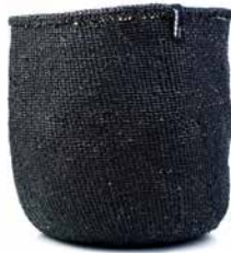
Black SKU 1411