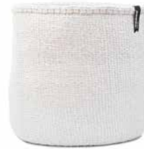
White SKU 1418