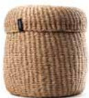
Brown SKU 3210T