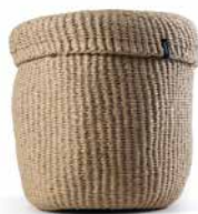
Brown SKU 3310T