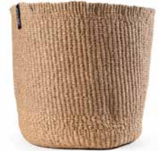
Brown SKU 3410