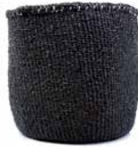
Black SKU 1311