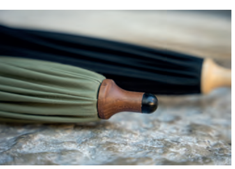
Metal parts machined in France (except ribs). Surface treatments applied in France.