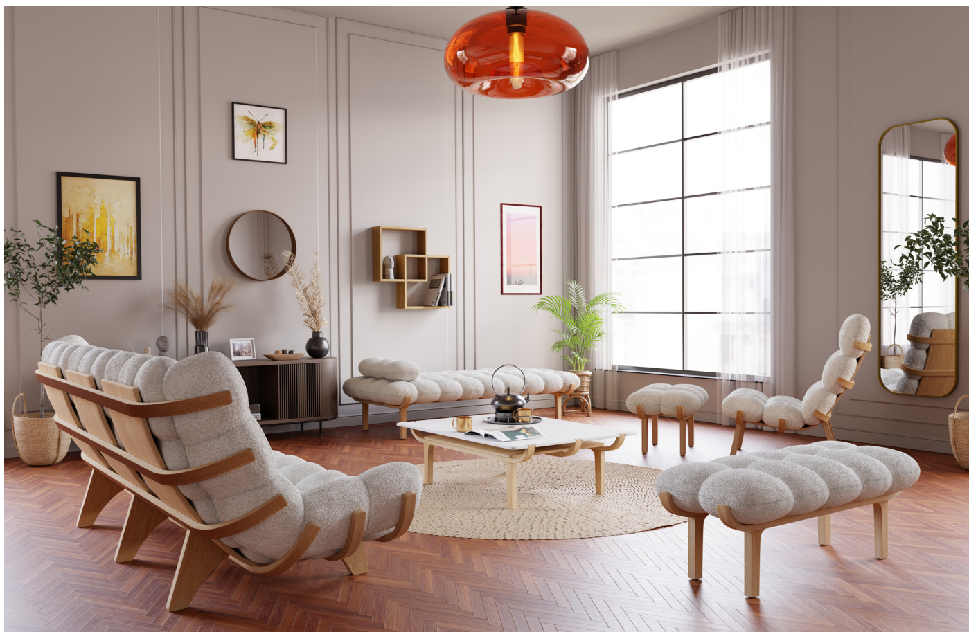
NUAGE collection, oak finishes, white boucle wool