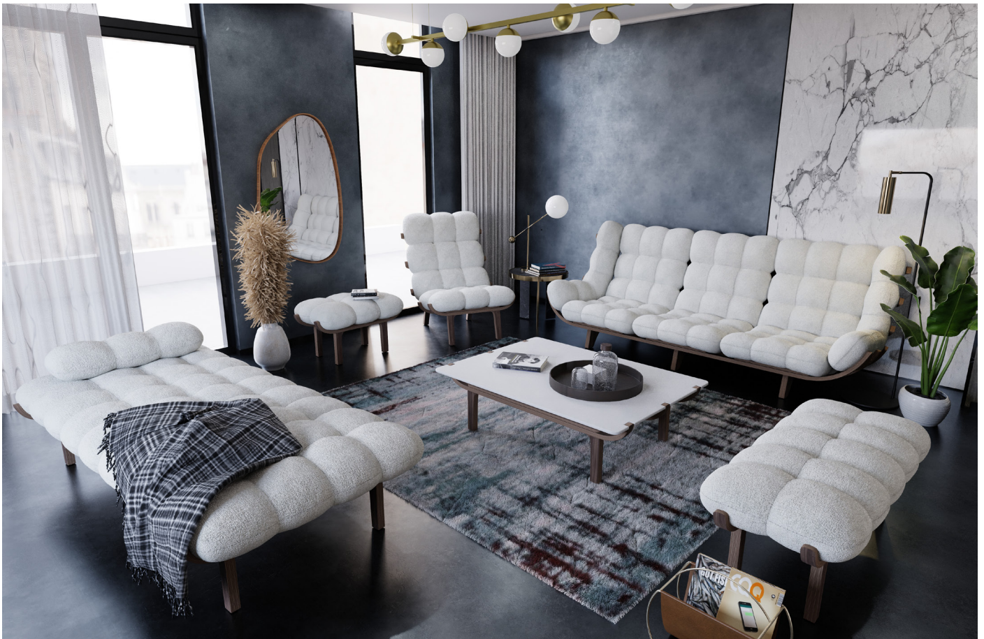
NUAGE collection, walnut finishes, white bouclé wool