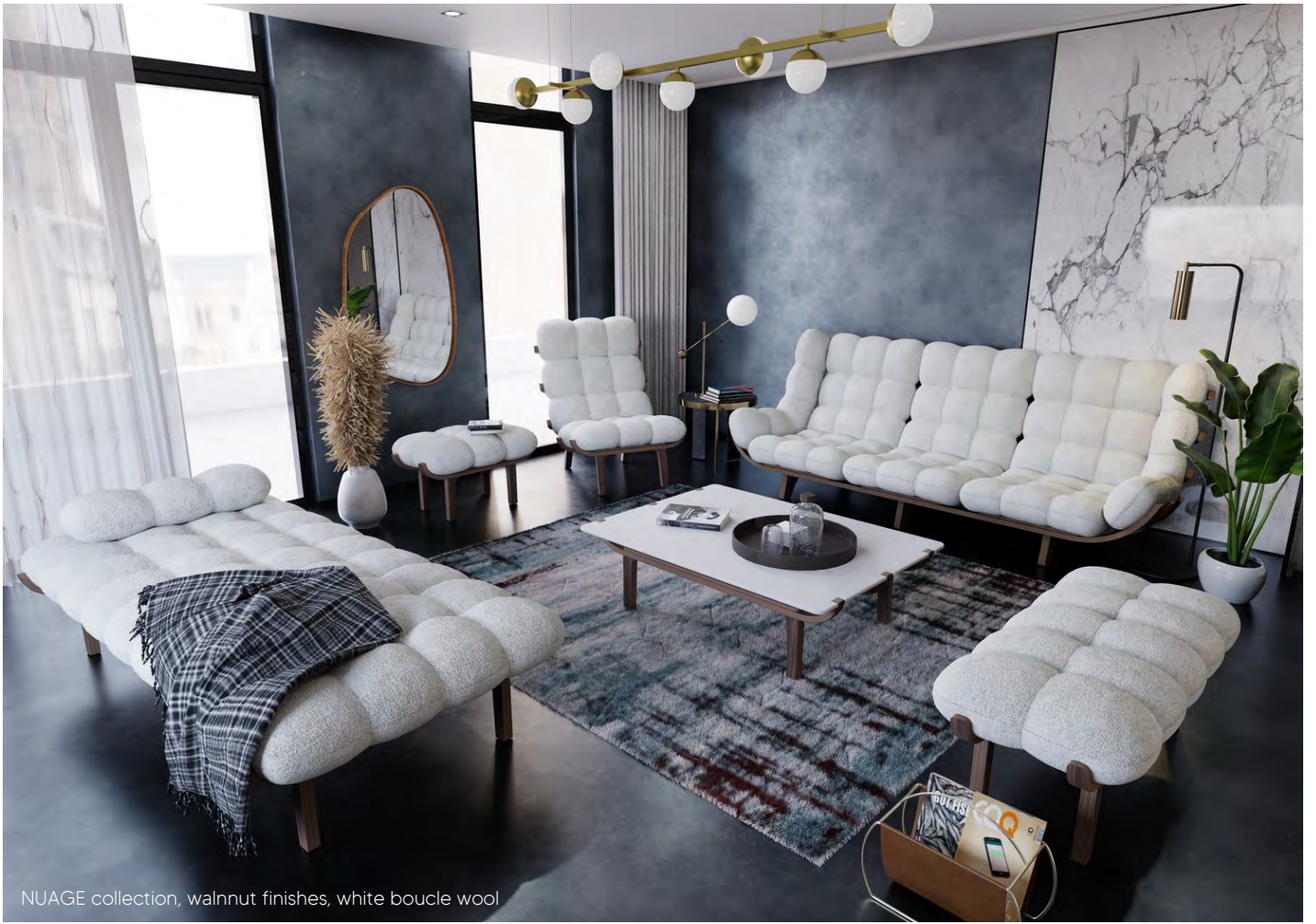
NUAGE collection, walnut finishes, white boucle wool