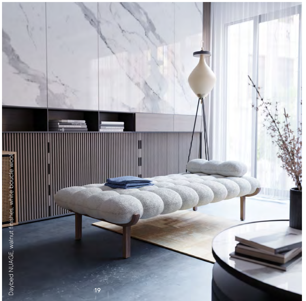
Daybed NUAGE, walnut finishes, white boucle wool