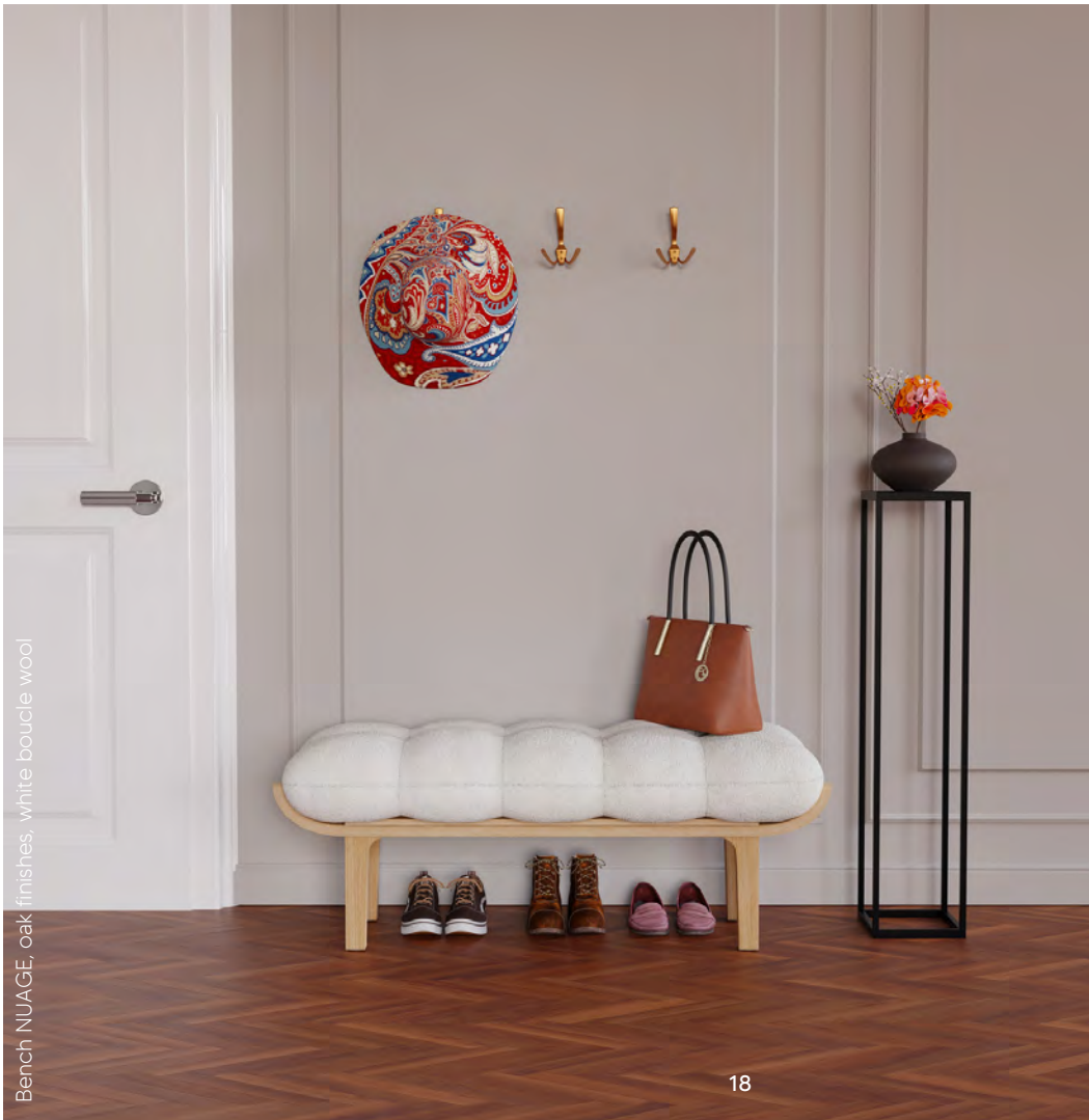
Bench NUAGE, oak finishes, white boucle wool