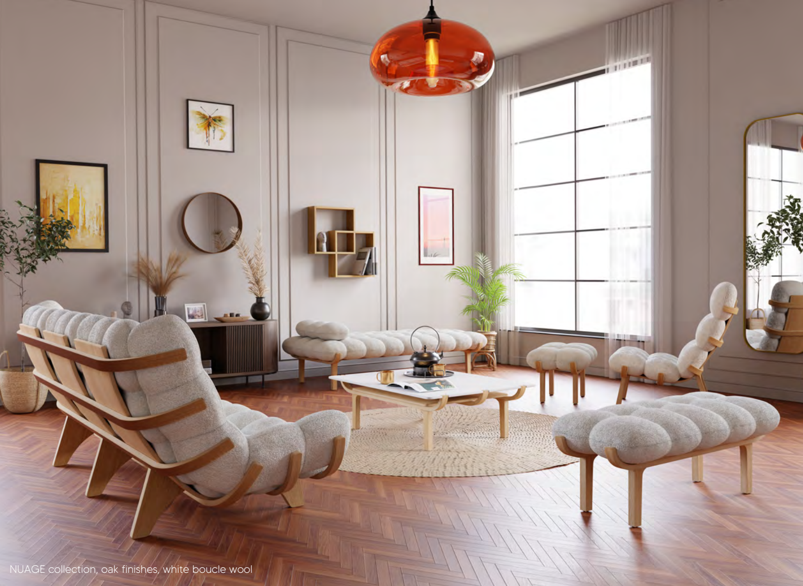
NUAGE collection, oak finishes, white boucle wool