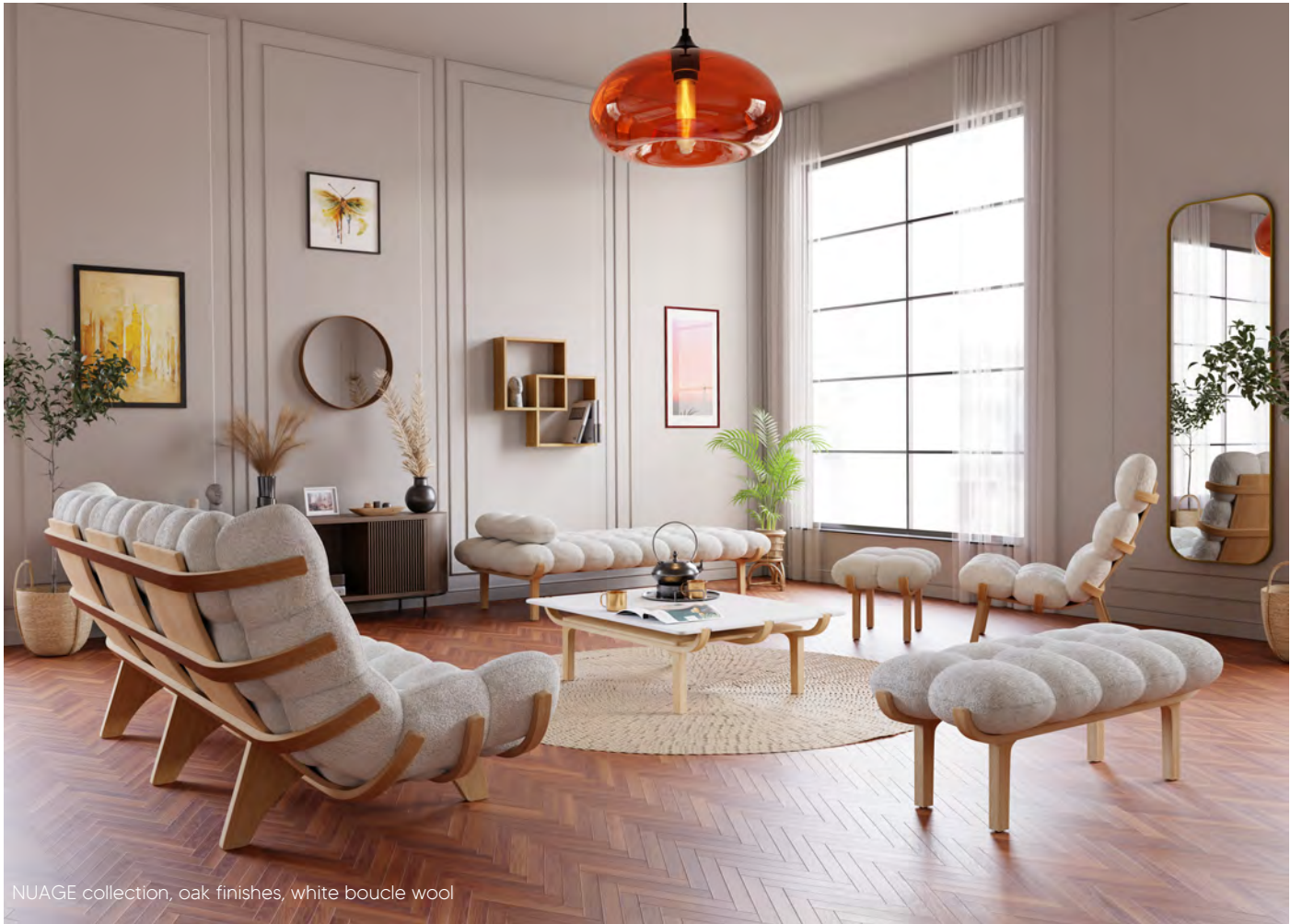
NUAGE collection, oak finishes, white boucle wool