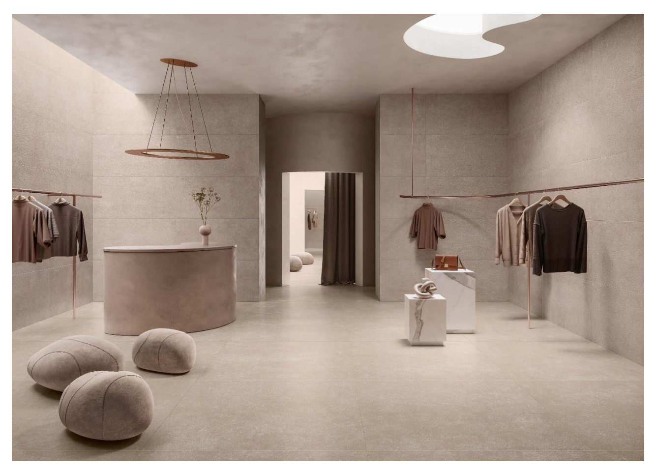
Flooring: Stile Pale Naturale - Coverings: Stile Beige Rigata

Stile tiles are squared and rectified and perfectly mimic fine stone surfaces. Their different sizes and finishes allow for many laying patterns and solutions for highly personalised spaces.