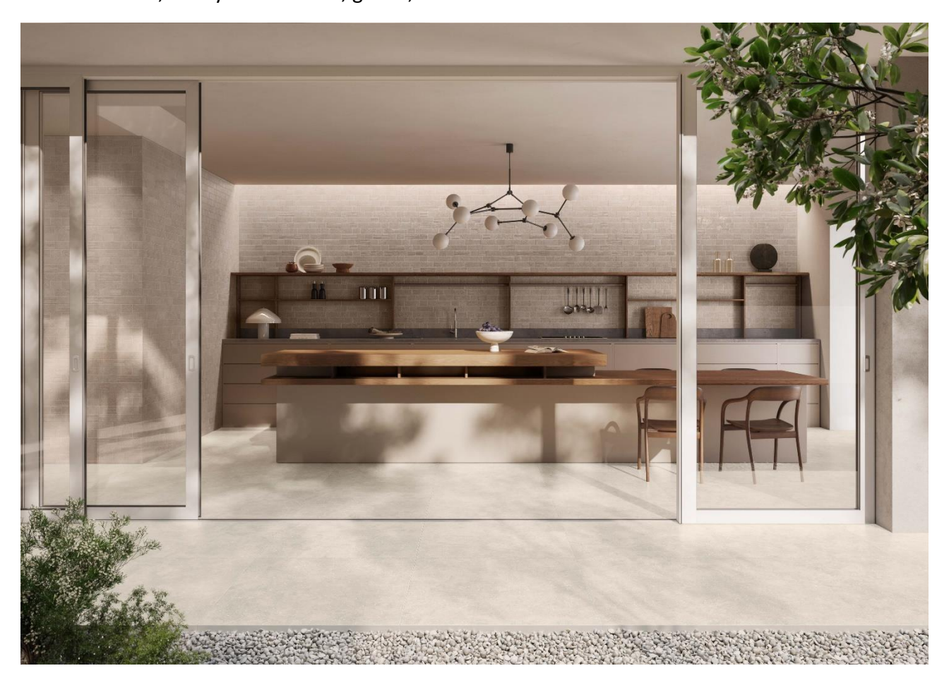
Flooring: Stile White Smoke - Covering: Stile Beige Composizione A

The outdoor versions (60x60 and 90x90 cm, 20 mm thick) can be laid on screed, ensuring excellent load resistance, or dry-laid on sand, gravel, or turf.