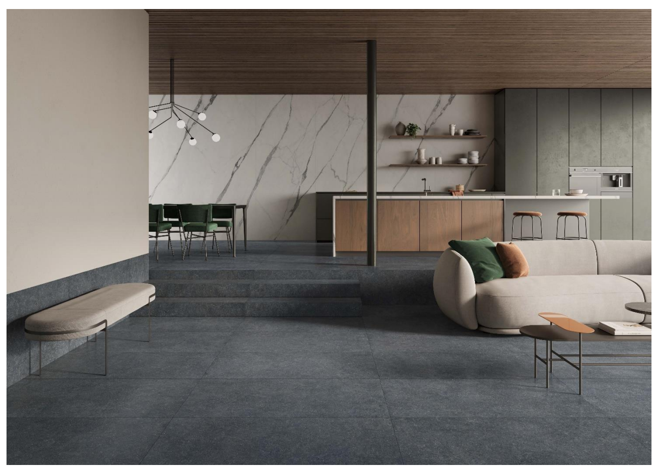
Flooring: Stile Black - Covering: Statuario Fine