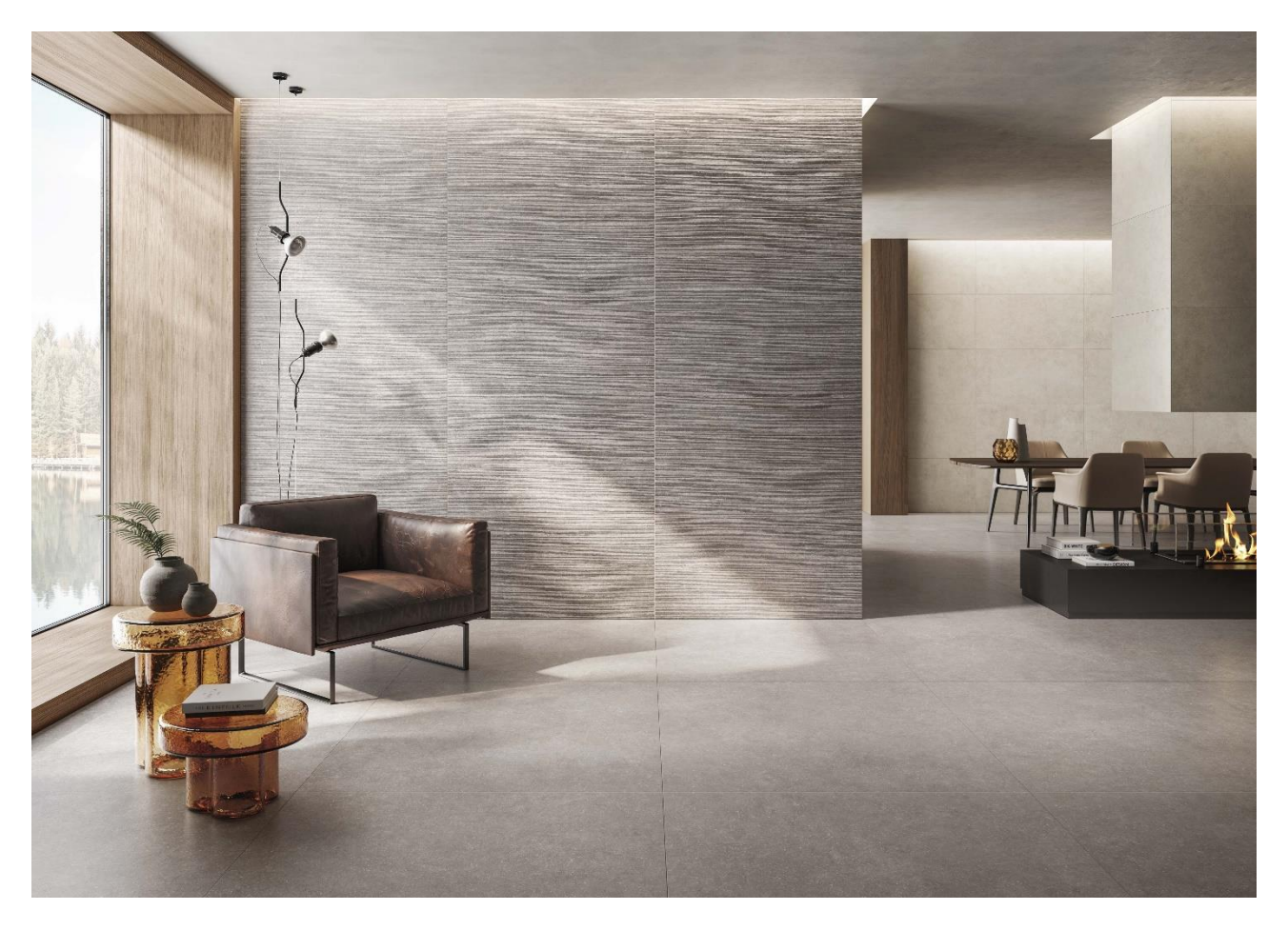
Flooring: Stile French Grey - Covering: Stile White Smoke

Stile stone-effect tiles come in a range of surfaces (antiqued, antiqued silk, bush-hammered, diagonal, grip natural, natural silk, and striped), and are perfect for creating uninterrupted surfaces between interiors and exteriors.