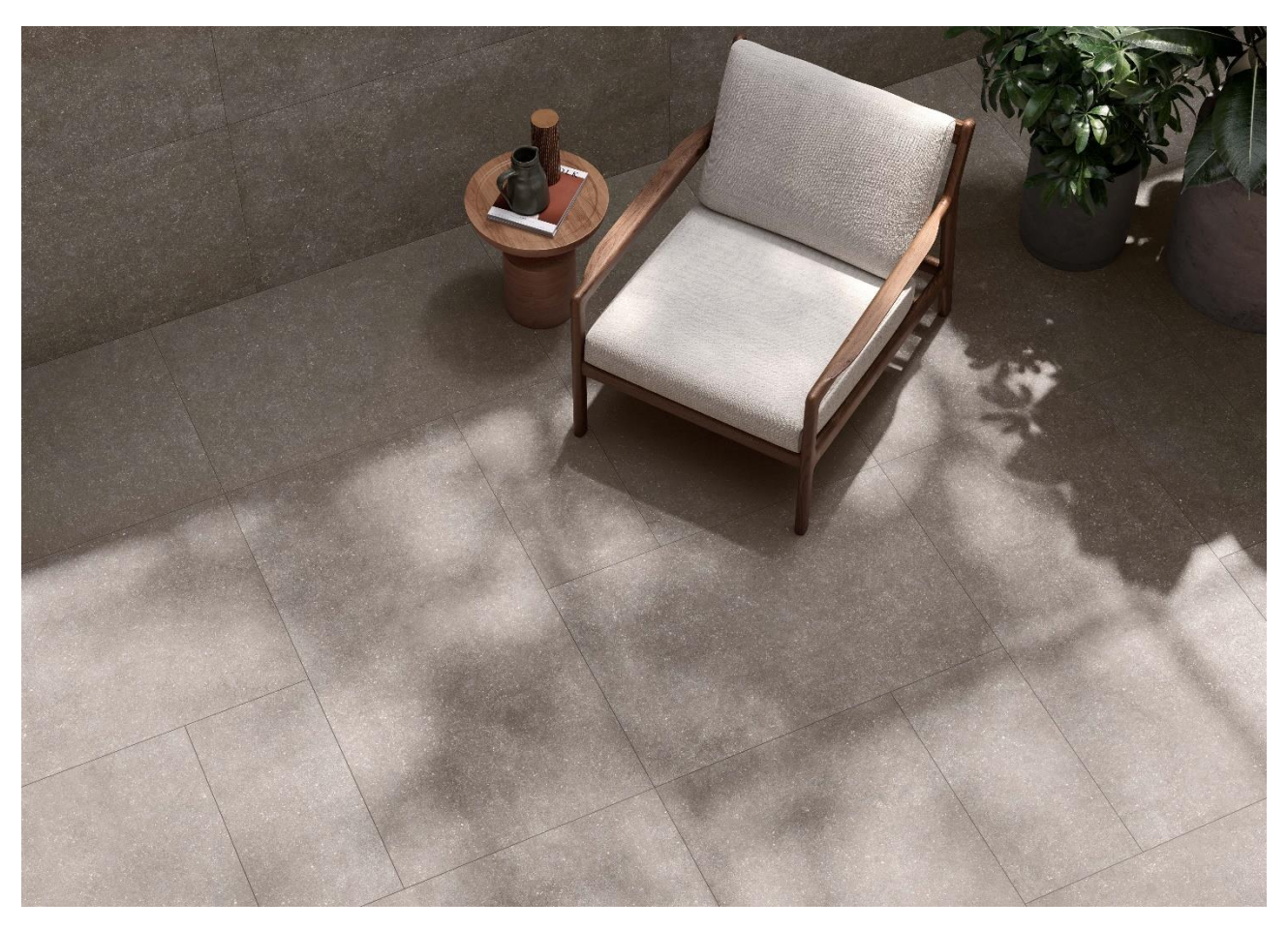
Flooring: Stile French Grey naturale

Moreover, the combination of three sizes (30x60, 60x90, and 60x120 cm) in the same box allows you to create striking geometric compositions that emphasise the beauty of these tiles and give them a key role in the décor of the whole setting. The 30x30 cm mosaic tiles (with 5x5 or 5x15 cm pieces) and a 30x60 cm brick-effect composition complete the collection.