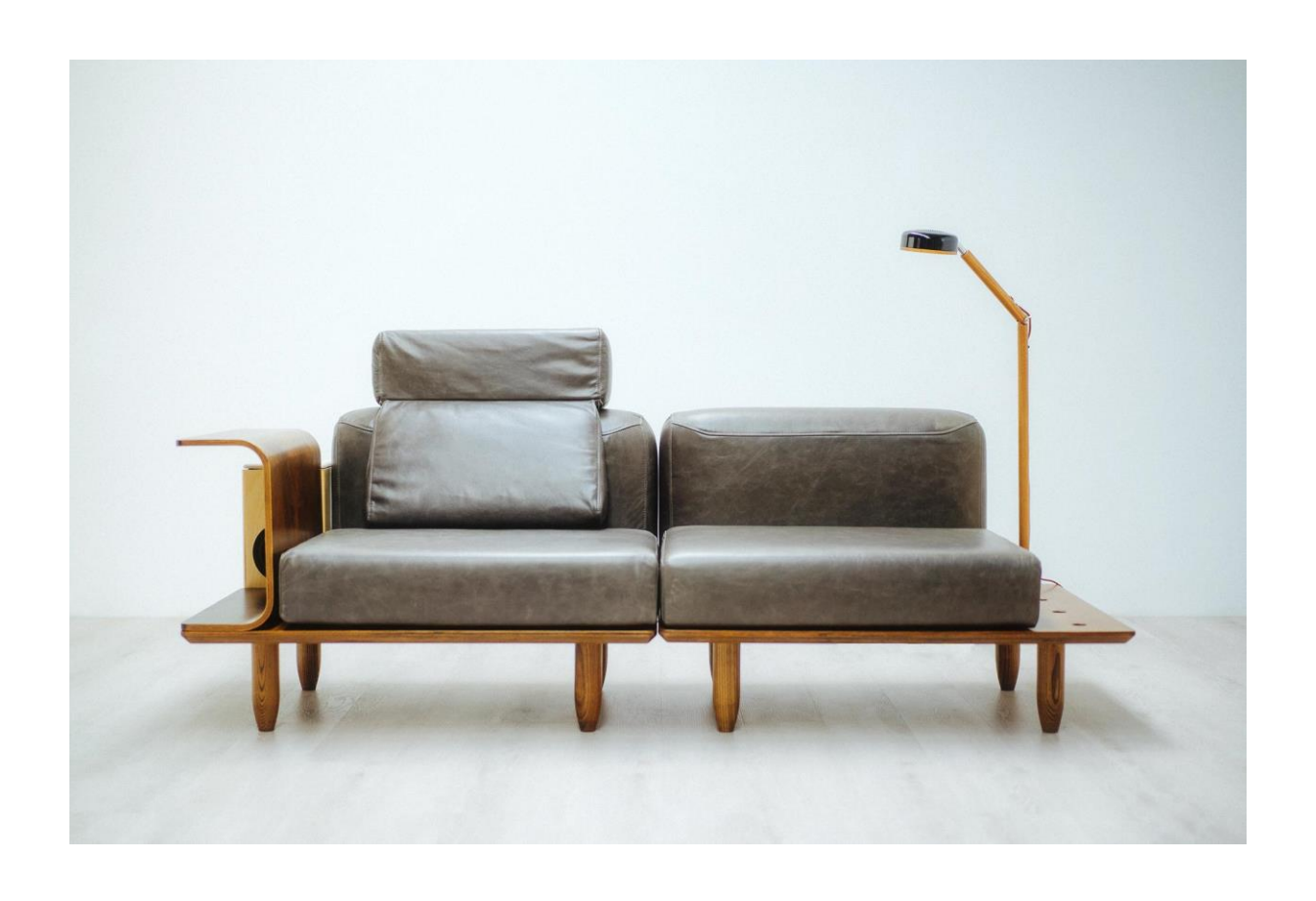
Smart furniture adapts to your life.

Great quality and design – furniture for your family.