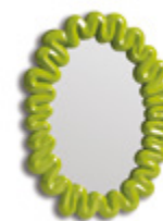
Mirror dribble green