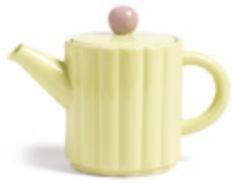
Teapot tube green