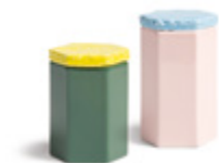
Salt & pepper slate large