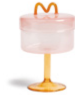
Jar flow pink