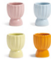
Egg holder tube 24 ass.