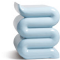
Pillar whip blue