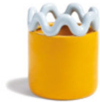
Planter sway orange