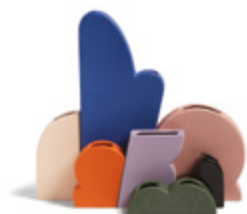
Vase ensemble set of 7