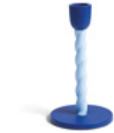
Candle holder helix medium