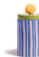
Jar shell green