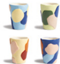
Mug chunky set of 4