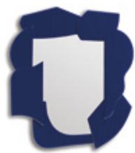
Mirror slice blue