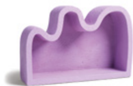
Shelf wonky lilac