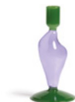
Candle holder flux lilac