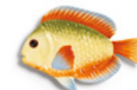
Plate fish rainbow