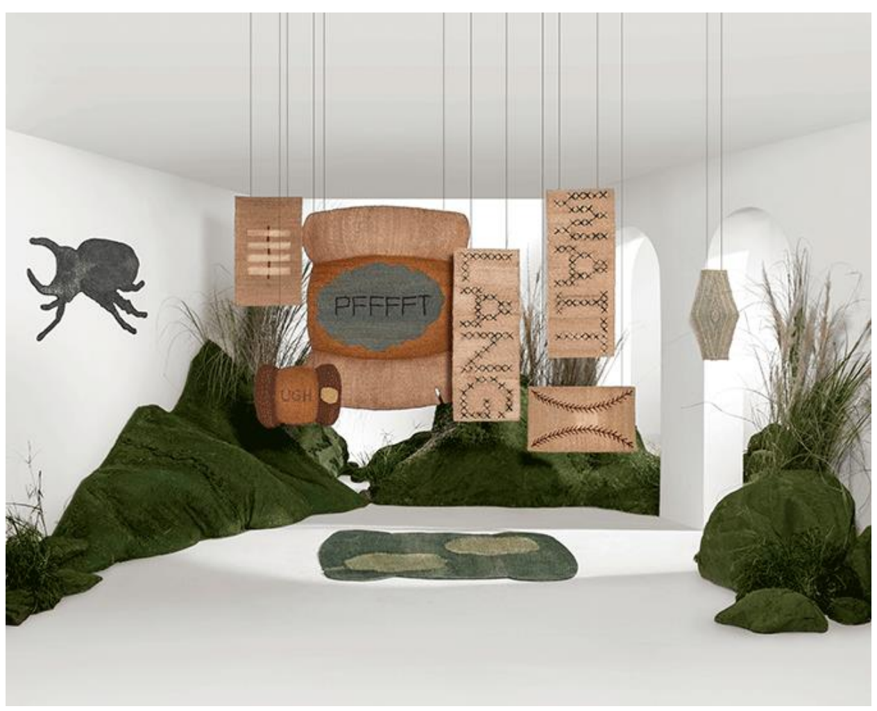
Witty one-liners and everyday objects reimagined through stitch patterns populate the country's selection of curios. (Featured: Floor and wall rugs by WeaveManila Inc.)