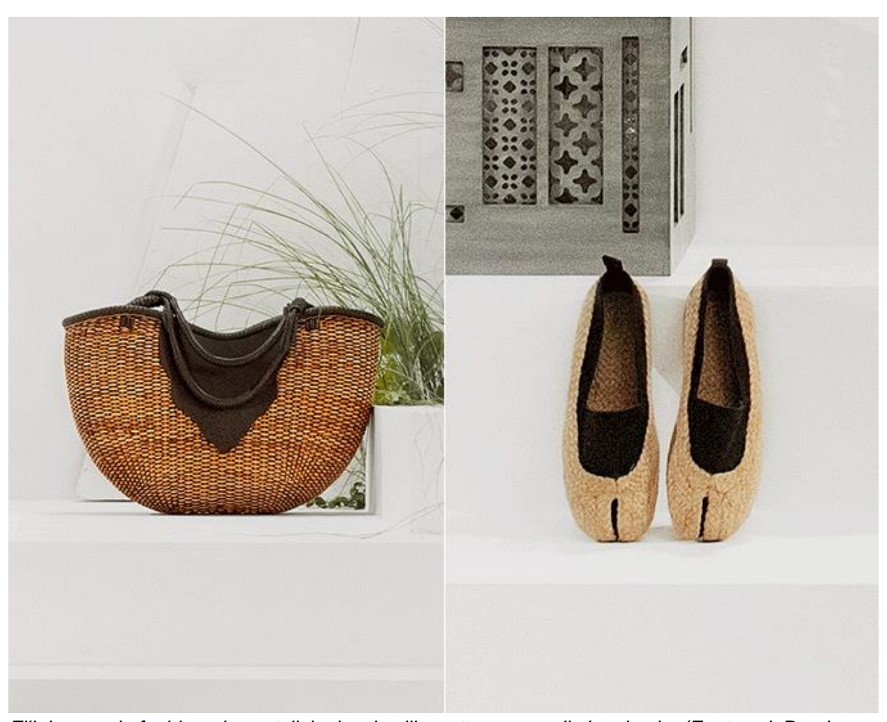
Filipino-made fashion gives stylish classic silhouettes a proudly local spin. (Featured: Bag by S.C. Vizcarra, Shoes by Aishe)