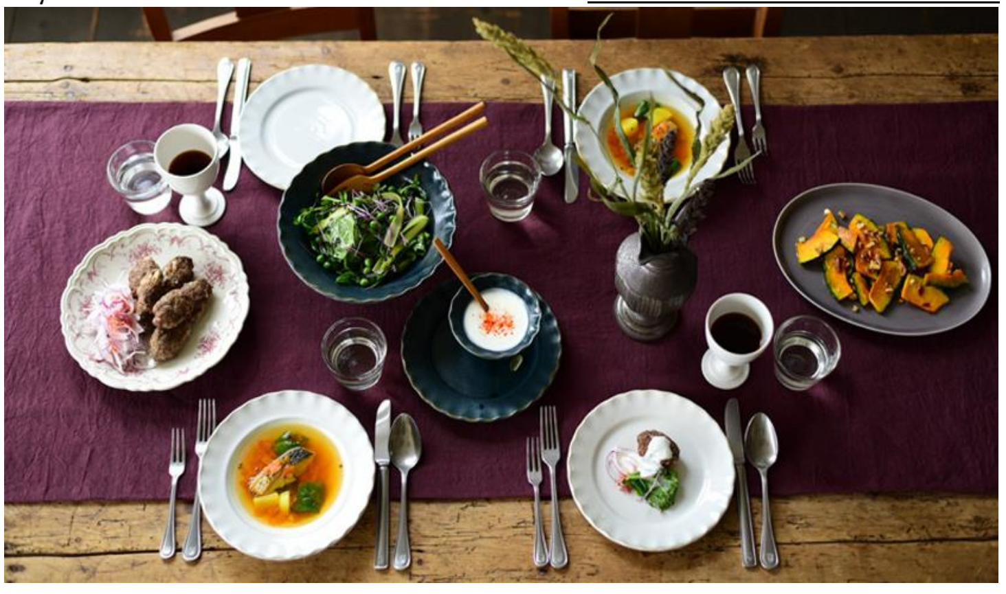
With beautiful four seasons in Japan,

we learned to sense and appreciate sensitive transition of each season in many ways from the ancient times. Our 2022 Autumn & Winter Collection was arrived with our theme "Meals and Seasons Calendar of MARUMITSU POTERIE". MARUMITSU POTERIE invites you to join this seasonal celebration through your dining table.