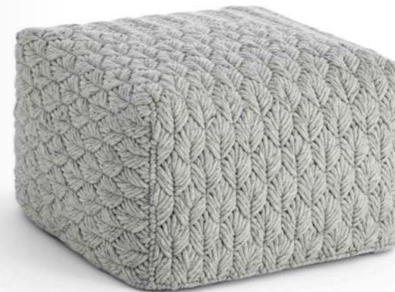
2 Chaddar Pouf, 2021 Charlotte Lancelot for GAN Ottoman Handmade 100% wool. PTFE coated fiberglass mesh. Filling: 100% foam rubber 52x52x35h / 21"x21"x14"h