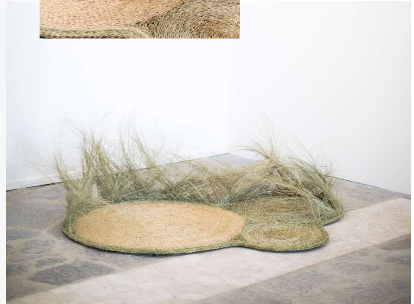
1 Clareira, 2021 Rug Stipa Gigantea, thread linen 173 x 115 x 51 cm