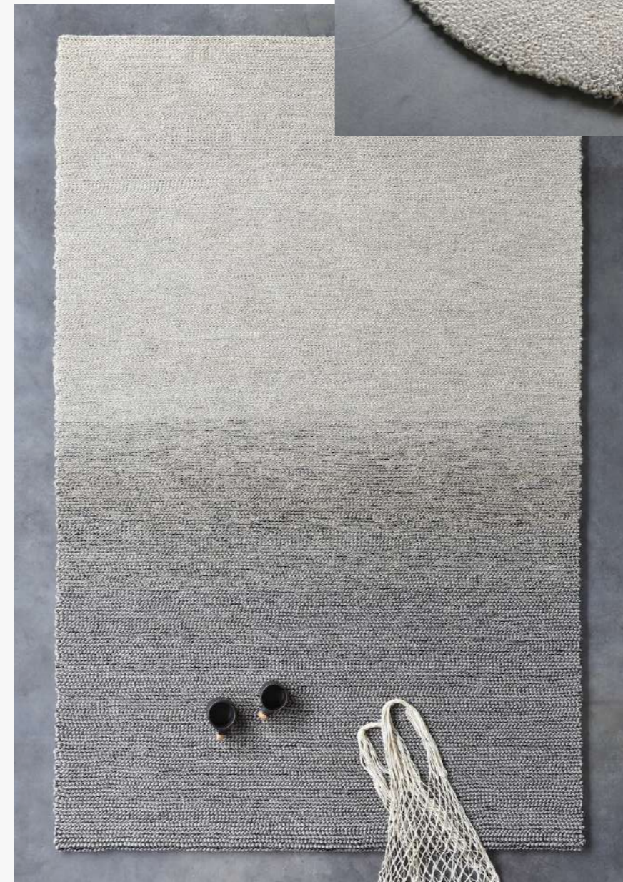
Shades, 2022 Rug 90% linen, 10% other fibers 120x180 cm