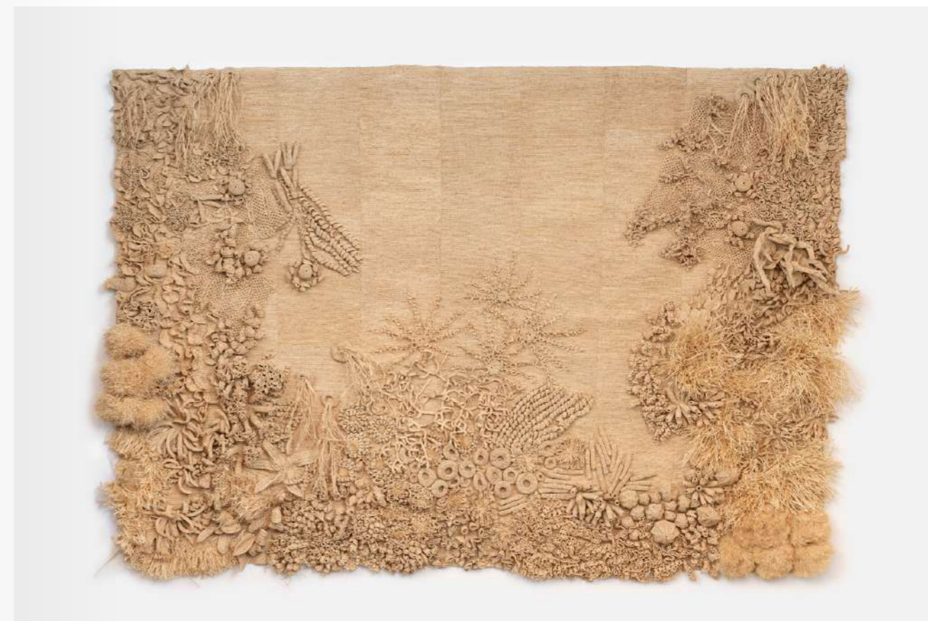
1 Paradise tapestry, 2022 Rug entirely hand-crocheted in natural raffia 260 x 160 cm

The tapestries and raffia objects are made in a family workshop in Madagascar. Natalia Brilli then works on the pieces to sheath them. All the leathers come from the dormant stocks of French and Italian luxury tanneries, which is why most of the creations are limited and numbered editions. For the furniture the designer collaborates with Belgian cabinet makers.