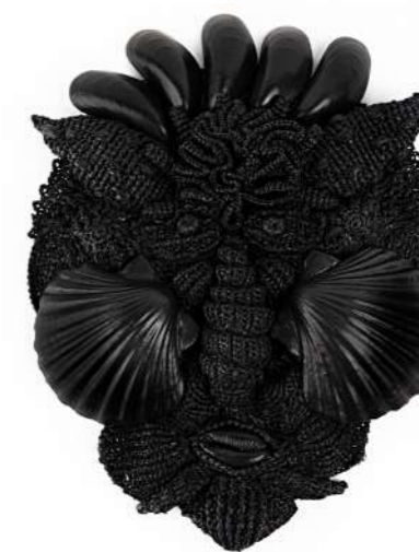
2 Fatu huku mask, 2022 Mask decorated with shells Hand-crocheted raffia Real seashells covered with recycled lambskin in a tone-on-tone colour Metal moulds covered with recycled lambskin leather in matching colours 35 x 25 cm