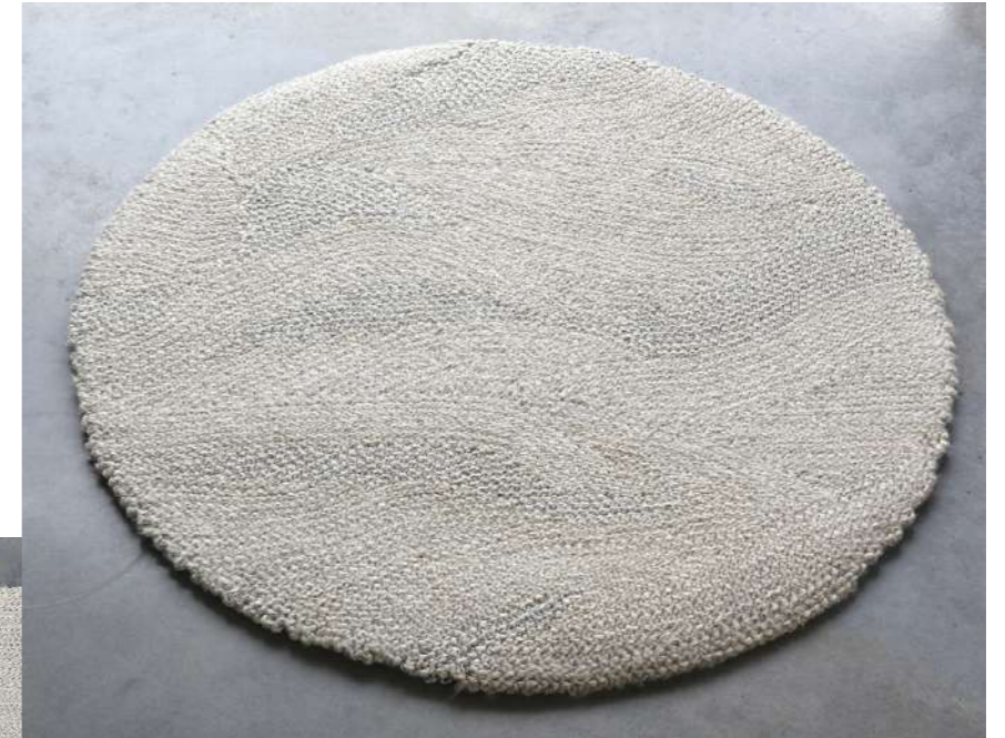
1 Slow, 2022 Rug 95% linen, 5% lurex Ø 100 cm

The vibrant pattern appearing in the SLOW series comes from the material itself in the structure of its manufacture, and evokes a movement. Here, the combination of bleached and unbleached linen with small silver accents creates an almost tone-on-tone ensemble that beautifully reveals its design in the light. Linen is a natural and ecological material. It is locally produced, requires little water to grow, and undergoes very light chemical treatments. Linen also has practical advantages: it is a good acoustic insulator, dustproof and regulates the temperature and humidity of its environment.