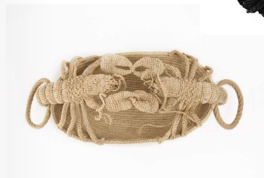
3 Lobster Basket, 2022 Limited edition 100 pcs Hand-crocheted raffia, underside of basket sheathed in tone-on-tone recycled lambskin, hemp rope handles sheathed in tone-on-tone recycled lambskin 40 x 22 x 10 cm