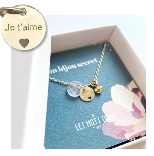
Je t'aime - CO-MED-0005 I love you