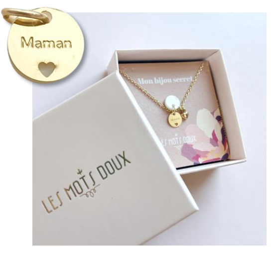
Maman - CO-MED-0004 Mom