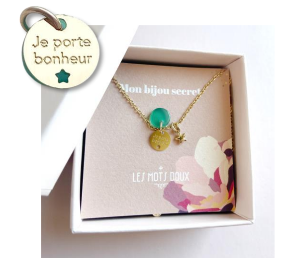
Je porte bonheur - CO-MED-0003 I'm a lucky charm