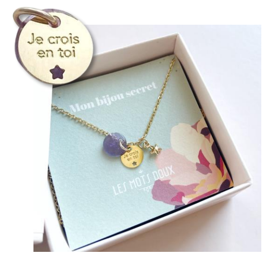
Je crois en toi - CO-MED-0002 I believe in you