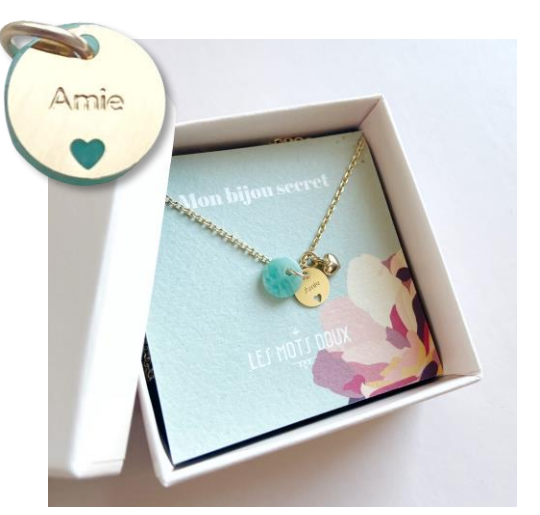
Amie - CO-MED-0001 Friend