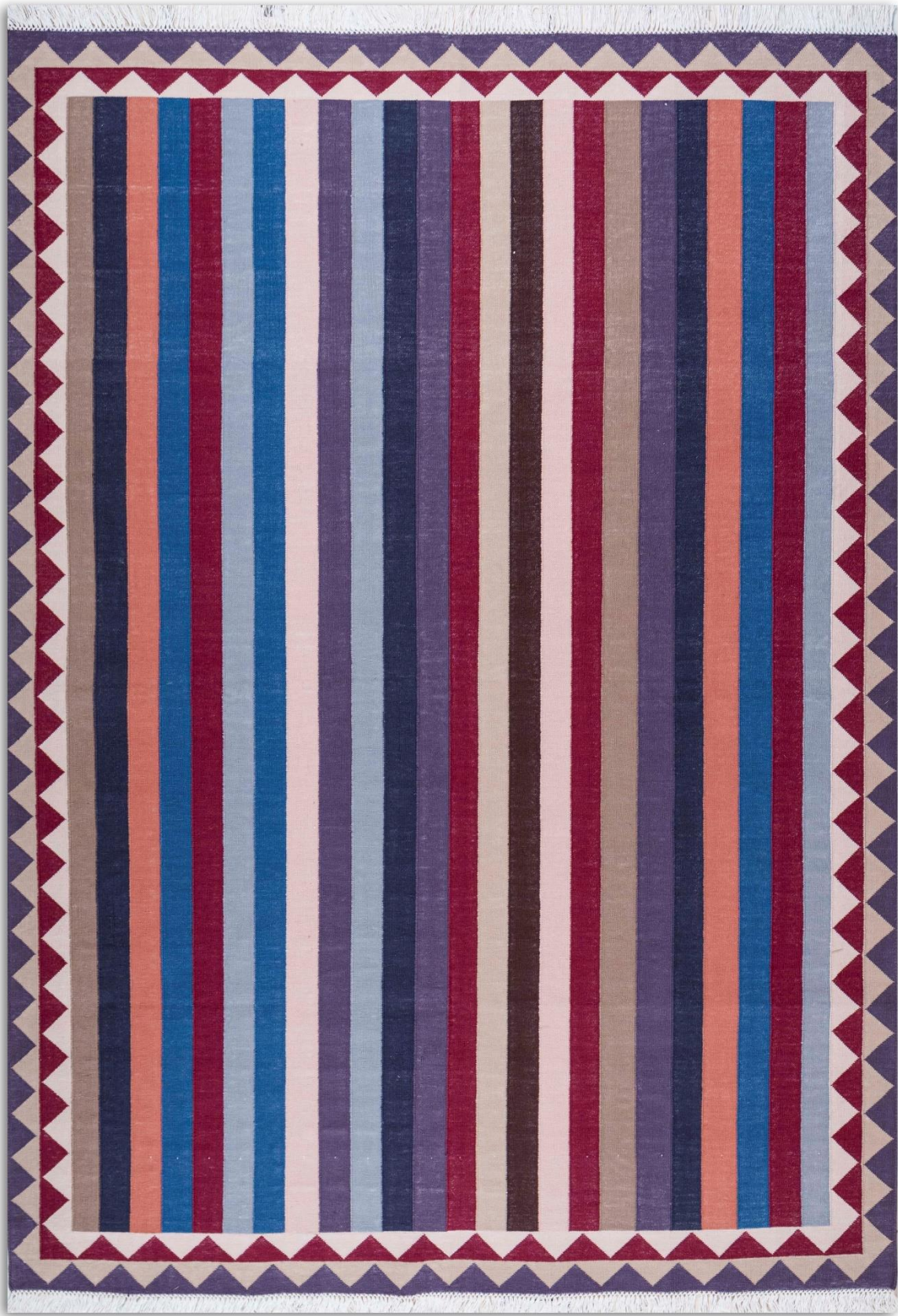
DESIGN CD 2057 COTTON YARN 5x7 FEET