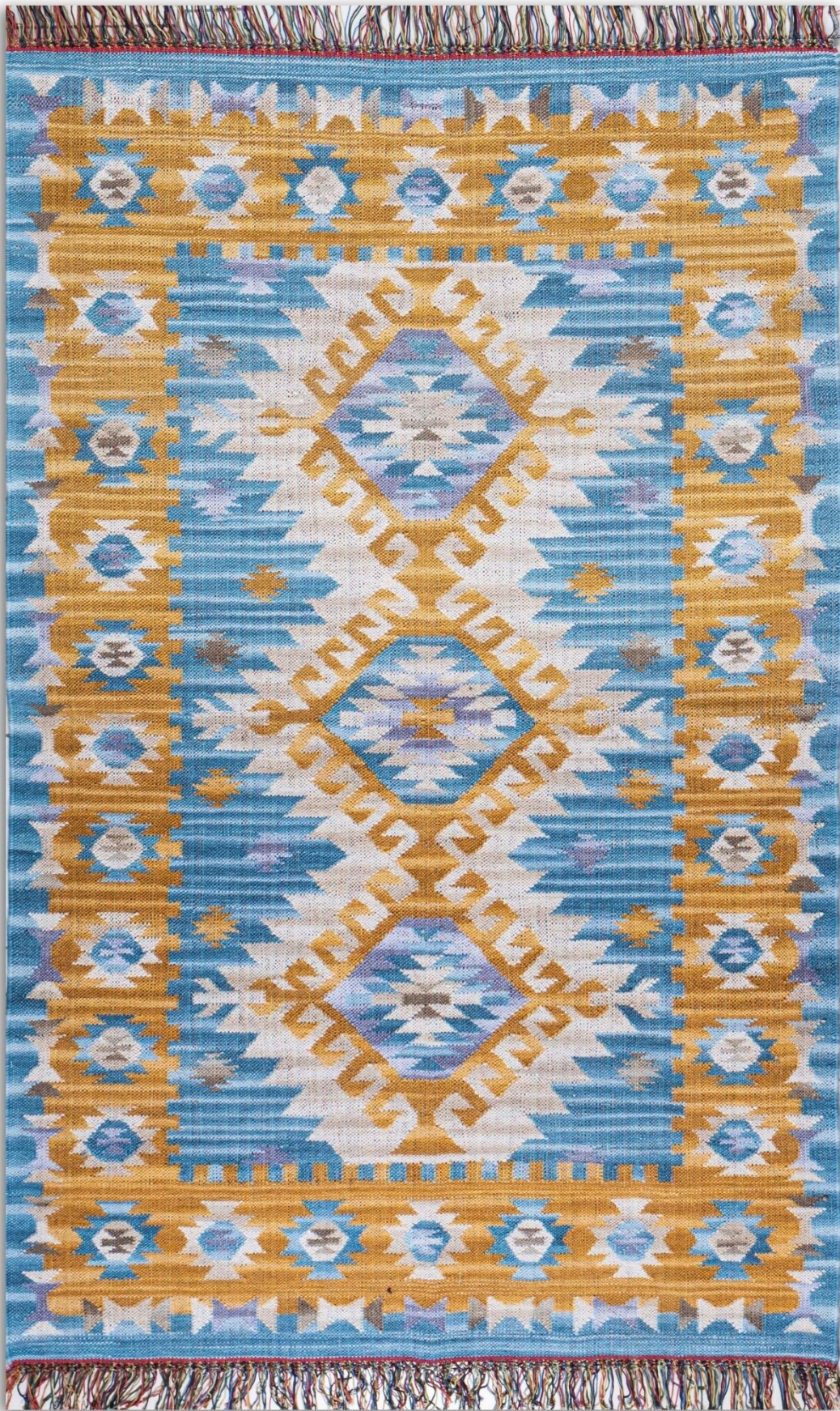
DESIGN WD 73 WOOLLEN YARN 4x6 FEET