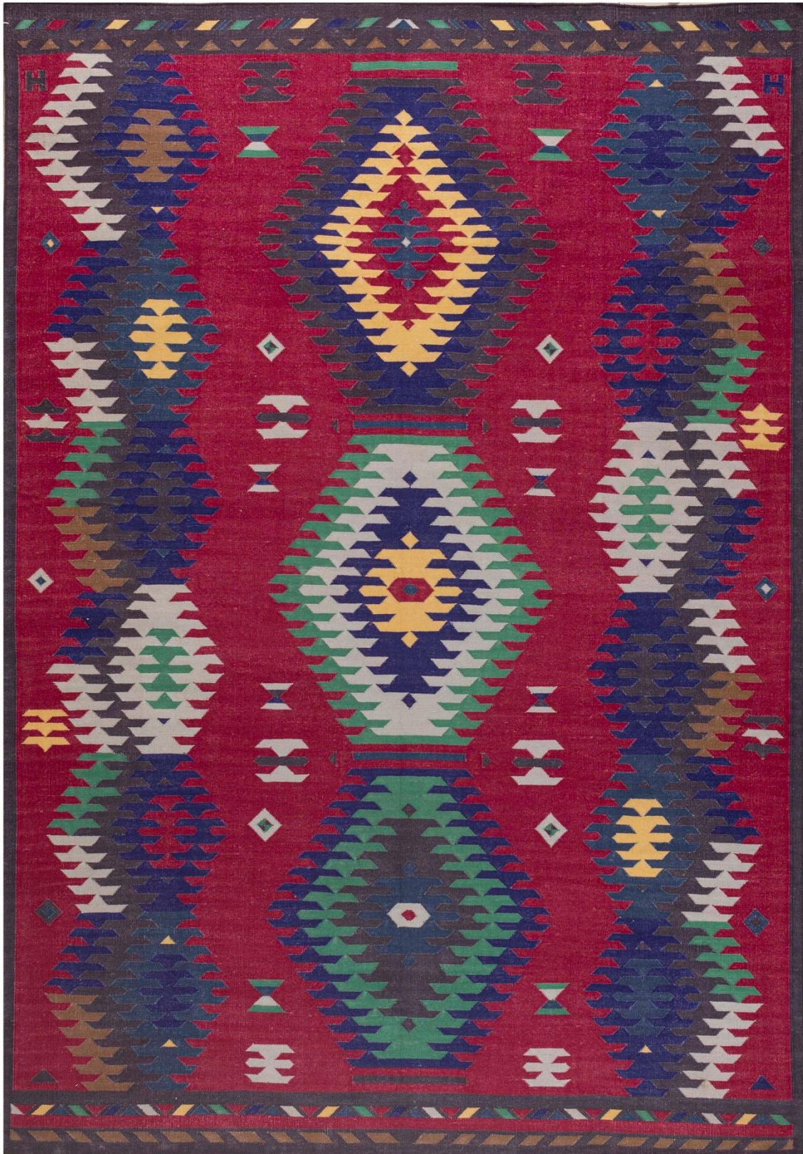
DESIGN CD MM 2002 COTTON YARN 5.8 x 8.0 FEET