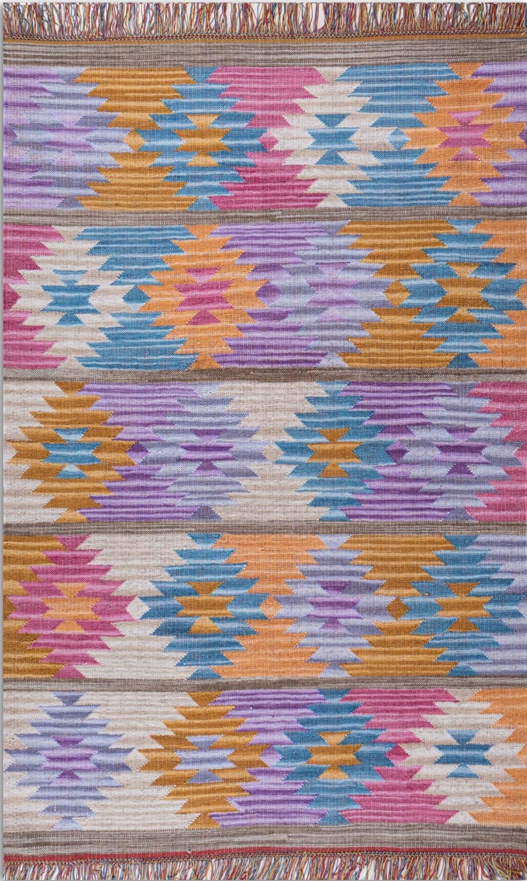
DESIGN WD 74 WOOLLEN YARN 4x6 FEET