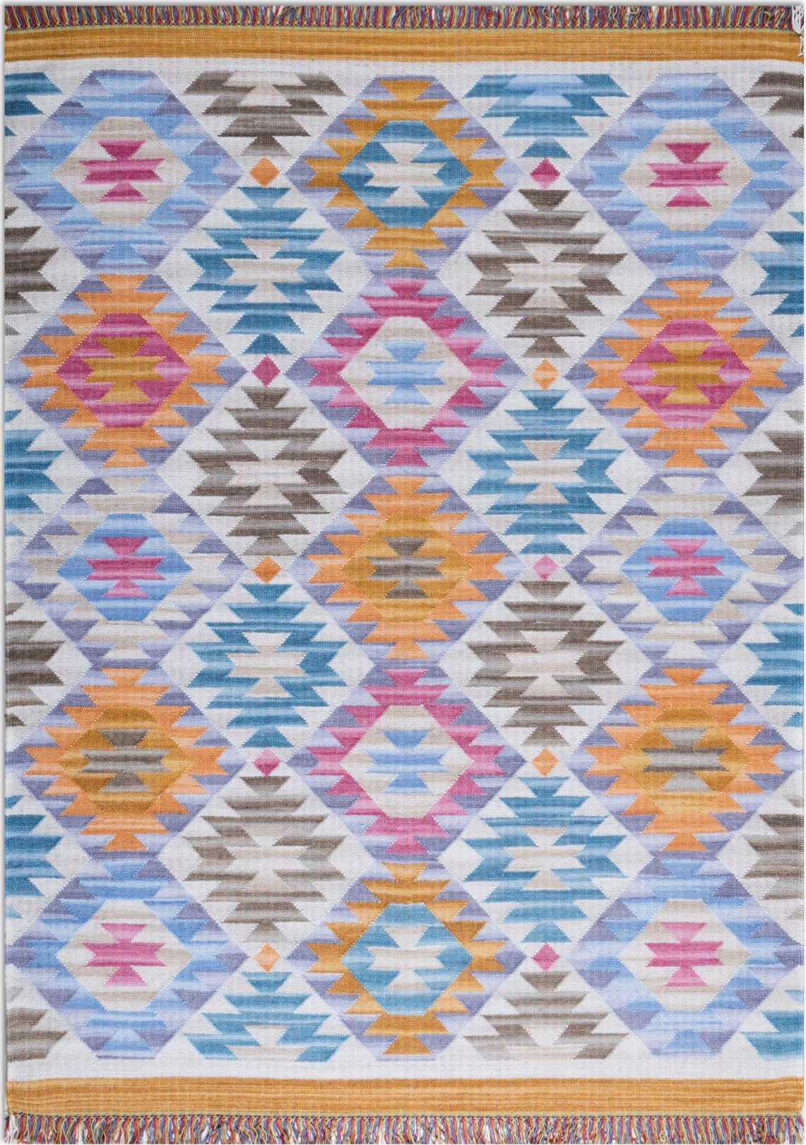
DESIGN WD 59 WOOLLEN YARN 4x6 FEET