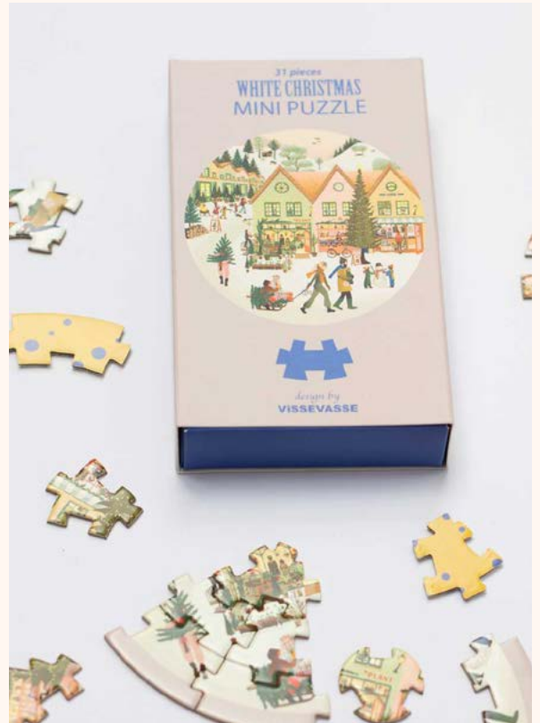
White Christmas, mini puzzle, 8 €