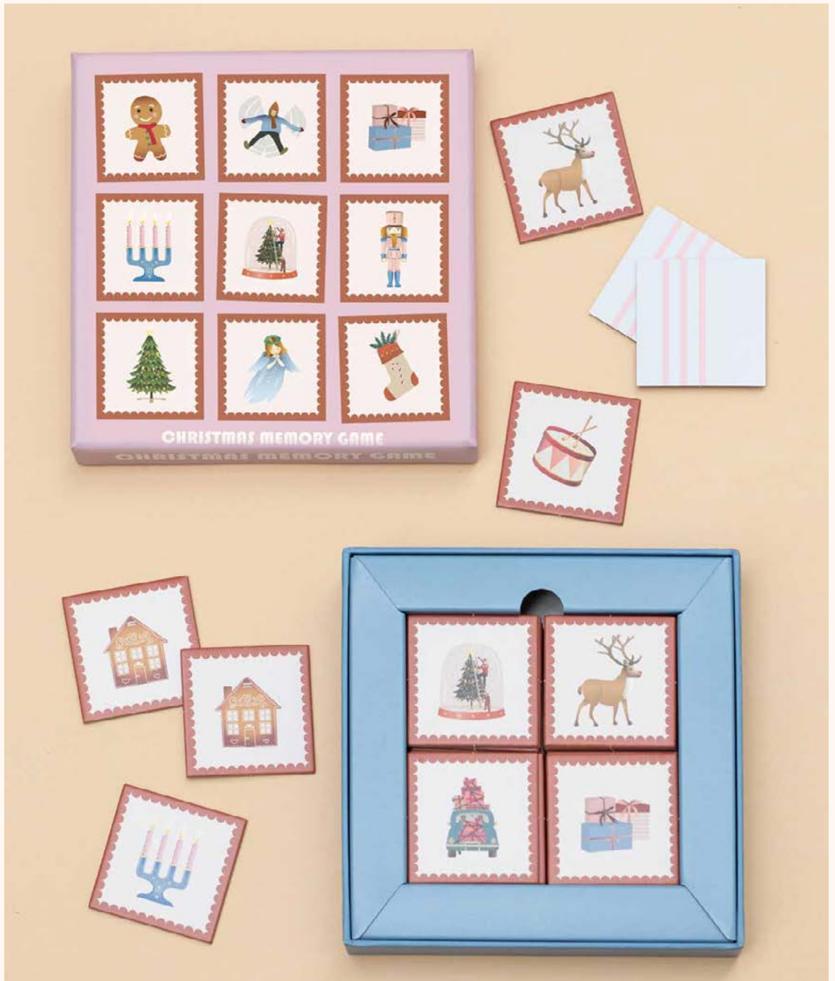
Christmas memory game, 28 pairs, 19 €

Everyone knows the classic memory game, which can be played by kids and adults of all ages. Our Christmas memory game has the same rules, but it will get you in a Christmas mood at the same time. All the illustrations on the pieces (28 pairs) are inspired by classic Christmas icons. You will for example find a Christmas tree, Christmas gifts and Rudolph.