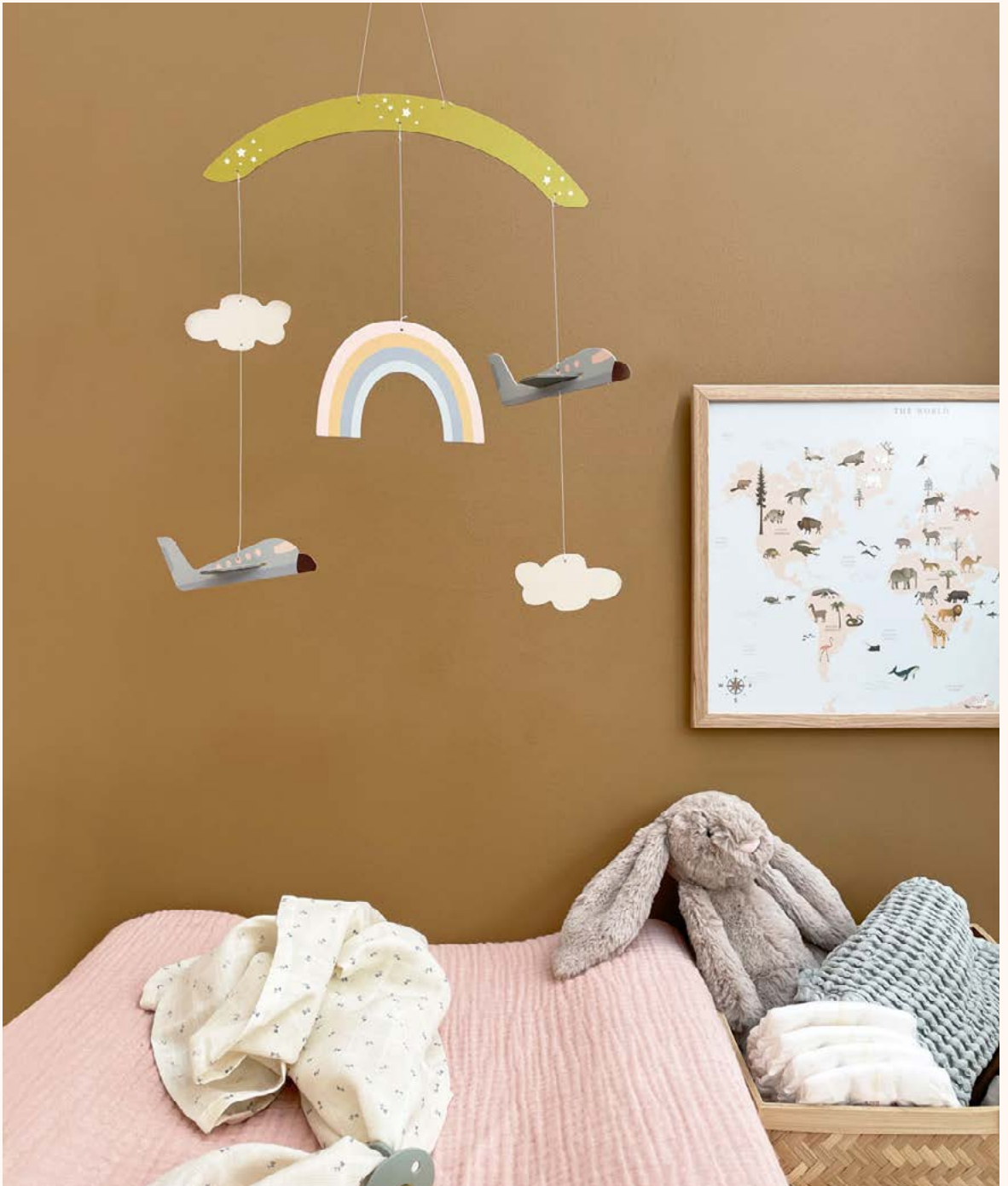
Airplanes, decorative mobile, 19 €

We have designed 3 new D.I.Y. decorative mobiles for the kids room. The mobiles are perfect to hang over the changing table or the bed, but they can also be a decorative item in the corner of the room or hanging from a hook below a shelf.