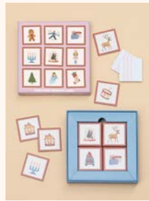
CHRISTMAS MEMORY GAME