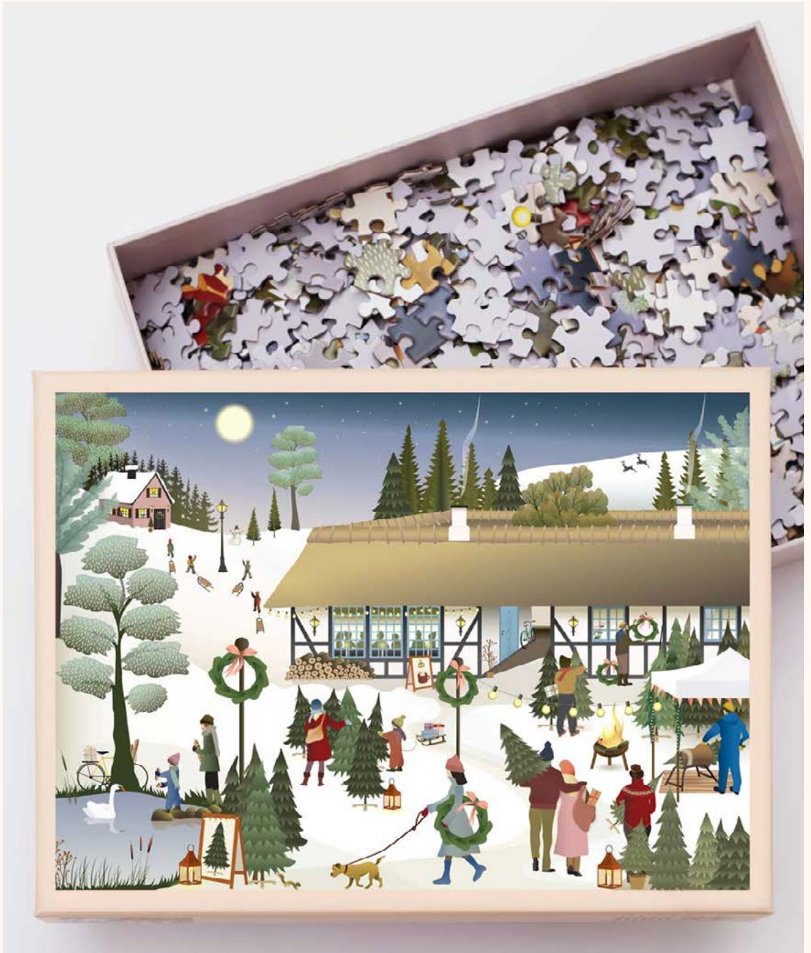
Christmas tree farm, puzzle with 1.000 pieces, 34 €