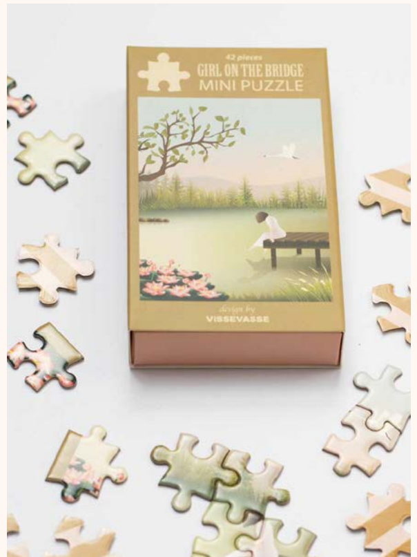
Girl on the bridge, mini puzzle, 8 €