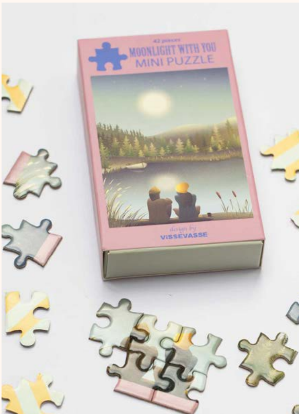
Moonlight with you, mini puzzle, 8 €