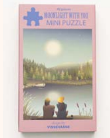
MOONLIGHT WITH YOU