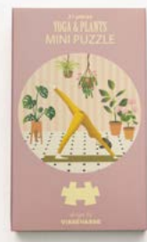
YOGA & PLANTS