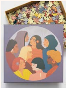
WE ARE ONE