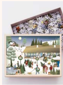
CHRISTMAS TREE FARM