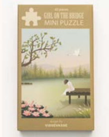
GIRL ON THE BRIDGE