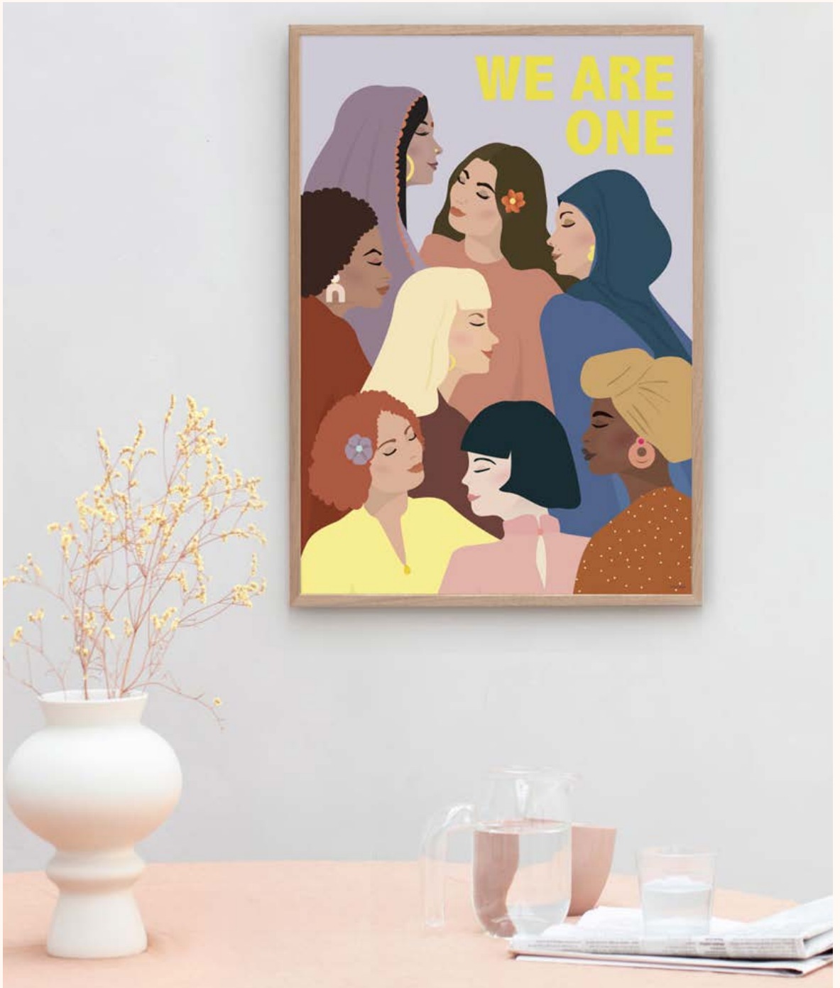
We are one, fundraising poster, 29 € - 49 €

The fundraising poster for LittleBigHelp was launched to mark International Woman's day.