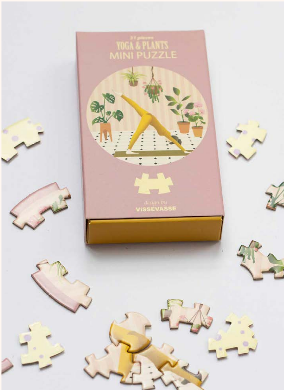
Yoga & plants, mini puzzle, 8 €

Miracle boxes. That's what we call our mini puzzles (with a twinkle)