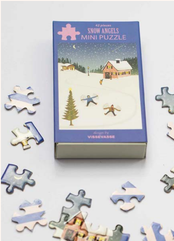
Snow angels, mini puzzle, 8 €