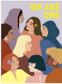
WE ARE ONE