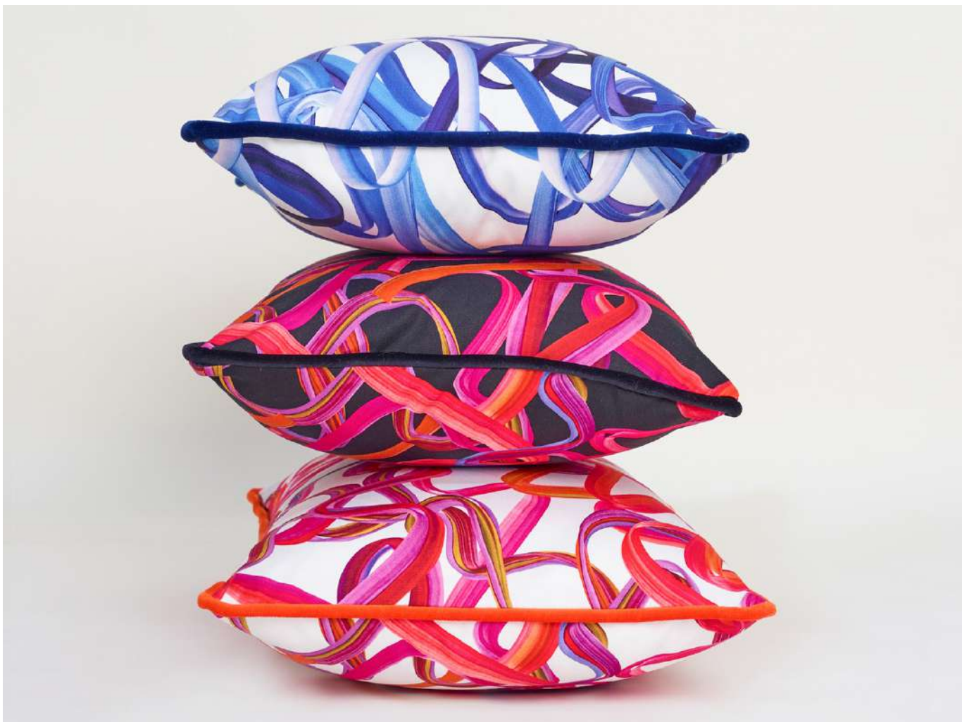
CUSHIONS FROM THE «RUBANS» COLLECTION

They are distributed by the linear meter to dress with elegance the seats, chairs and sofas, they are ideal for the confection of curtains.