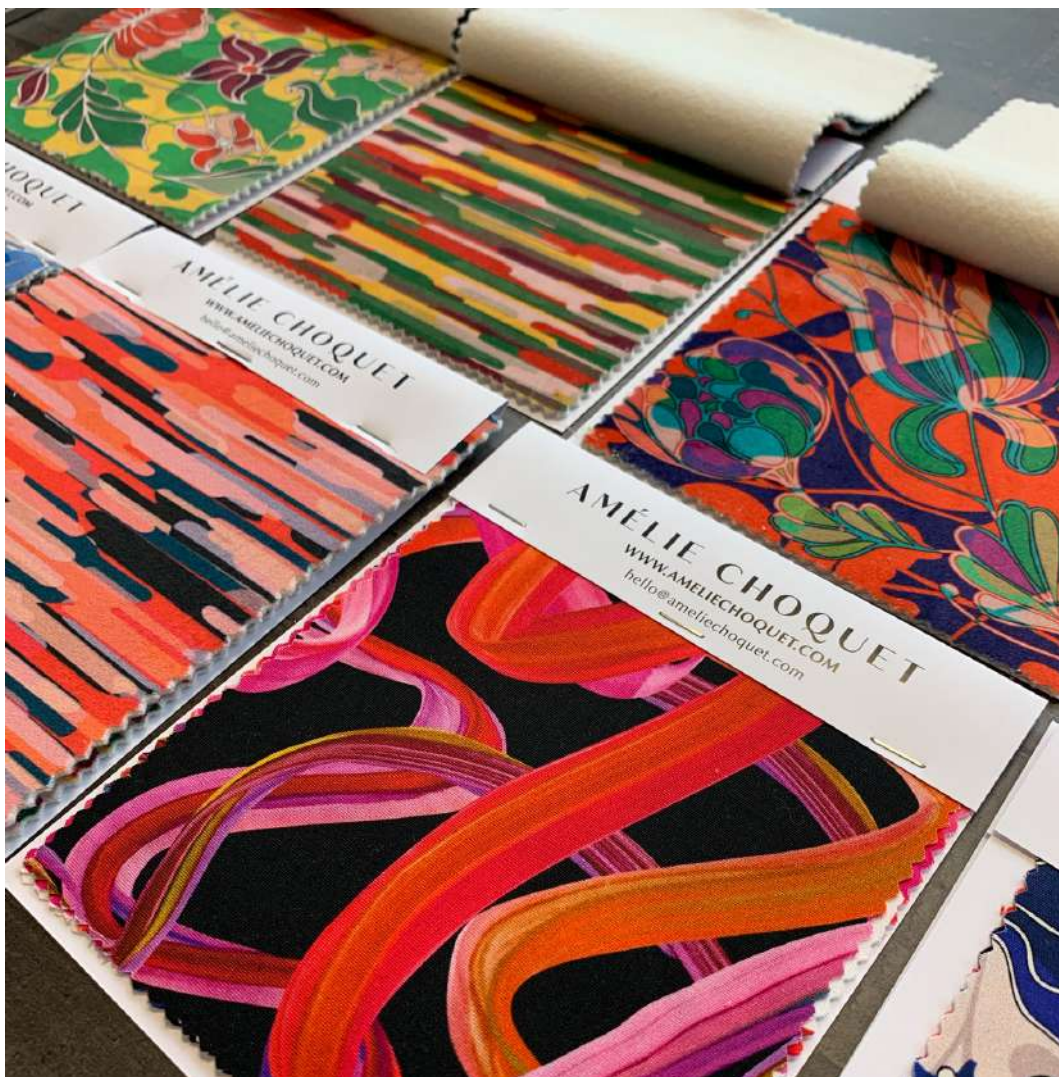
SAMPLES OF THE COLLECTIONS, PULLS FOR THE UPHOLSTERERS

Our custom service allows us to adapt our designs to all spaces and surfaces and to meet the requirements of decorators and architects.