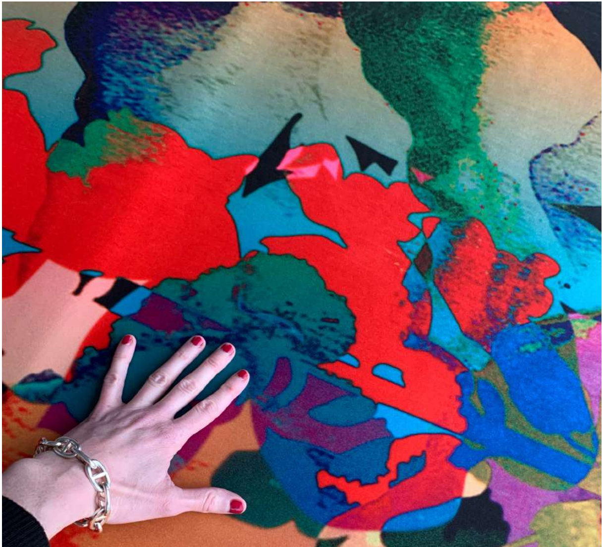
COLLECTION «PAYSAGES» PRINTED ON VELVET

This velvet is made of 100% polyester yarn from recycled materials, recovered, reworked and reintroduced on the market for a sustainable and more responsible approach. We have chosen this supplier for the quality of its velvet of an exceptional softness and for the faithful and demanding transcription of our designs.