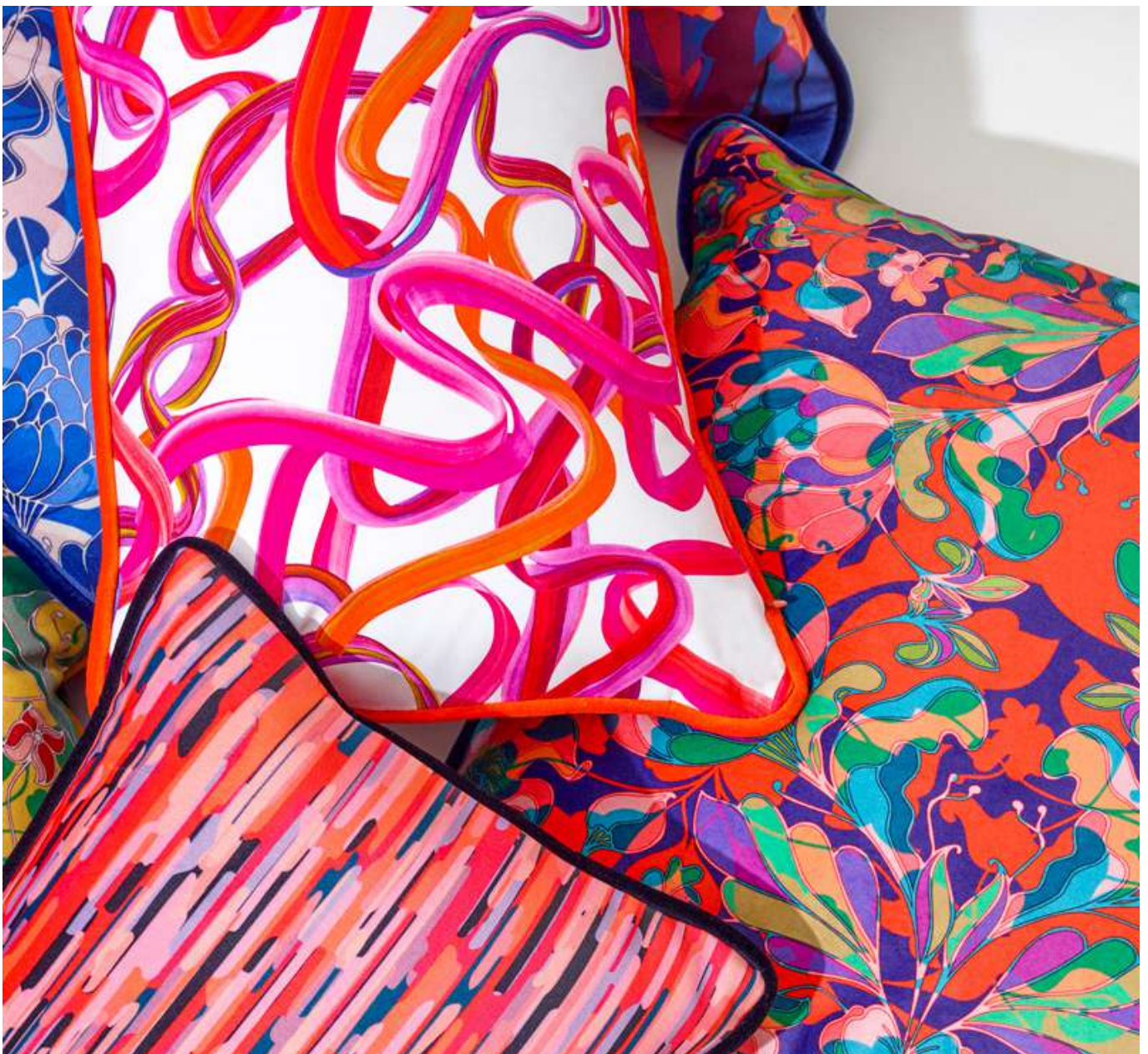
CUSHIONS FROM THE 2021-22 COLLECTION

Dance of colors, luxuriant flora, spring hymn, the patterns play with the color and bring brightness for the decoration of all the styles of interiors.