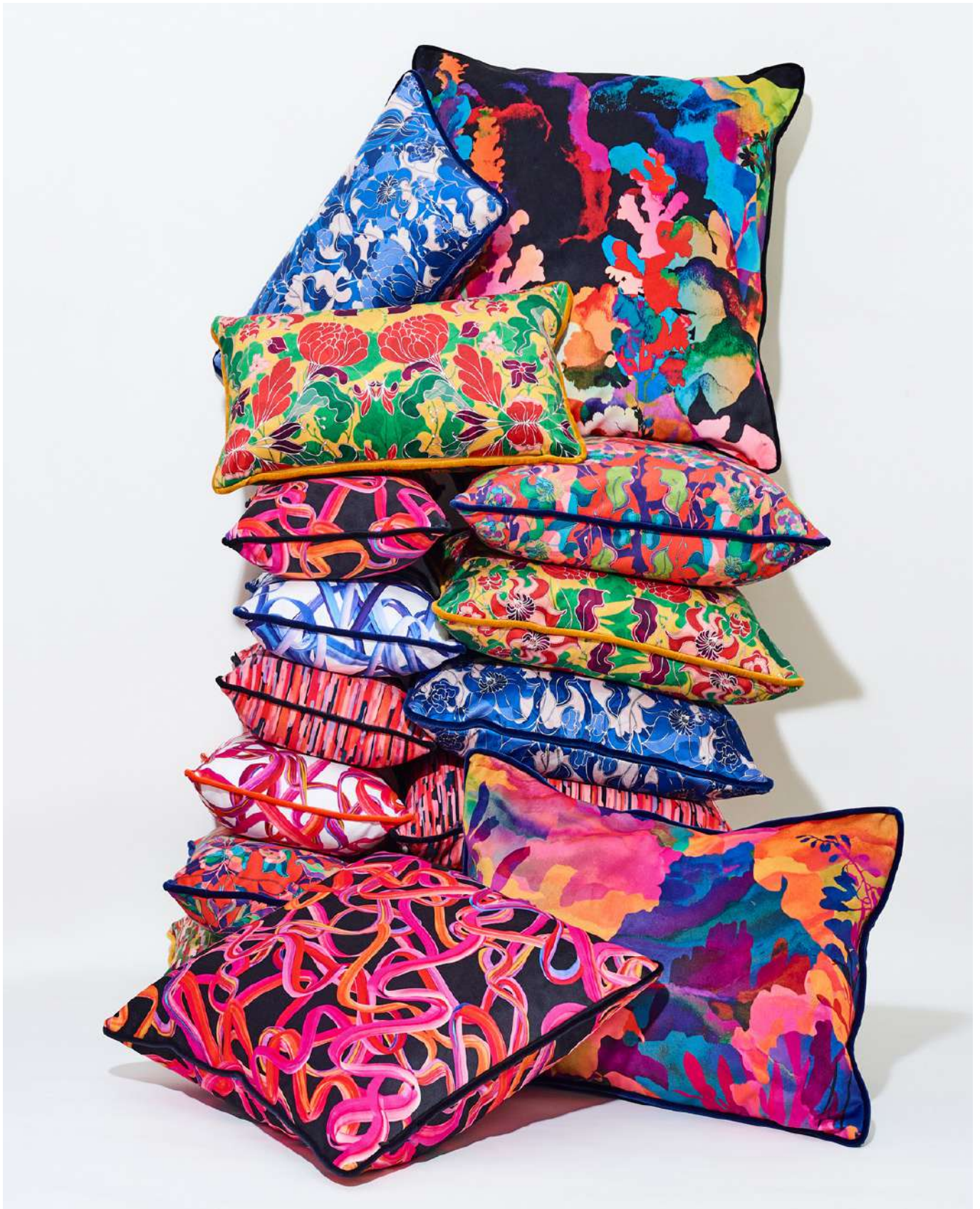
CUSHIONS FROM THE AMÉLIE CHOQUET COLLECTION