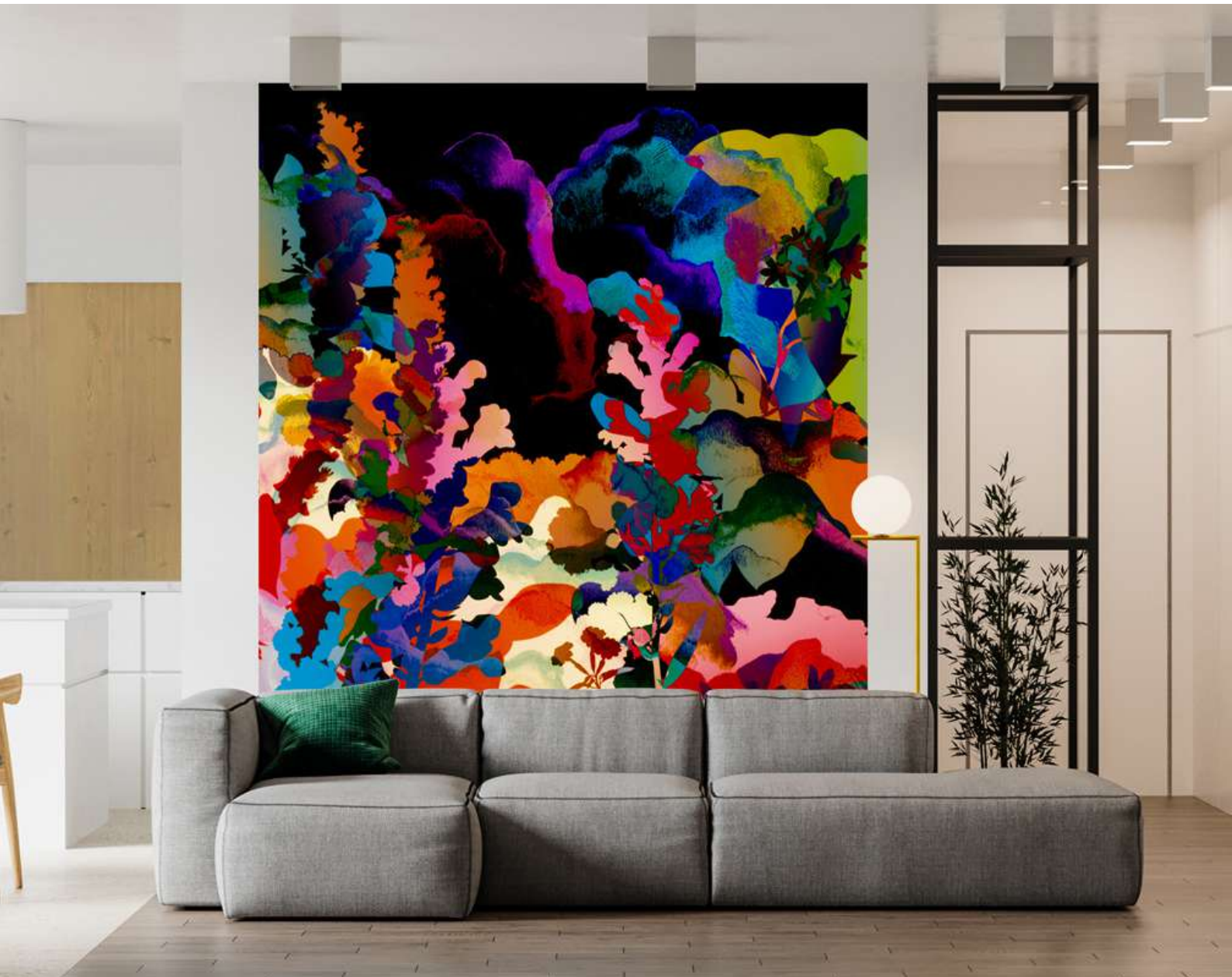
DÉCOR SUR-MESURE «LA PASTORALE»

for the universe of the house, from the floor to the ceiling, we strive to make our colors vibrate with emotion on everyday objects.