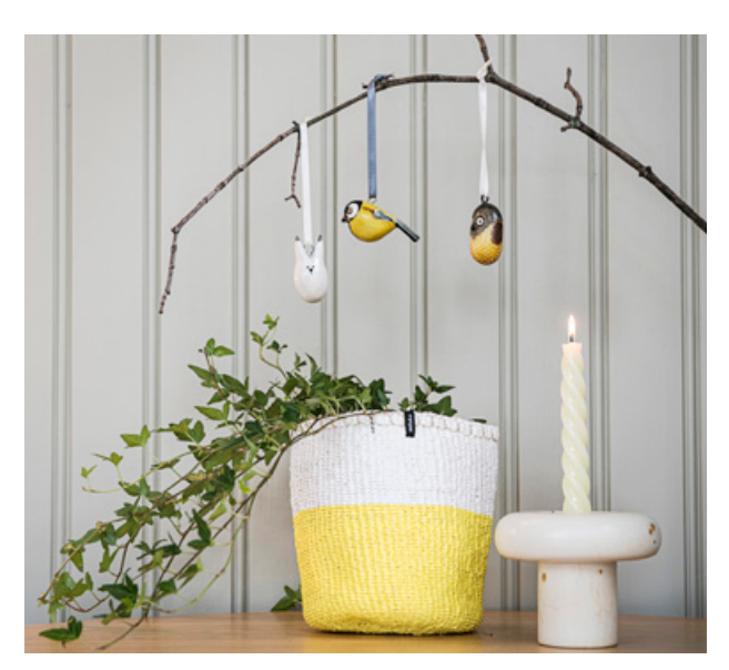
All Mifuko products are handmade and signed by the artisan who has made it. By purchasing a Mifuko product, you become an essential part of this story.

Through donations and development projects, all in close cooperation with local communities, Mifuko Trust has helped bring meaningful change, from planting trees to building ecological dry toilets.