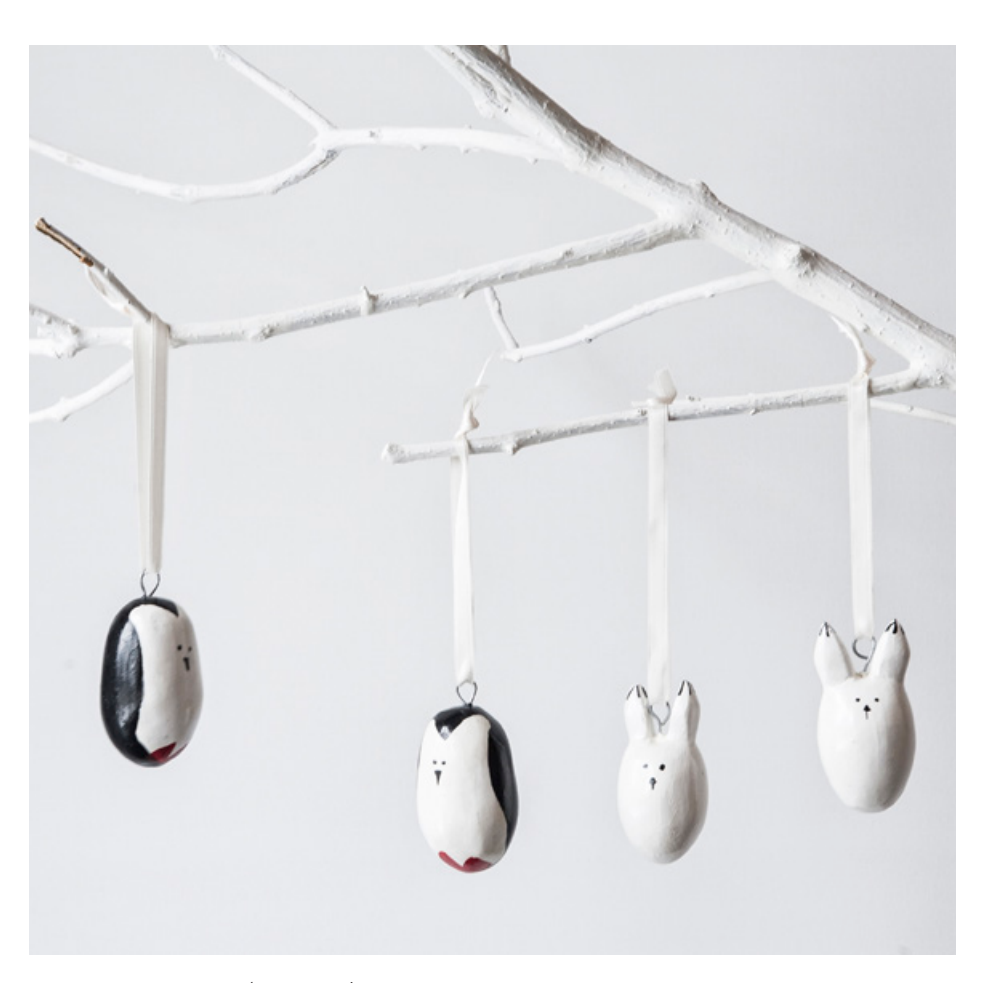
Price 3.50 € (8 € RRP) Minimum order 10 pcs per SKU H6.5 x W3.5 cm