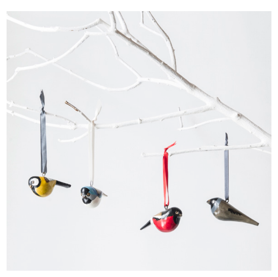
Price 3.50 € (8 € RRP) Minimum order 10 pcs per SKU H4 x W8 cm