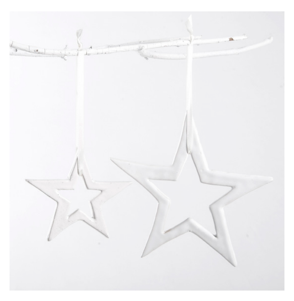
Price (XS) 5.50 € (13 € RRP) Minimum order 5 pcs per SKU H10.5 x W11 cm