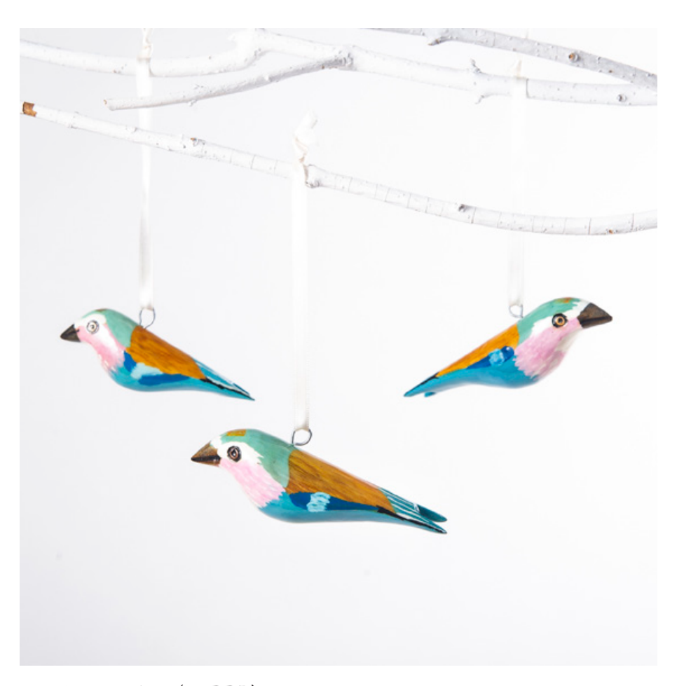
Price 3.50 € (8 € RRP) Minimum order 10 pcs per SKU H3 x W10 cm