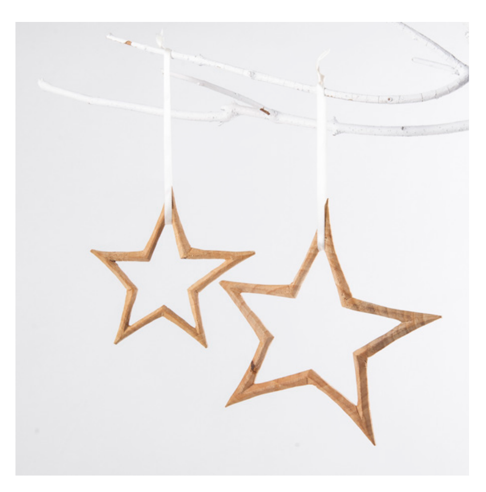
Price (XS) 5.50 € (13 € RRP) Minimum order 5 pcs per SKU H12 x W11 cm