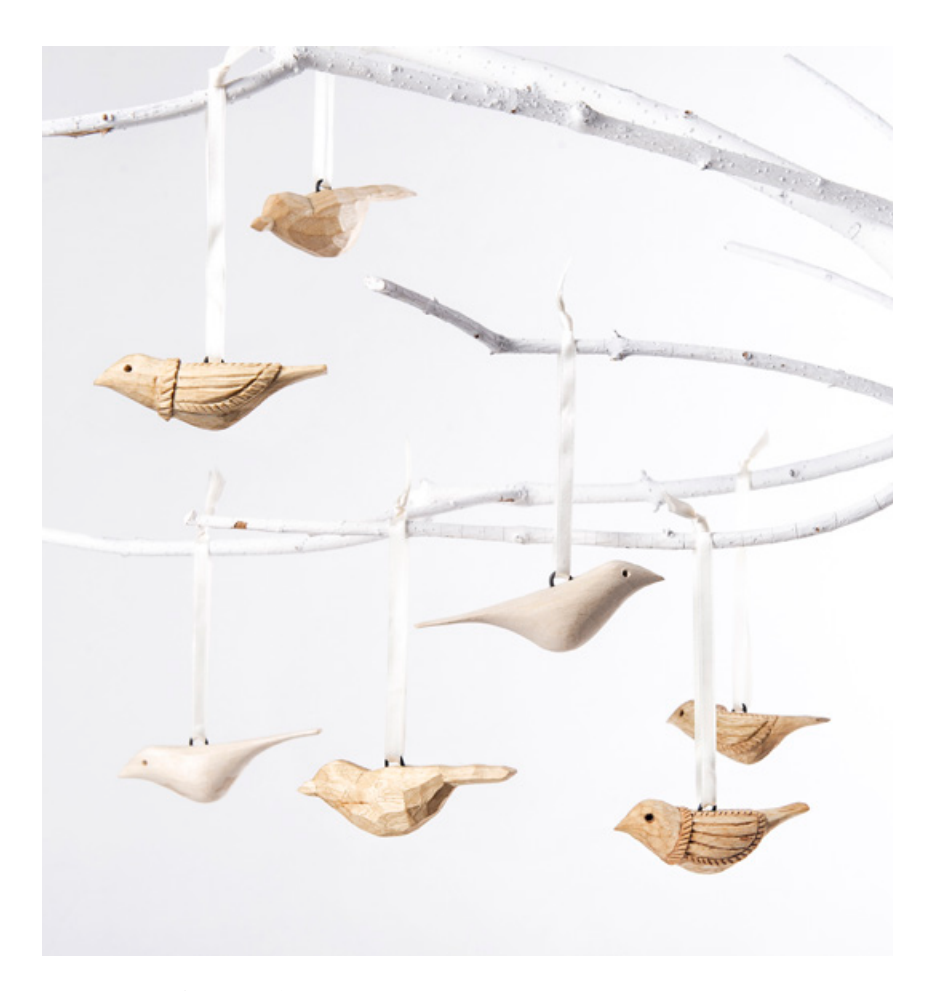
Price 3.7 € (8 € RRP) Minimum order 10 pcs per SKU H4 x W10 cm