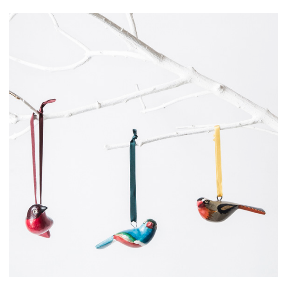
Price 3.50 € (8 € RRP) Minimum order 10 pcs per SKU H3 x W10 cm