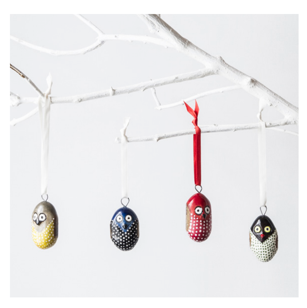
Price 3.50 € (8 € RRP) Minimum order 10 pcs per SKU H3 x W6 cm