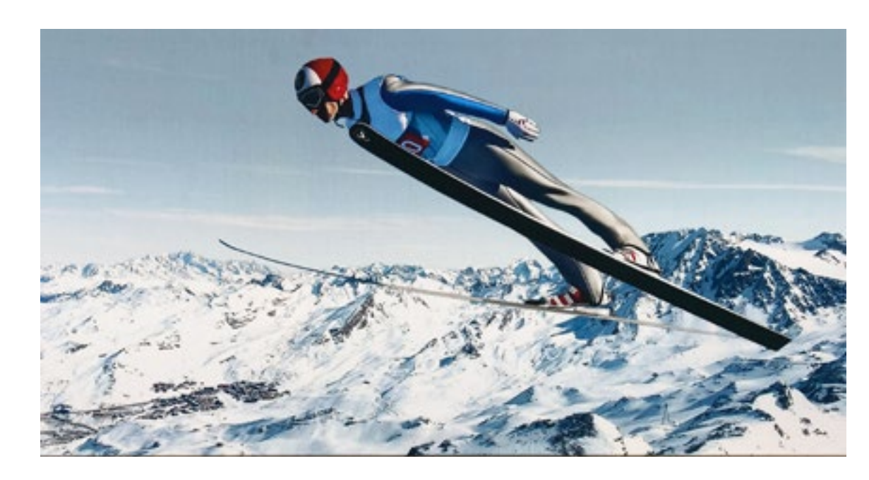
<u>Saut à Ski</u> <u>available in :</u>

- Cushions: 16"x27" - Frame Board: 47"x31" / 35"x24"