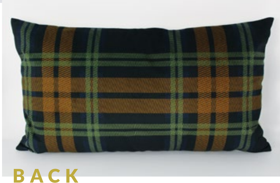
Available in: 16"x16" / 24"x24" / 16"x27"