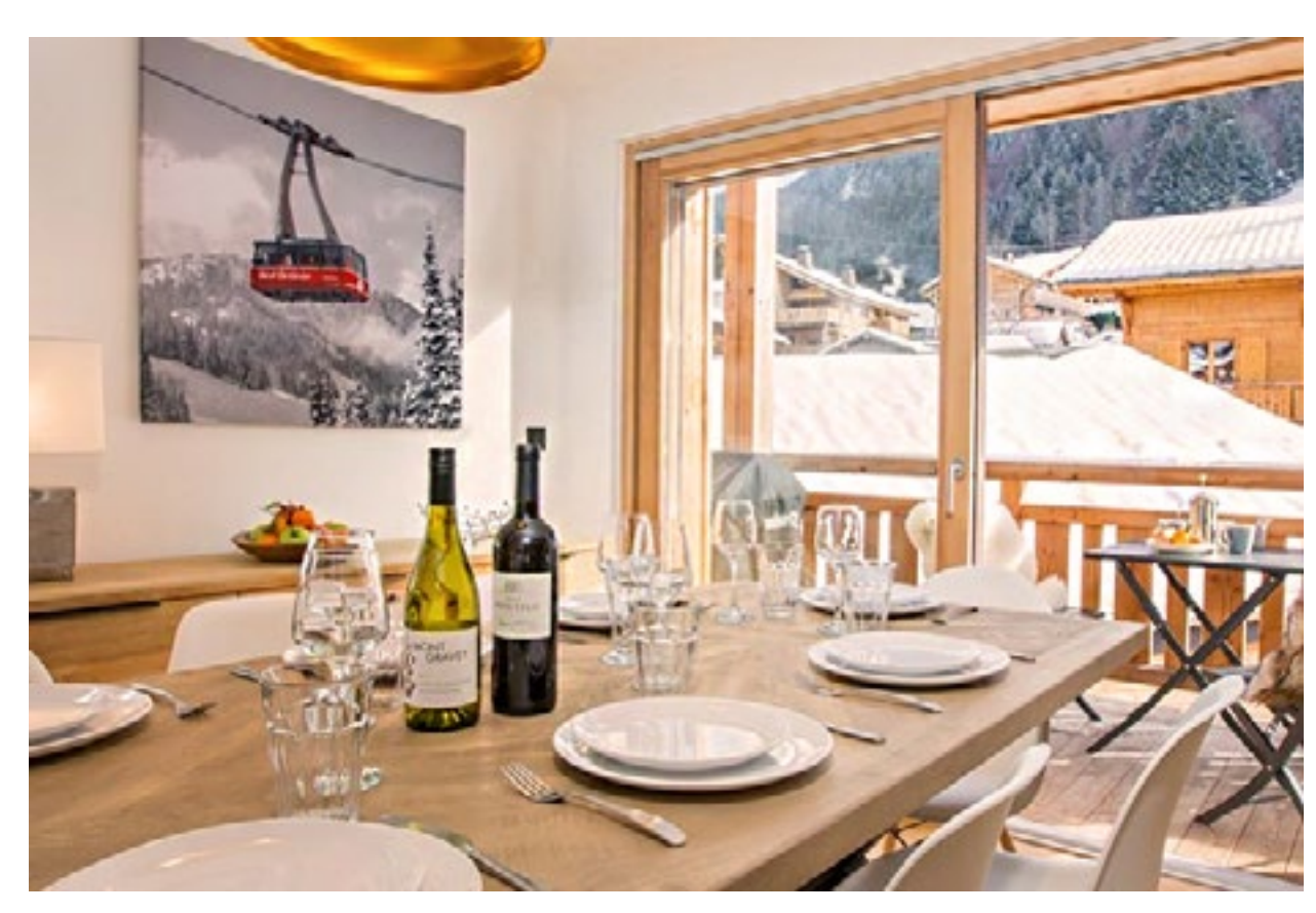
alcohol abuse is dangerous for your health, consume in moderation

All COAST AND VALLEY collections are available on the e-shop: coast-and-valley.com