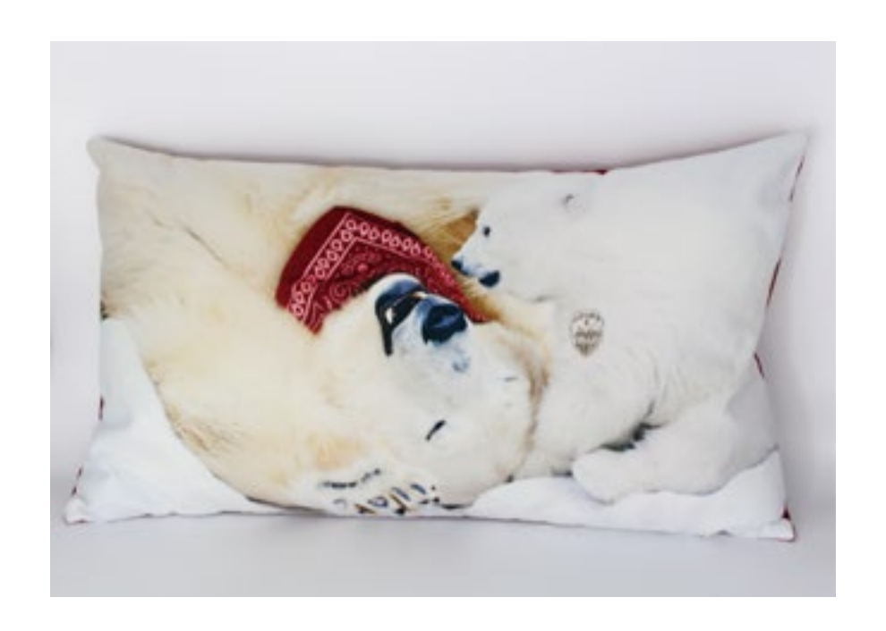
<u>Calin d'ours</u> <u>available in :</u>

- Cushions: 16"x27" - Frame Board: 47"x31" / 35"x24"