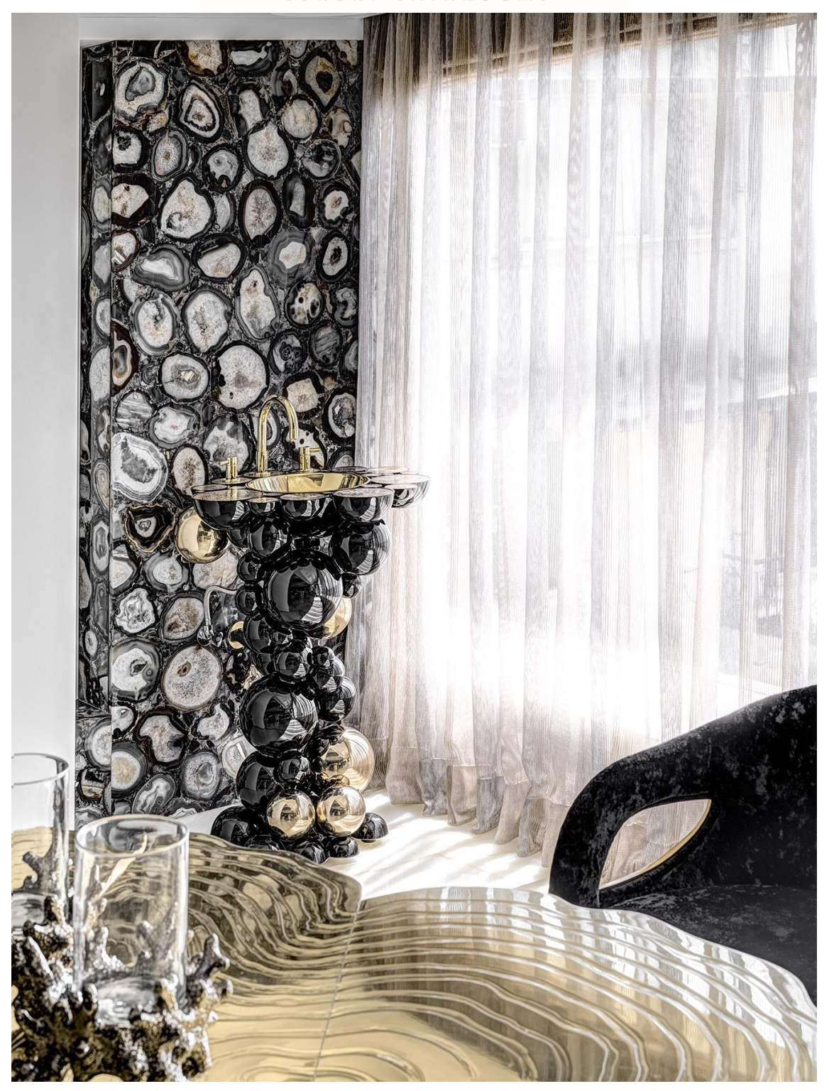
Newton Freestanding by Maison Valentina

The pièce de résistance is the Newton Freestanding by Maison Valentina. Placed against a geode wall, the Newton Freestanding serves not only as a functional piece that allows for hand-washing right before dinner, but also as a highly decorative piece. Its black and gold spheres come together to create a truly unique and versatile design piece that reflects all the beauty surrounding it.