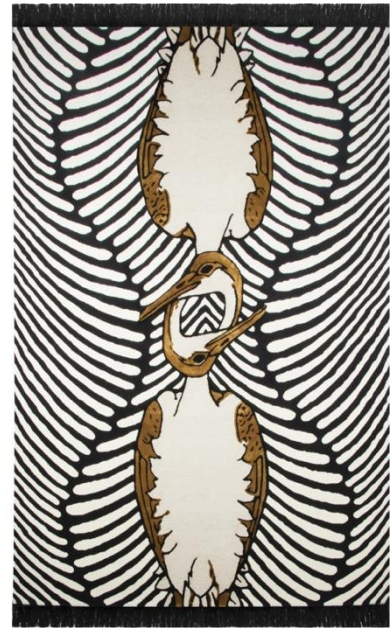
Couple Rug by Rug'Society