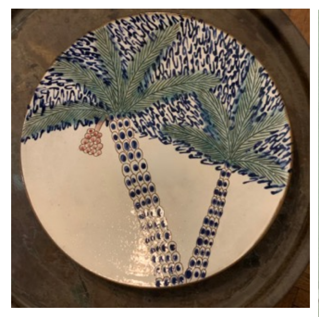
Collection Arts de la Table « Hakeem »