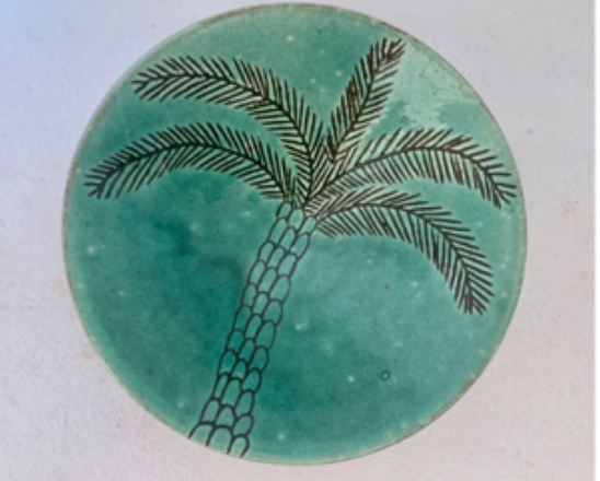
Collection Arts de la Table « Hakeem »