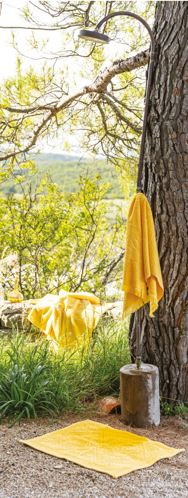
Zoé Mimosa bath from 5,90€ Enzo Mimosa bath mat 54 x 64 cm | 32,90€

The spring/summer season is the perfect time to go out and soak up the sun, the heat, and why not spend some time by the water. Vivaraise has brought to its favorite ranges - Bora, Enzo, Zoé or Cancun - new colors full of freshness for the new season.