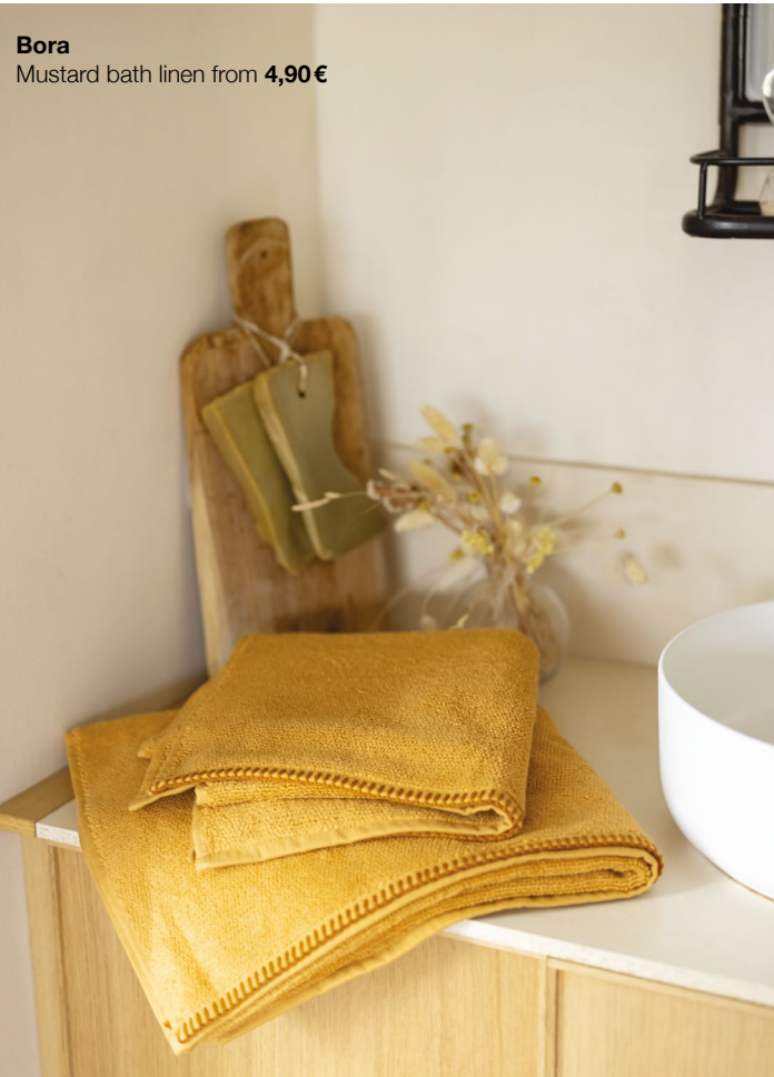
Bora Mustard bath linen from 4,90€