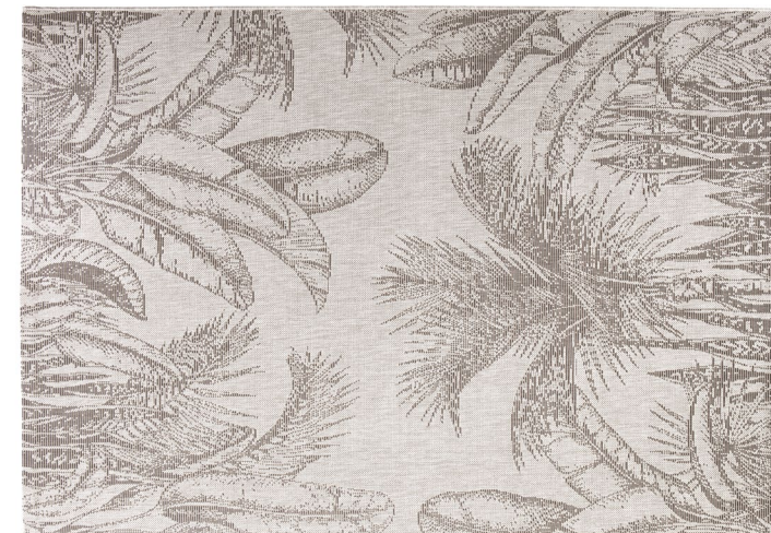
Bali Rug Outdoor Pearl 160 x 230 cm | 139,90 €

Our decorating tip: mix patterned and plain pieces for a bewitching contrast.