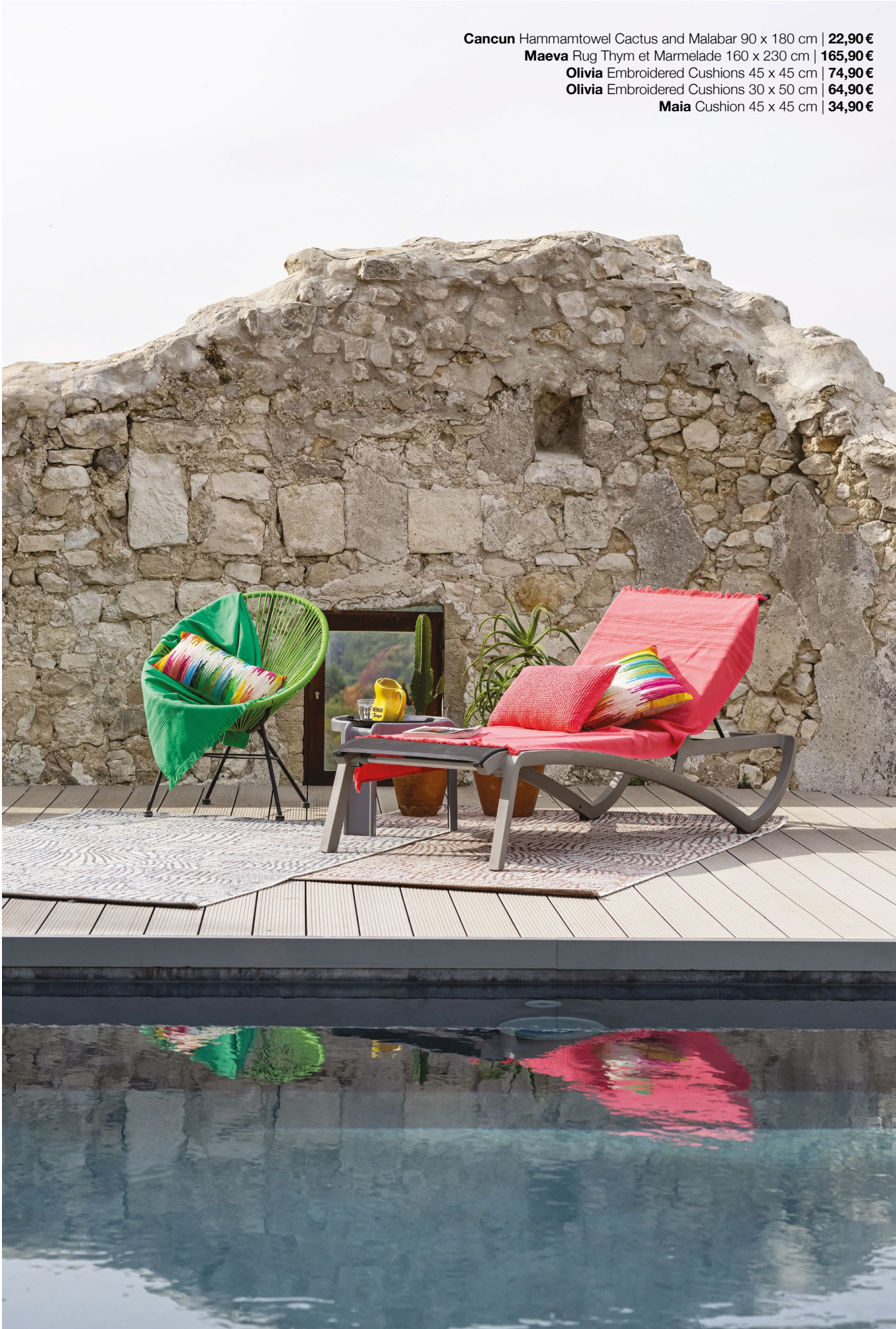
Cancun Hammamtowel Cactus and Malabar 90 x 180 cm | 22,90€ Maeva Rug Thym et Marmelade 160 x 230 cm | 165,90€ Olivia Embroidered Cushions 45 x 45 cm | 74,90€ Olivia Embroidered Cushions 30 x 50 cm | 64,90€ Maia Cushion 45 x 45 cm | 34,90€