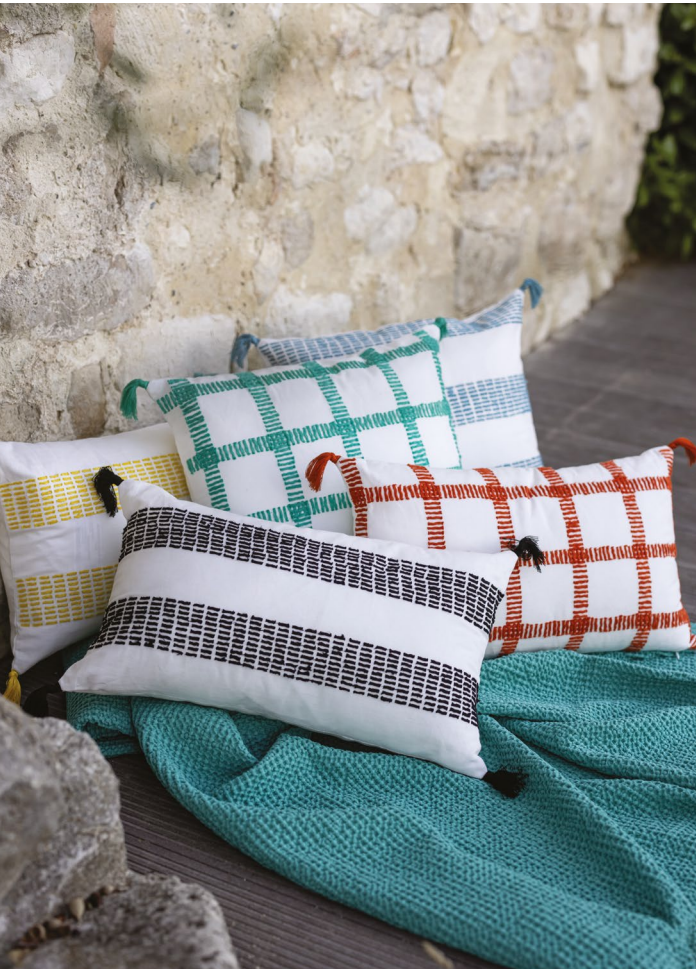
Zeff Diana Printed Cushions 40 x 65 cm | 38,90 € Zeff Diana Printed Eiderdown 80 x 180 cm | 109,90 € Paomia Rug Outdoor Pearl 160 x 230 cm | 165,90 €