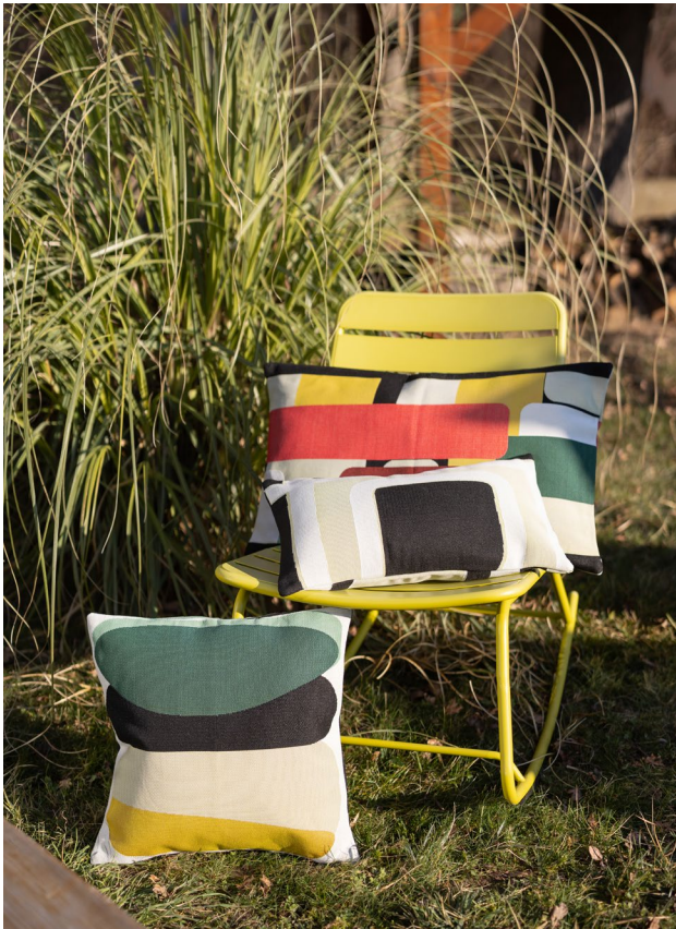
Suzy et Romy Outdoor Jacquard Cushions from 64,90 €

SUZY is a cushion with a vegetal pattern available in 3 sparkling colors: moss, lychee and mimosa. ROMY is a geometric graphic cushion with a mix of multicolor or natural colors. These cushions are contrasting on the front and back.