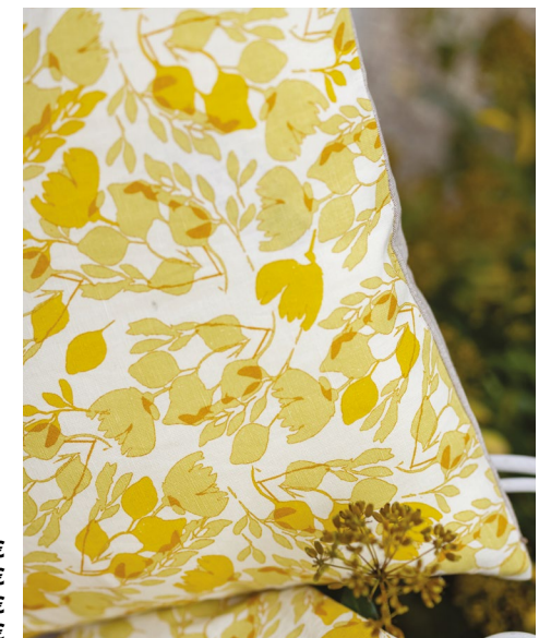
Kanoa Printed Cushions from 29,90 € Tana Cushions and Throw from 38,90 € Kanoa Printed Throw 135 x 200 cm | 109,90 € Asma Rug Outdoor Natural 160 x 230 cm | 165,90 €