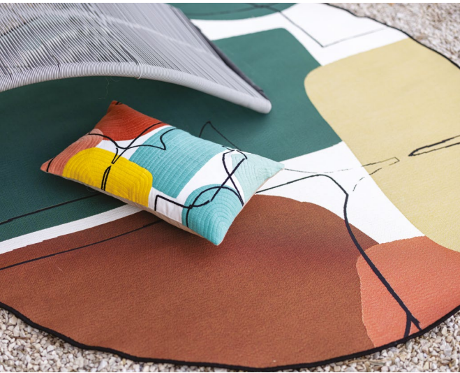
Romane Embroidered Cushion 30 x 50 cm | 64,90 € Romane Rug Outdoor ø 160 cm | 129,90 €