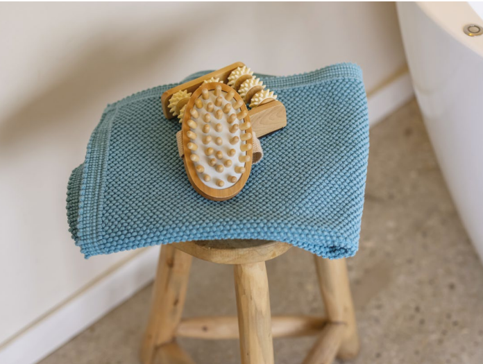
Etia Quartz bath mat 54 x 64 cm | 28,90€