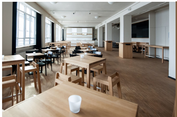
Café Oelsner - Hambourg - Germany

The traditional skills of cabinet making, combined with a design and innovation approach, give birth to authentic and resolutely contemporary collections.