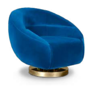
MANSFIELD ARMCHAIR ERNEST SIDE TABLE