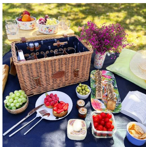
Blue Saint-Honoré (4 persons) : £160.60

Thanks to its integrated wooden table, the Saint-Honoré basket knows how to receive its guests! Also equipped with a waterproof coated tablecloth and cotton napkins, it is a chic and practical basket for a comfortable lunch on the grass. Its cutlery is stored in a monogrammed pocket, for an even more upscale look. All straps are made of real leather, giving it a luxurious and timeless look! Available in blue and green for 4 persons.