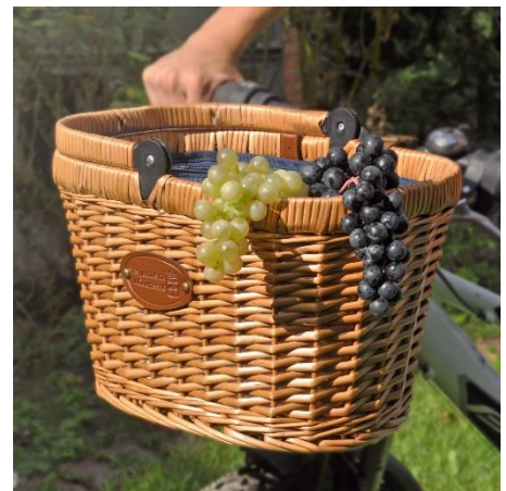
Chantilly Blue Bicycle Basket : £37.04

The Blue Chantilly and Red Vichy Baskets are a must-have for long bike rides! Their large isothermal compartments allow you to store all kinds of snacks and drinks, keeping them fresh.