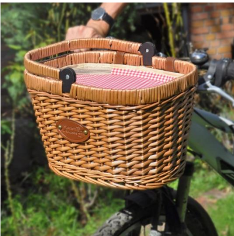
Chantilly Red Gingham : £37.04

Useful and practical, they can be easily attached to the handlebars of a bicycle. With their folding straps, they are easy to carry, and can also be used as baskets for trips to the market.