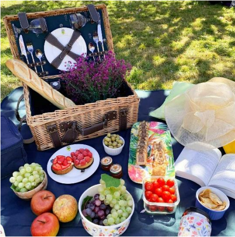
Blue Champs-Elysées (2 persons) : £167.50

The Champs-Elysées has been specially designed for picnics with a royal touch! Always made of genuine leather, the Champs-Elysées basket is particularly luxurious. It is lined with a monogrammed fabric, combined with high quality grained and stitched leather. With its porcelain plates, stainless steel cutlery, glasses, salt and pepper shakers and corkscrew, it has everything you need for a successful picnic.