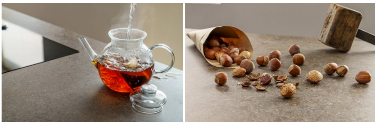
Kitchen countertop with IN-SIDE – Porfido Marrone Fiammato finish.

Laminam's new international record rewards the natural aspect and superior quality of its surfaces. It has become the first manufacturer of ceramic slabs in the world to obtain "Solid Surfacing for Food Zone" certification. No longer "Ceramic Solid Surfacing for Splash Zone": the NSF - American National Standard for Food Equipment, the most prestigious independent organisation for the certification of food zone products in the private and commercial restaurant sector in the US and Canada, has now authorised the use of Laminam finishes as surfaces intended for direct contact with foodstuffs, and any associated liquid condensate they produce.