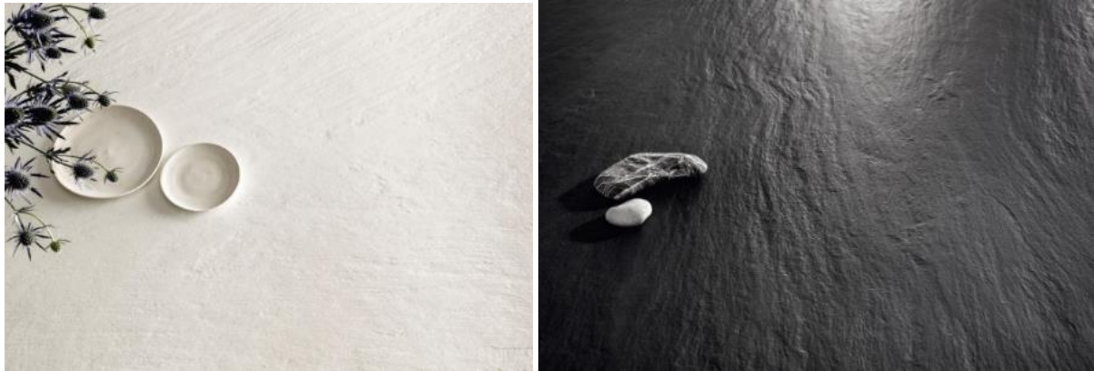
Two Laminam products introduced in 2020: left, Ardesia a Spacco Bianco and right, Ardesia a Spacco Nero from the I-Naturali series

NSF certification is yet another goal of excellence achieved thanks to the staff of Laminam's Quality Management office. By liaising with authoritative international institutions, it is constantly engaged in the pursuit of product certifications which demonstrate the superior quality of Laminam surfaces and the natural aspect of the raw materials used to make them, with a view to sustainability across the board. The results with which Laminam slabs pass stringent international tests are a reflection of the highest quality standards and of their supreme safety in a variety of applications: exterior façades, flooring and cladding, kitchen countertops and tabletops.