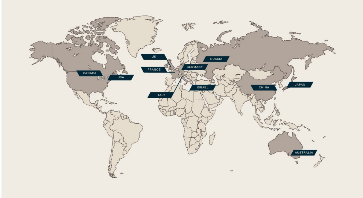
(Pictured: Laminam's presence around the world)

France, Laminam China, Laminam Japan, Laminam Israel, and the recently formed Laminam Australia.