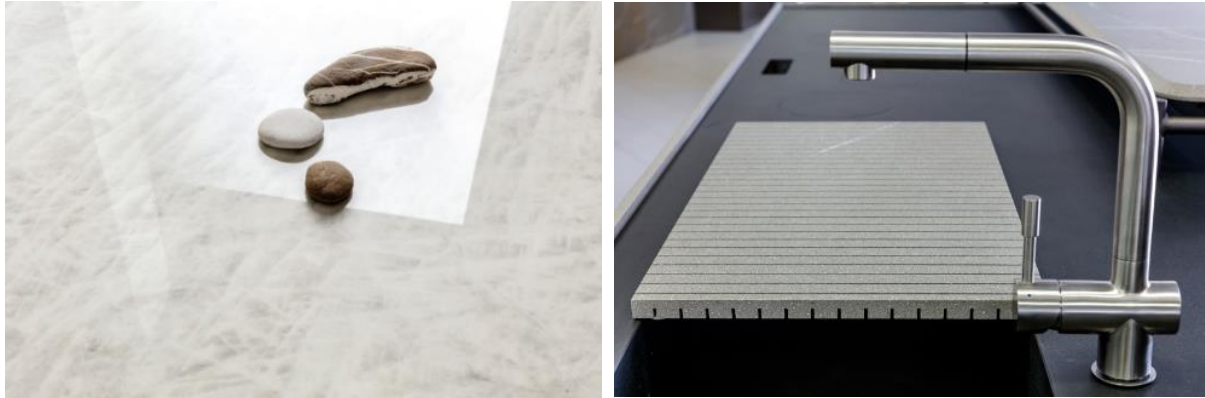
Left, another 2020 launch: I Naturali – Cristallo Lucidato, surface intended mainly as kitchen countertop; right, kitchen with IN-SIDE – Pietra Piasentina Grigio finish

themselves. The breadth of its catalogue and this new certification issued by the globally recognised North American body make Laminam one of the most credible big players in kitchen countertop surfaces, establishing itself as a leader and benchmark of the sector.