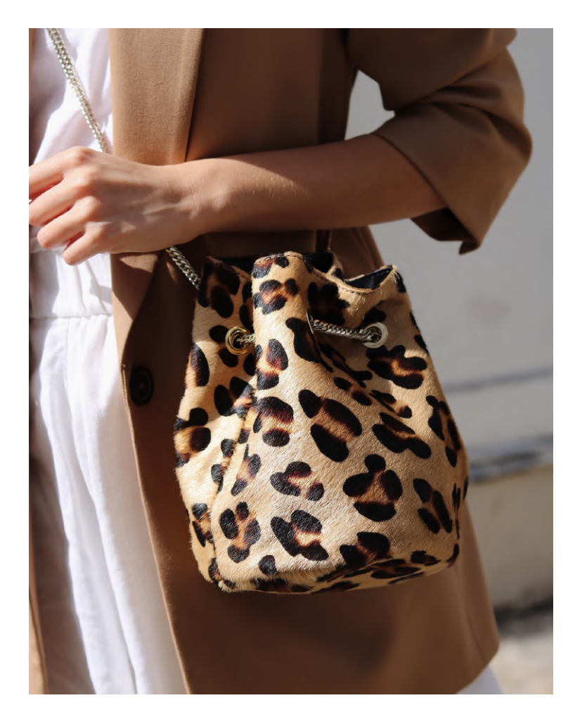
Colours: printed pony/black calf, brown calf/black tweed with lurex

The Reverseau bag is a reversible bag with contrasting materials and colors on both front and back, allowing us to have 2 bags in 1. Perfect for travel, it will fit perfectly with all our days and nights outfits. This bucket bag is just big enough to hold daily essentials. Double the shoulder strap to wear it on the shoulder or leave it as it is to wear yours crossbody.