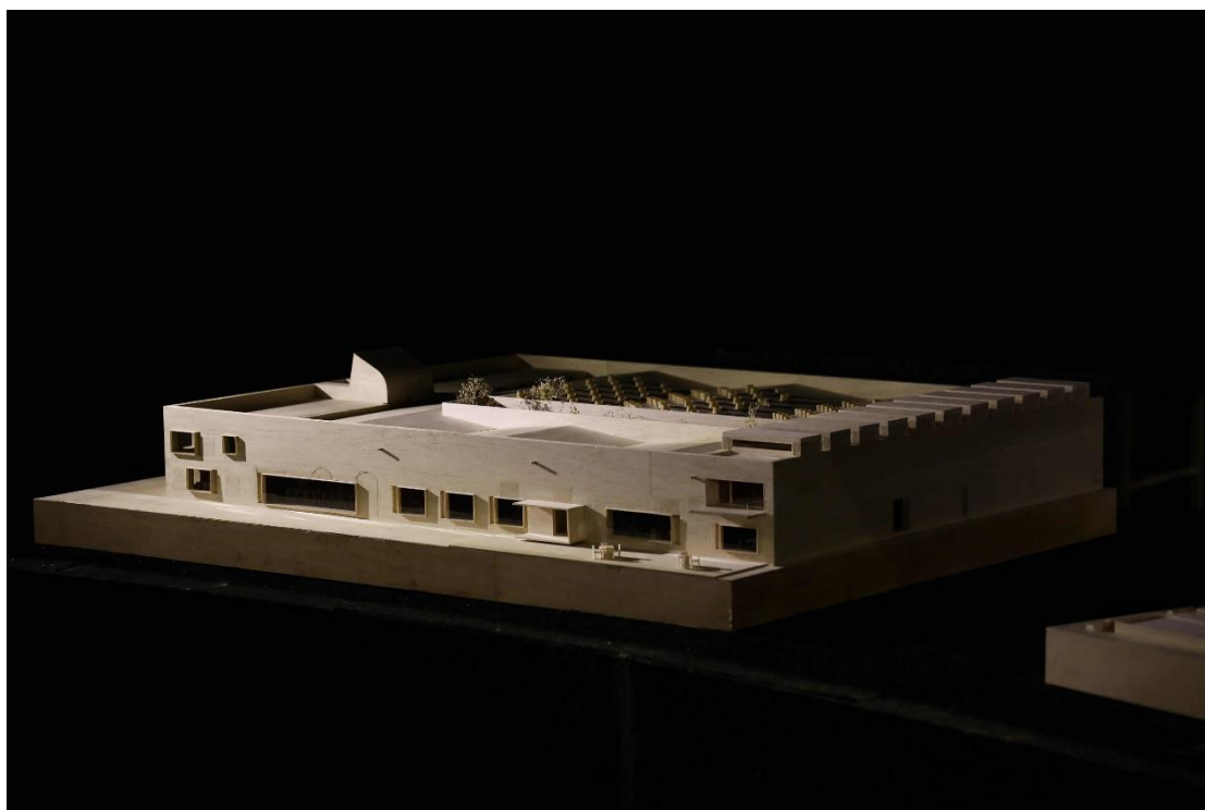
Beijing headquarters building model