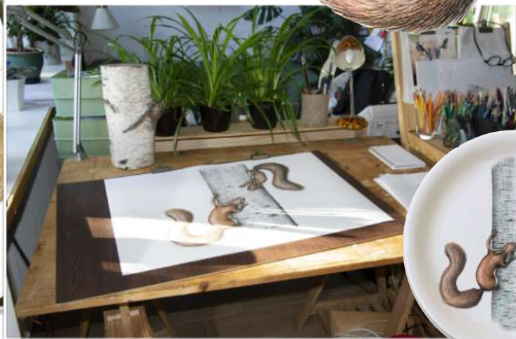
7 - THE FINAL ORIGINAL ARTWORK!