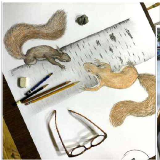
6 - CORRECTING