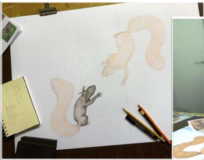
4 - STARTING OUT