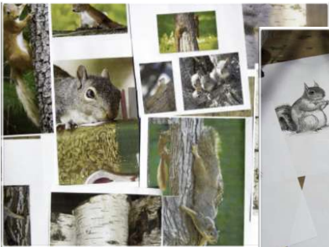
1 - RESEARCH,...