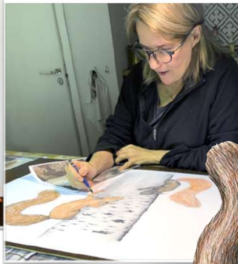
5 - METHODOICAL WORK