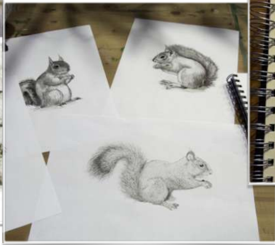
2 - SKETCHING