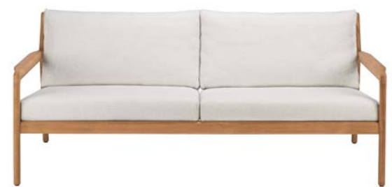
JACK OUTDOOR SOFA 100% SOLID TEAK AND 100% polypropylene fabric

OFF WHITE 10251 180 × 90 × 73 cm 71" × 35" × 29" seating height: 40 cm - 16"