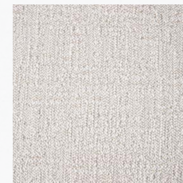
OFF WHITE UPHOLSTERY FABRIC