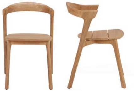
BOK OUTDOOR DINING CHAIR 100% SOLID TEAK

10155 50 × 54 × 76 cm 20" × 21" × 30" seating height: 47 cm - 19"