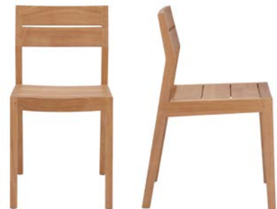
EX 1 OUTDOOR CHAIR 100% SOLID TEAK

10285 43 × 56 × 83 cm 17" × 22" × 33" seating height: 47 cm - 19"