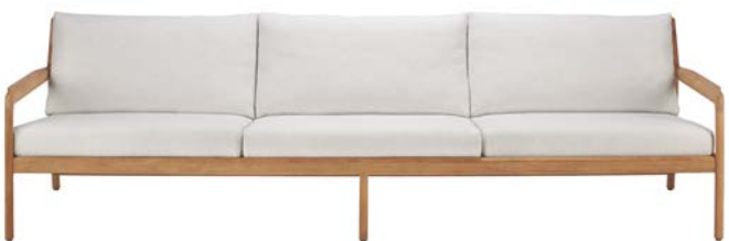
JACK OUTDOOR SOFA 100% SOLID TEAK AND 100% polypropylene fabric

OFF WHITE 10252 265 × 90 × 73 cm 104" × 35" × 29" seating height: 40 cm - 16"