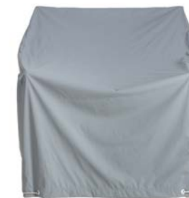
JACK OUTDOOR RAINCOVER