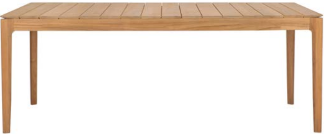
BOK OUTDOOR DINING TABLE 100% SOLID TEAK

For more detailed product information, visit our website www.ethnicraft.com