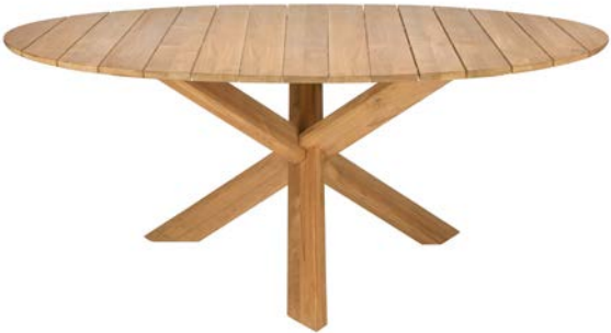
CIRCLE OUTDOOR DINING TABLE 100% SOLID TEAK