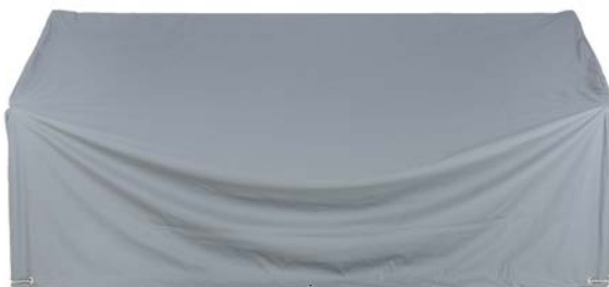
JACK OUTDOOR RAINCOVER 19971 180 cm - 71"