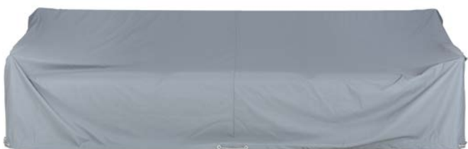
JACK OUTDOOR RAINCOVER 19972 265 cm - 104"