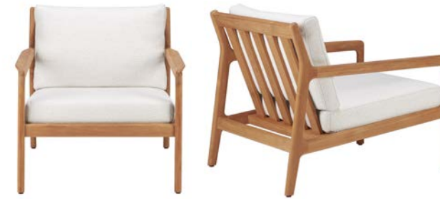
JACK OUTDOOR LOUNGE CHAIR 100% SOLID TEAK AND 100% polypropylene fabric

OFF WHITE 10250 76 × 90 × 73 cm 30" × 35" × 29" seating height: 40 cm - 16"