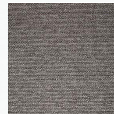
MOCHA UPHOLSTERY FABRIC