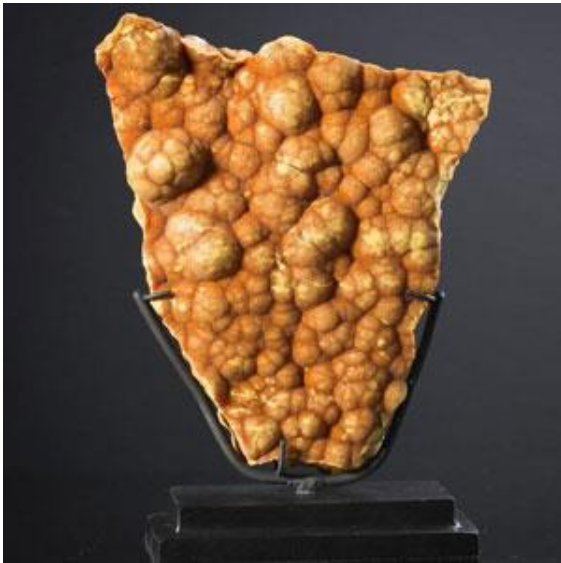
PUMI738-2 Orpiment of Peru