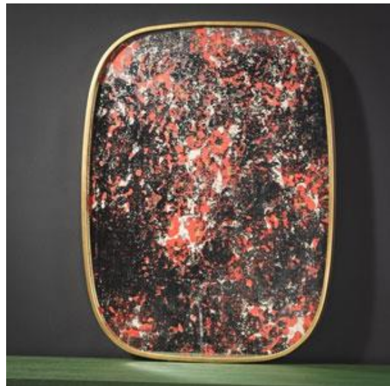
MR046 Brassed oval mirror with pink flowers