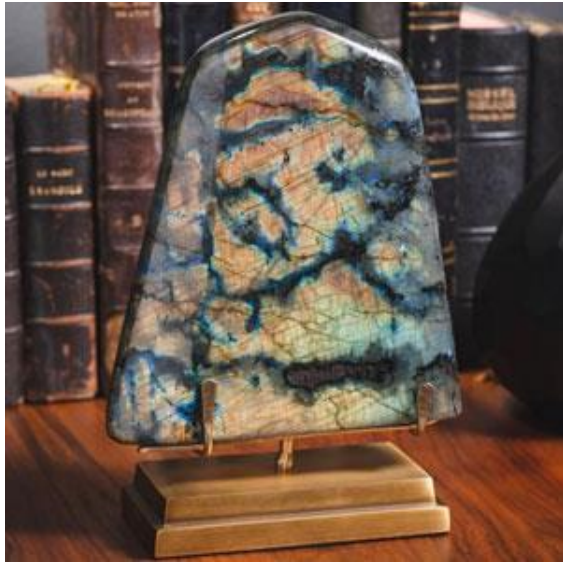
PUMI1725 Polished labradorite Madagascar