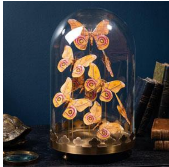
IN170 8 butterflies ANTHERINA SURAKA with brass base