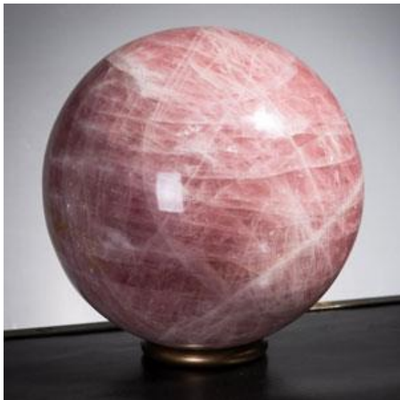
PUMI1485 Rose quartz sphere (39kg) from Madagascar