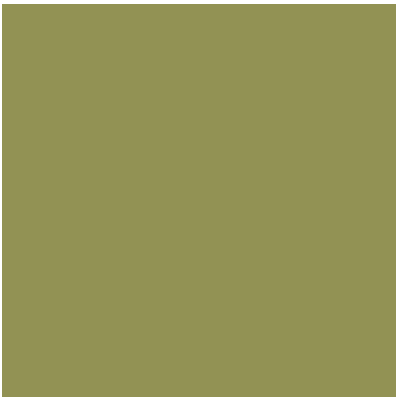
Sage Smudge #929254