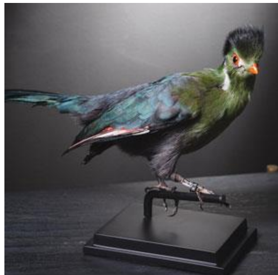
PU822 White-cheeked Touraco