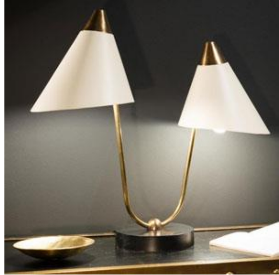
LU151 Double shade lamp