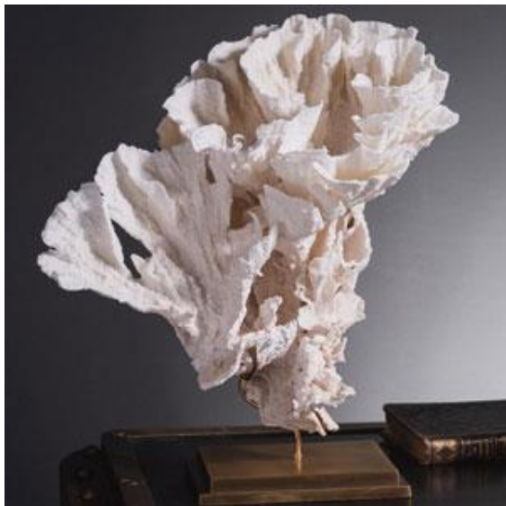
CO586-2 White coral MONTIPORA SP on brass base