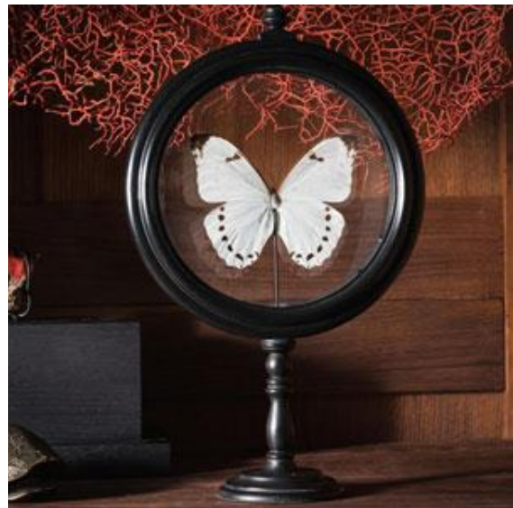
IN091 White morpho Luna in round glass display box