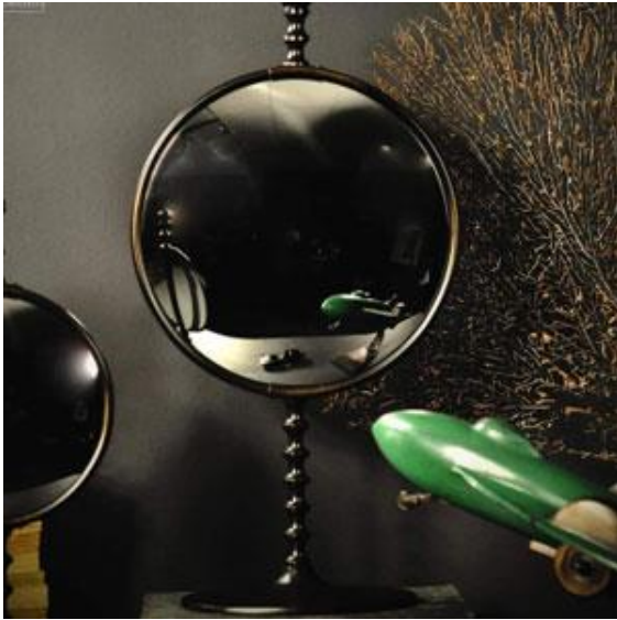
MR010 Convex mirror on stand LARGE