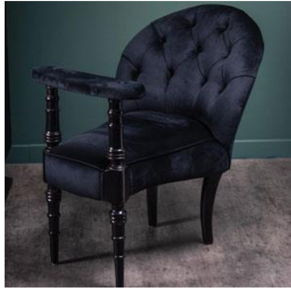
SI016 Black velvet casino armchair