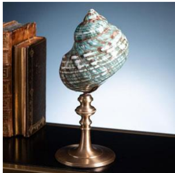
AN338 Polished PETHOLATUS on brass stand