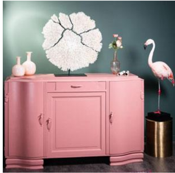
PUMB133 Real antique sideboard -PINK finish