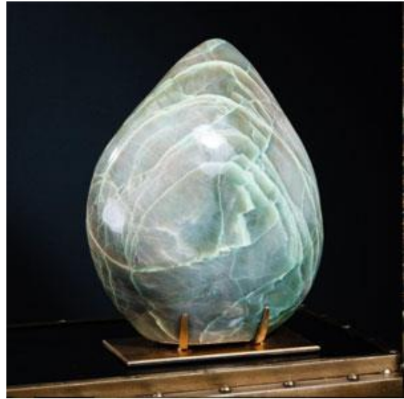
PUMI1779 Huge green Garnierite (30.6kg) Madagascar