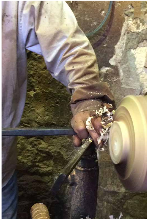
"Offering" tray Serving or decorative tray made in Egyptian turned timber rose wood. Guaranteed without any chemical or hazardous products for food usage. Dimensions: Ø approx. 30cm Designed by Barbaseb from Furn Paris for TakeCaire. Collection: OFFERING