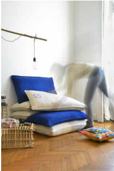
"Check Point" Sofa Handmade Modular couch from 100% Egyptian cotton. Cover filled up with Egyptian cotton fiber. A hidden Khayameya lotus pattern is stitched on each cover for an intuitive assembly purpose. Dimensions: L 200 cm, W 100 cm Designed by Samuel Aden for TakeCaire. Collection: REVOLUTION