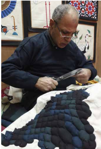
"Naguib" Stool Stool in Egyptian sorsoa or pine wood and removable upholstery in 3D khayameya. 100% Egyptian cotton filled with Egyptian cotton fiber. Limited Edition. Dimensions: H 42cm, W 30x30cm Designed by Samuel Aden and Nathanaël Abeille for TakeCaire. Collection: NAGUIB