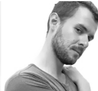
Barbaseb Duo Designers from Furn