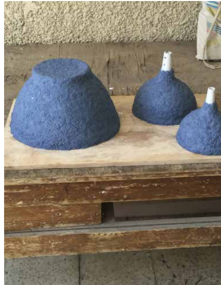
"Uphance" Pendant Lighting Pendant lamp made of red copper finish mirror and molded recycled blue paper or jean pulp shade. Designed by Barbara Balland and Sebastien Tardif for TakeCaire. Supplied with 2 lm of fabric cable. Dimensions: shade Ø 15 cm H 14cm - wire 200 cm Collection: UPHANCE